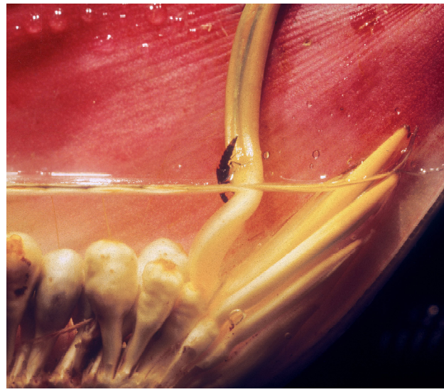
Figure 8. The interior of an H. bourgaeana bract showing (a) siphons of Quichuana larvae extending from between the flower bases to the water surface, (b) a large larva of the predatory mosquito Toxorhynchites moctezuma in the water, and (c) an adult of Platydracus fauveli perched above the water but apparently reacting to events in the water.