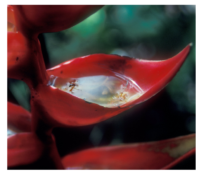
Figure 2. Culex bihaicola female ovipositing in a bract of H. bourgaeana , Parque Metlac, July 1992.

At each weekly visit, beginning on 20 May, a shoot with 7 to 11 undamaged bracts was selected haphazardly (from a different patch of plants on each occasion). Bracts were numbered with felttipped pen, beginning with the topmost, then the rachis was cut beneath each bract in turn and the