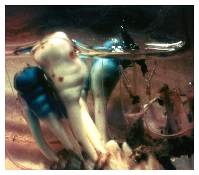
Figure 10. An adult Platydracus sp. 32 perched on an H. bourgaeana fruit extends its head and thorax into the water, opens its mandibles, and snaps at passing Culex larvae. This is a "fishing staphylinid" with behavior similar to that of a bear attempting to catch salmon at rapids on a Canadian river.

Immersion. Using adult Platydracus captured on 20 May, on the following day an adult of P. sp. indet. (#32) was placed into a glass jar fitted with a water-filled Heliconia bract cut down vertically (to about half its original height) to fit. It ran immediately to immerse itself in the water, apparently forming a plastron, seen as a silvery coating of air around the elytra. Perhaps it gripped the substrate to hold itself immersed. Identical behavior was displayed on the same day by a female P . fauveli . When circular plastic containers became available (31 May) and were fitted with coffee filters and filled with water, seven P. fauveli were placed into individual containers; one of these immediately (before the jar lid was replaced) immersed itself in the water and formed a plastron, probably gripping the rough surface of the paper. These observations, albeit under artificial conditions, confirm the original field observation in July 1992 that these beetles (or at least two of the four species) immerse themselves in water when alarmed.