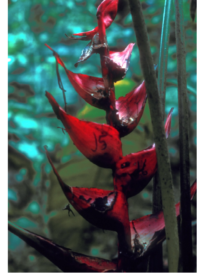
Figure 11. Bracts of H. bourgaeana destroyed by grackles ( Quiscalus mexicanus ) in August 1995 in Parque Metlac.

Coleoptera: Scarabaeidae: Ataenius chapini Hinton (described as A. frankorum Deloya 2000, but synonymized by Stebnicka 2001), Diplotaxis hirsuta Vaurie 30.v.1995(1), 6.vi.1995(1), 20.vi.1995(1), 4.vii.1995(1),11.vii.1995(1), 18.vi.1995(1), 1.viii.1995(1), 10.viii.1995(1), Hoplia squamifera Burmeister 20.vi.1995(1), Onthophagus violetae Zunino 20.v.1995(1), 6.vi.1995(1).