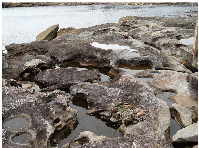
Fig. 5. Cliff seepage and rock platform habitats at Lurline Bay, Coogee. Photos: P. Adam, August 2013.

stems after shedding of leaves, outer rims of petioles carried on as decurrent narrow ridges down stems (at least in dried material). Racemes leafy, erect, terminal, often compound-paniculate, initially coniform, gradually elongating, many-flowered, 3–15 cm long, lower bracts spatulate, identical to leaves except for shorter petiole, gradually reduced upward (corymbose at flowering/raceme-like in fruit); pedicels 5–15 (–25) mm long, about as long as or slightly shorter than the leaf-like bracts, glabrous. Flowers 5-merous; calyx 3.5–5 mm long, deeply divided, lobes broadly lanceolate to elliptic (or ±oblong), with midrib, black glandular-punctate, margin membranous whitish-hyaline, apex subacute to obtuse; corolla white to pinkish, tube 2–3.5 mm long, petals 5–6 mm long, the lobes narrowly obovate or ligulate-oblong, (with a few glandular dots at obtuse apex). Capsules globose-ovoid, yellow to reddish brown, 4–6 mm diam., lightly pitted, glabrous, stigma/style persistent, longitudinally dehiscent by valves, many-seeded. Figs 1, 2 & 4.