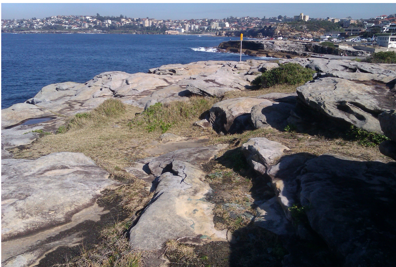
Fig. 3. Sandstone headland habitat at Burrows Park, Clovelly. Photo: M. Leary, July 2013.