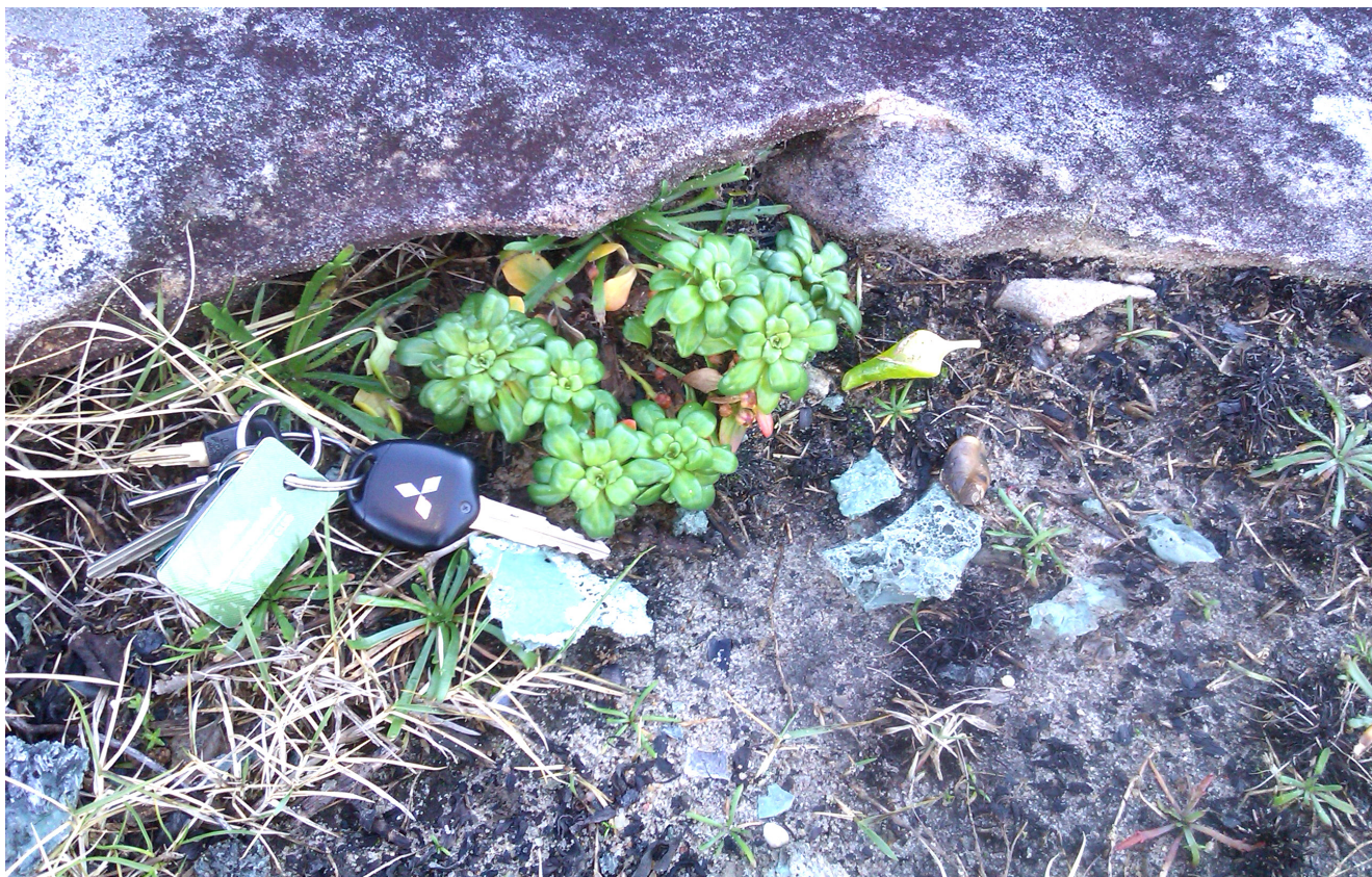
Fig. 2. Young plants growing on Clovelly headland, Burrows Park. Photo: M. Leary, July 2013.