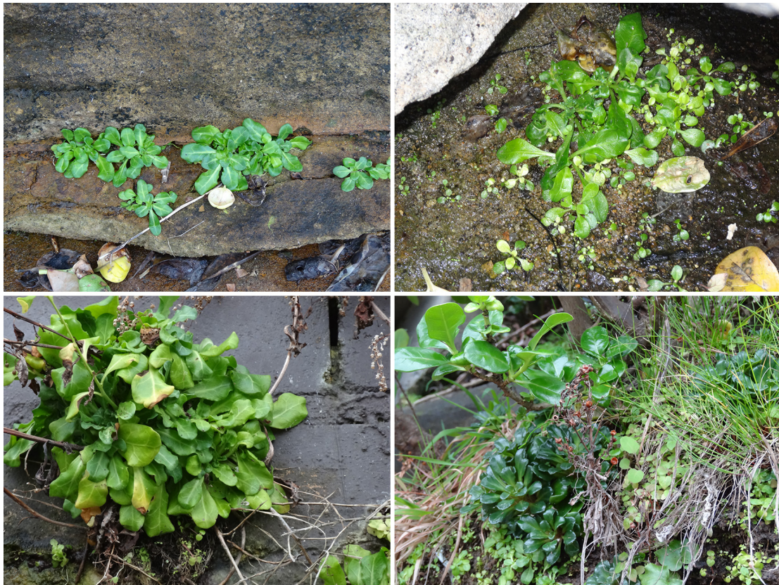
Fig 4. Plants at Lurline Bay, Coogee. Photos: P. Adam, August 2013.

Herb, biennial or short-lived perennial; stolons stout, short; stems solitary or tufted/many, ascending to erect, 10–40 (–50) cm high, stout, terete, slightly fleshy, simple or shortly branched above, glabrous, minutely black-dotted (i.e. with