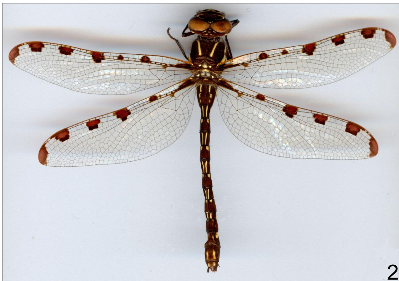
Figure 2: Austropetalia patricia Tillyard, female specimen, dorsal view.

duced or lacking pale markings on labrum, vertex and abdominal segment 10, and the black, tapered pterostigma. It is interesting that A. annaliese is apparently closer to A. tonyana from the Australian Alps and further south than to A. patricia which is centered in the Blue Mountains. It is probably geographically separated from A. patricia only by the Hunter River valley, whereas a large area between somewhat north of Canberra and the Hunter River valley (= approximate distributional range of A. patricia ) apparently separates it from A. tonyana . Both, the northern limit of the southern highlands and the southern margin of the northern tablelands of New South Wales are regions where ecological and physiographic boundaries are known to coincide with taxonomic discontinuities in numerous Australian freshwater insects including Odonata (Watson & Theischinger 1984), but usually with the immediate neighbour species most closely related to each other.