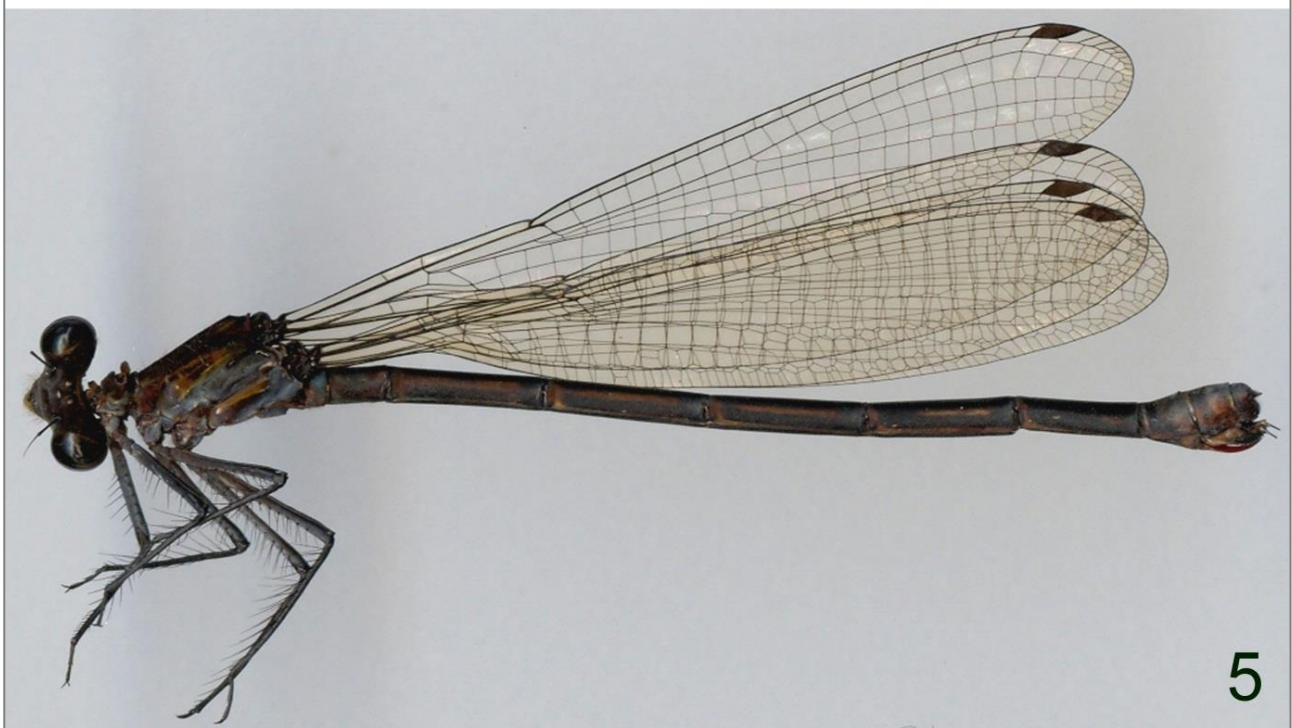
Figs 4, 5. Hylaeargia lisae sp. n. paratype female: (4) in life; (5) preserved.

Material. – Holotype ♂ (MAGNT): Papua New Guinea, Hindenburg Range, Western Province, Tupnonbil area (5.12017°S, 141.25821°E, 1,817 m a.s.l.), 19-ii-2013, M. Hammer leg. Paratypes (SAMA): Papua New Guinea: 1 ♂, same data as holotype; 1 ♀,