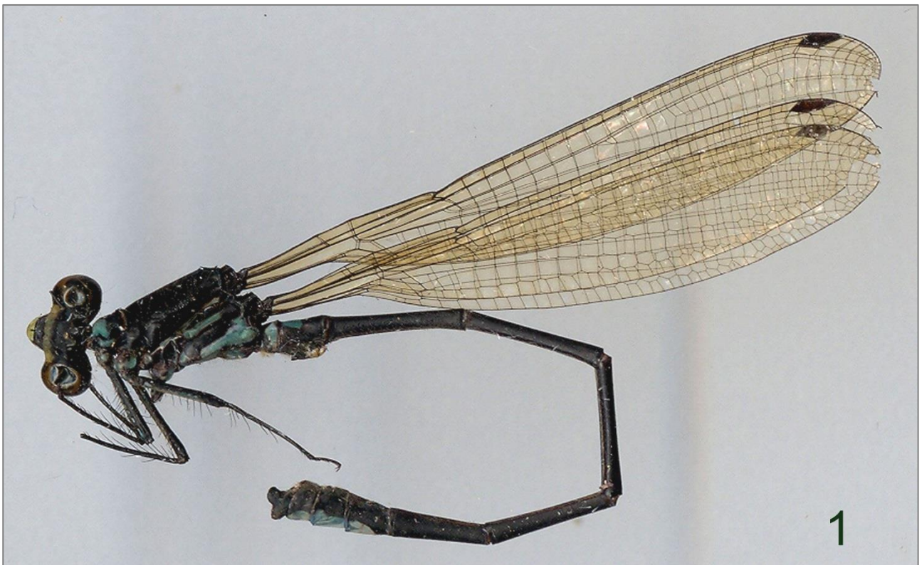
Fig.1. Hylaeargia vanmastrigti sp. n. Holotype male.

Material. – Holotype ♂ (RMNH): Indonesia, Papua Province, Abmisibil, Okbon, Star Mountains, 2,000 m a.s.l., 11-12-xii-1990, HJG van Mastrigt leg.