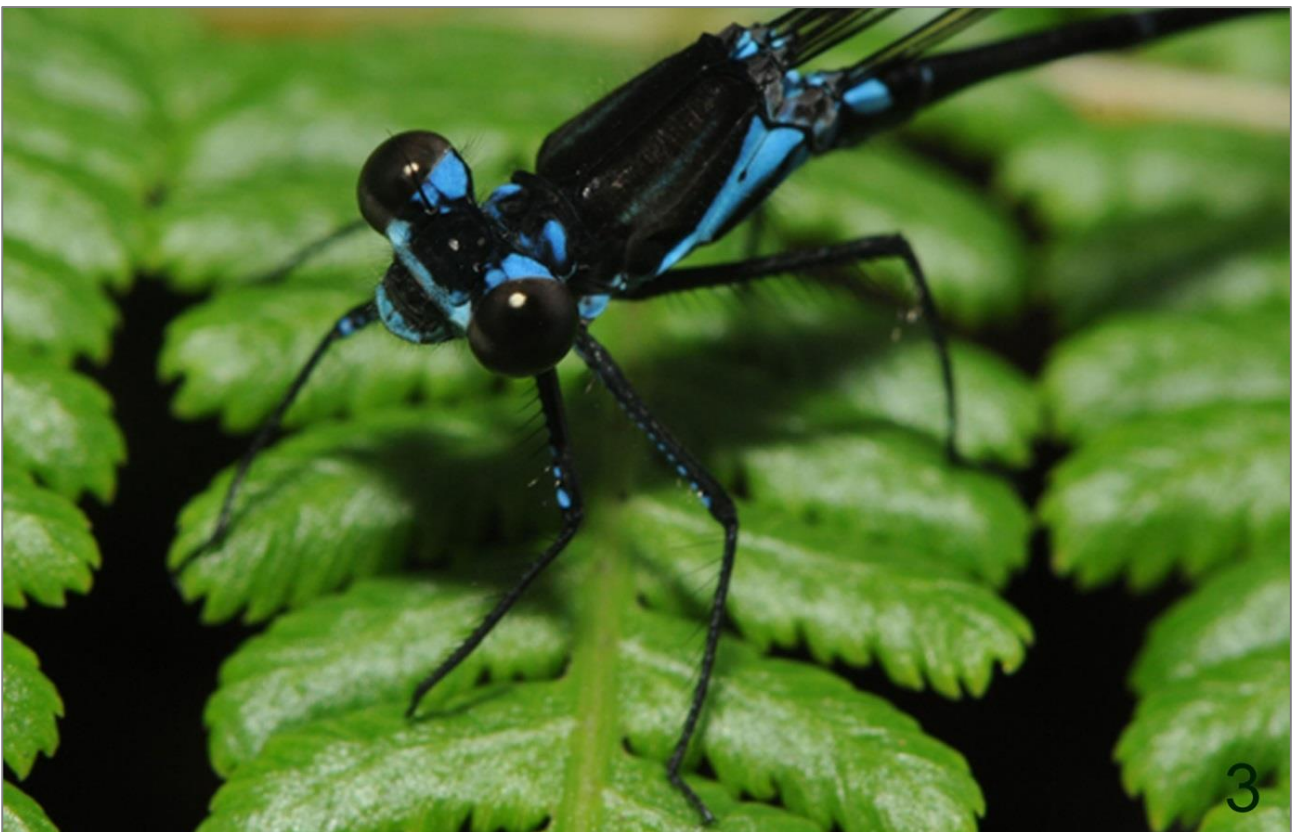
Figs 2, 3. Hylaeargia lisae sp. n. male in life: (2) mature; (3) subadult.