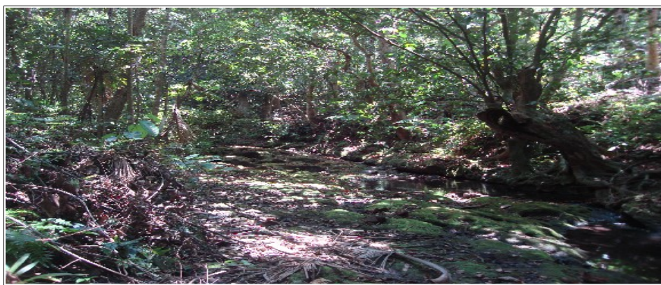
Figure 7: Forest stream in Itbayat Island

Calayan: The Odonata fauna of Calayan Island has a relatively high number of species dependent on running water in forest. Significant amount of forest cover is still present on the island of Calayan and local ordinance has been passed to protect this forest (Broad & Oliveros 2005). The ongoing habitat degradation by slash and burn farming however was evident during the trip. This practice is aggravated since the areas being burned are close to the water sources for easy access to water for irrigation. This practice not only opens up the forest cover but also destroys the habitat of adult Odonata which particular effect the Zygoptera.