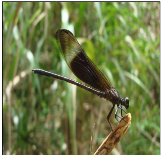
Figure 6: Euphaea refulgens

This was the most abundant damselfly in open creeks and rivers in the interior of Calayan Island. This island population has very reduced shadings on the wings and the metallic reflections are almost absent.