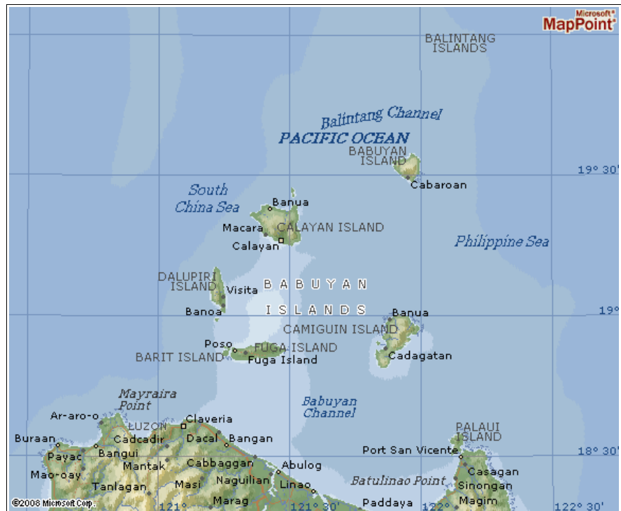
Figure 2: Babuyan Islands, The Philippines

The Babuyan group is situated between the Batanes group and the northern tip of Luzon Island. The 70 km wide Babuyan channel separates the group from mainland Luzon. Calayan (196 km 2 ), Camiguin Norte (166 km 2 ), Babuyan Claro (100 km 2 ), Fuga (70 km 2 ) and Dalupiri (50 km 2 ) are the major islands with human settlements. They are volcanic and oceanic in origin.