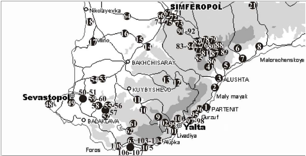
1a: Southern part of Crimean Peninsula with localities.

Data from 109 localities were available. These are given in Table 1 and are shown in Fig. 1 and more in detail in figures 1a-c.