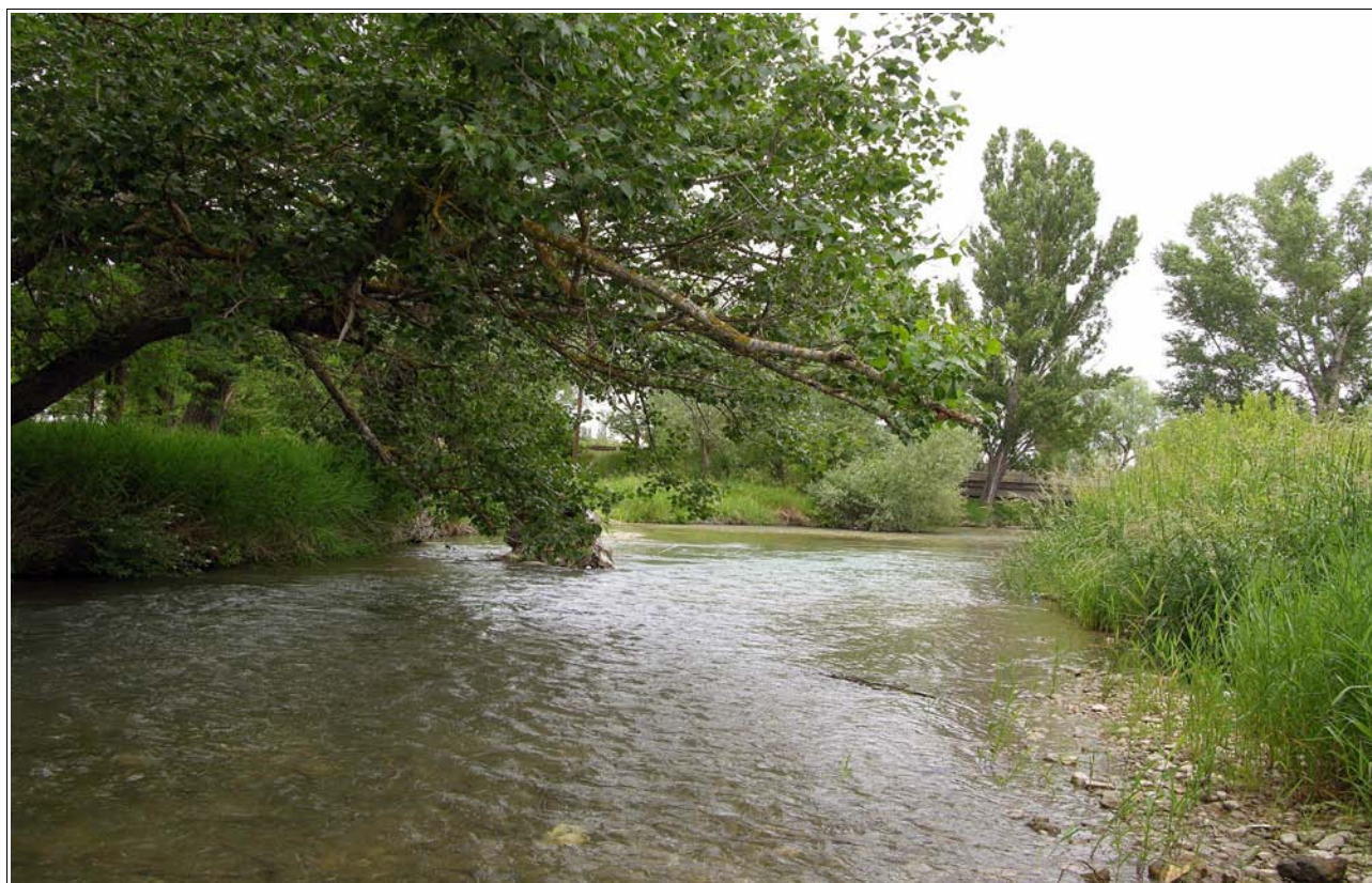
Fig. 3: River Biyuk Karasu near Bilogirs'k.

A second group of 14 species is found in the downstream parts of rivers and streams located mainly in submontane areas. The water flow is less rapid and submerged vegetation is well developed. The river bed consists of stone, clay and silt (e.g. river Biyuk Karasu near Bilogirs'k - fig. 3).