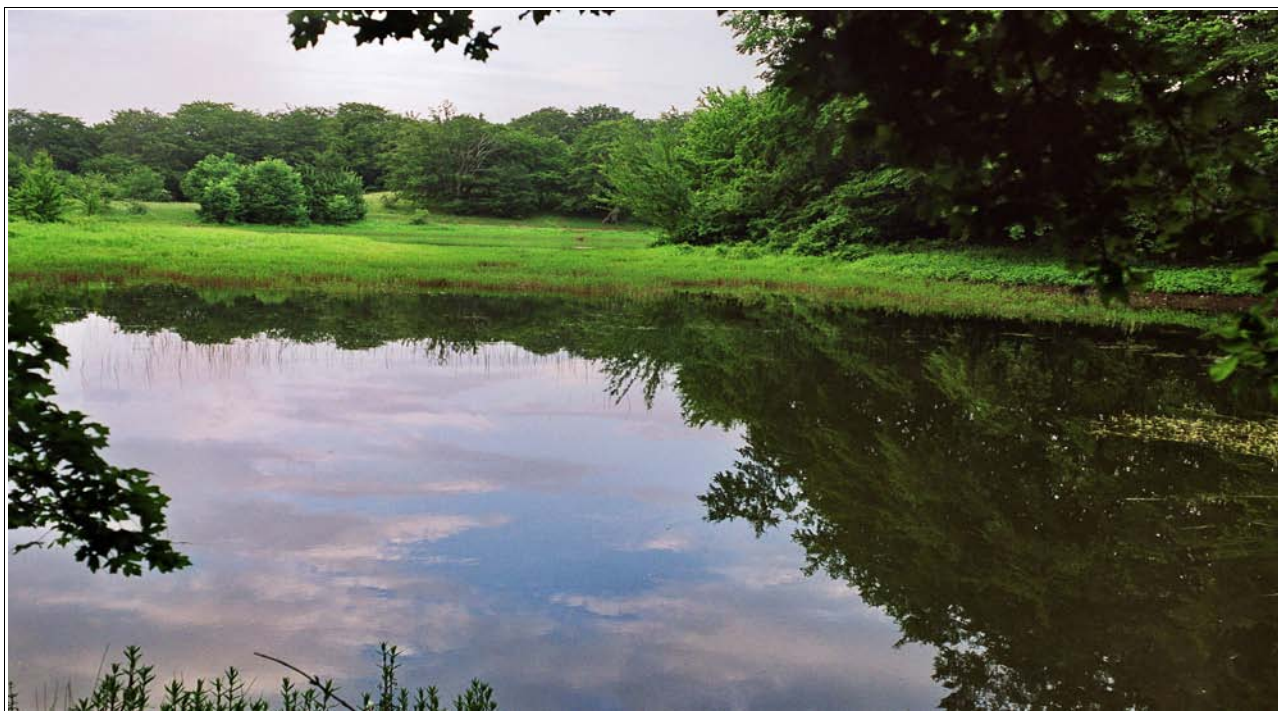
Fig. 7: Lake at the village Kutuzovka.

The fifth habitat group, the big reservoirs such as the Simferopol' reservoir (fig 8), is the best studied one. It is one of the largest reservoirs in Crimea, created on the river Salhir. In some part of the Simferopol' reservoir mass occurrences of cyanobacteria and algal blooms regularly happened during the last decade. In addition, the water level in these reservoirs changes by several meters two times per day. Such continuous changes of water level negatively impact several biota of the reservoir. At Crimean reservoirs 13 Odonata species were recorded.