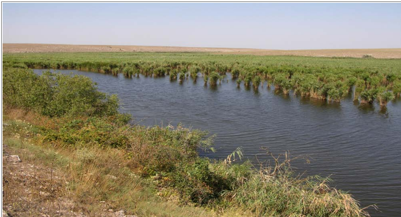
Fig. 9: Lake Donuzlav (freshwater part is main location of dragonflies breeding) Chornomorske district.

The last group comprises the lakes, ponds and small lentic waterbodies in the steppe zone of Crimea. One example is the lake Donuzlav (fig. 9) which is connected with Black sea and is brackish in its western part. The freshwater part fed by springs is separated from the brackish one by a dam. It is divided into several ponds used for cattle and sheep watering. Submerged and water macrophytes are well developed.