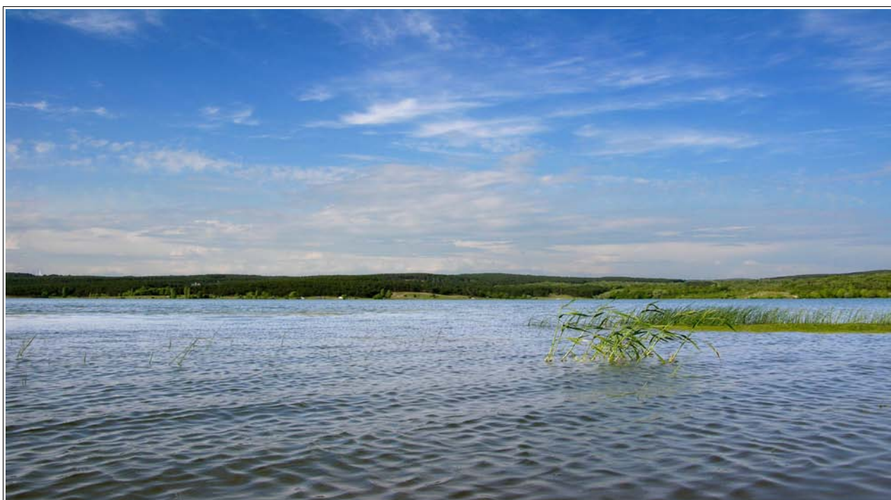
Fig. 8: Simferopol' reservoir.

The fifth habitat group, the big reservoirs such as the Simferopol' reservoir (fig 8), is the best studied one. It is one of the largest reservoirs in Crimea, created on the river Salhir. In some part of the Simferopol' reservoir mass occurrences of cyanobacteria and algal blooms regularly happened during the last decade. In addition, the water level in these reservoirs changes by several meters two times per day. Such continuous changes of water level negatively impact several biota of the reservoir. At Crimean reservoirs 13 Odonata species were recorded.