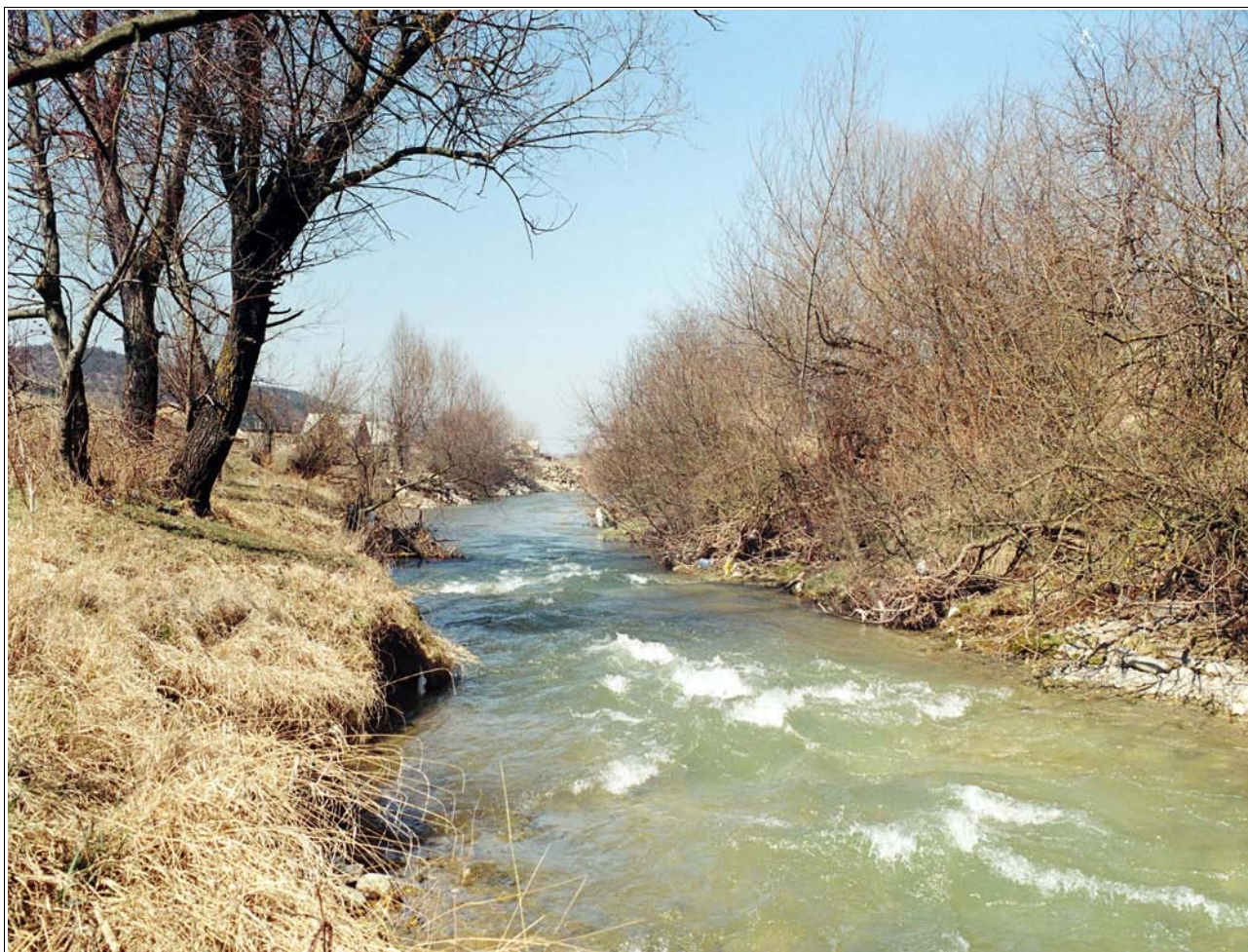
Fig. 2: River Salgir (Simferopol' district).