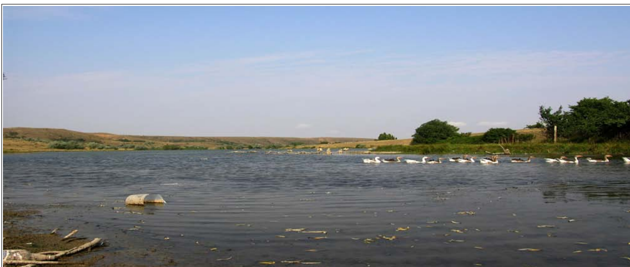
Fig. 10: Pond on the river Bulganak at env. of vill. Pozharske (Simpheropol' district).

An additional example is the pond in the surroundings of the village of Pozharske (fig. 10) created on the river Bulganak. This pond is used as a range for poultry as well as for fishing. Crayfish also occur here. In total 26 species were recorded in this landscape (tab. 2).