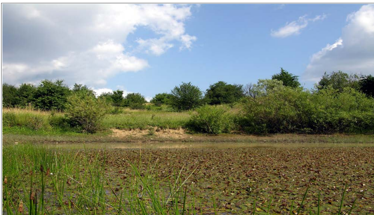
Fig. 5: Lake at the Dolgorukov yayla (Simperepol' district).

Another example is the river Al'ma (fig. 4) near the village Viline, which is under permanent anthropogenic impact. The river is regulated, silted, and the water level is low because it was dammed to use it as watering place for cattle. Plants as Phragmites communis , Potamogeton sp. are abundant, the ground is covered by filamentous algae.