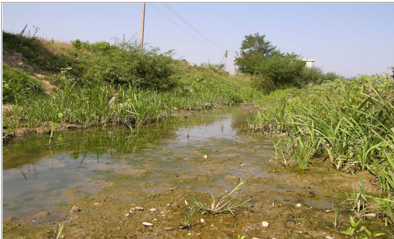
Fig. 4: River Al'ma at the village Viline (Bakhchysaray district).

Another example is the river Al'ma (fig. 4) near the village Viline, which is under permanent anthropogenic impact. The river is regulated, silted, and the water level is low because it was dammed to use it as watering place for cattle. Plants as Phragmites communis , Potamogeton sp. are abundant, the ground is covered by filamentous algae.