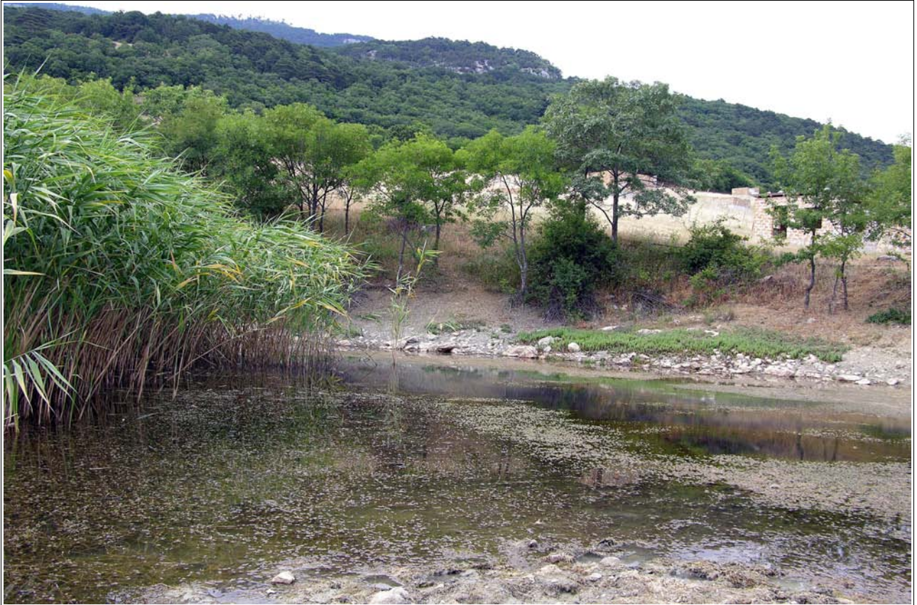
Fig. 6: Ponds at the north of Mys Mart'yan Reservation.

A third group occurs in the lakes in the yayla. Lakes on the Gurzuph and Dolgorukov yaylas belong to this group. The latter (fig. 5) were created for watering the cattle. They are small and have a silty floor and well developed macrophyte vegetation such as Sparganium erectum , Phragmites communis , Typha angustifolia L., Potamogeton sp. Only five species were recorded in this biotope type.