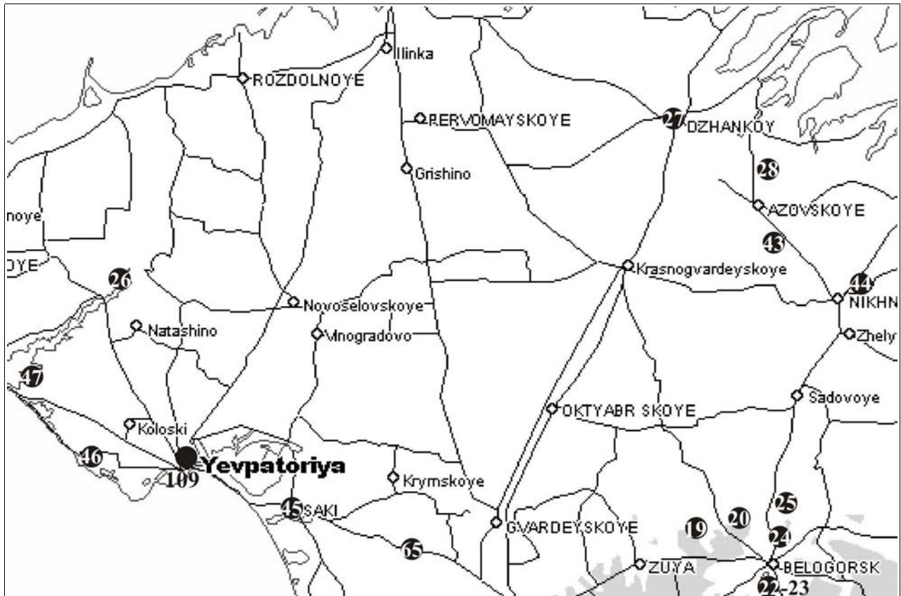
1c: North-western part of Crimean Peninsula with localities