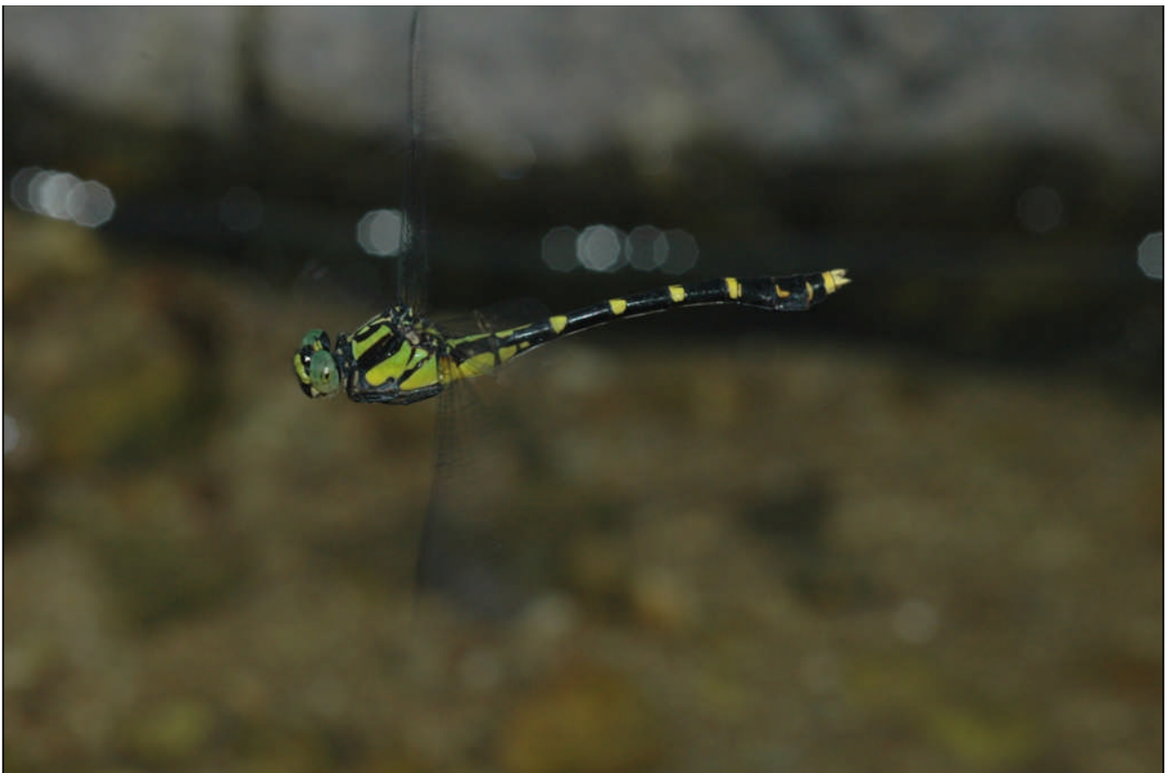
Figure 34. Nihonogomphus thomassoni female in oviposition flight at Luo Mi stream

I also saw a female Nihonogomphus thomassoni (Fig. 34) releasing eggs in flight over a shallow, open sandy section of the main stream, and an unidentified Macromia female, which somehow evaded capture (I was having a 'bad net day'), ovipositing over a shallow pool.