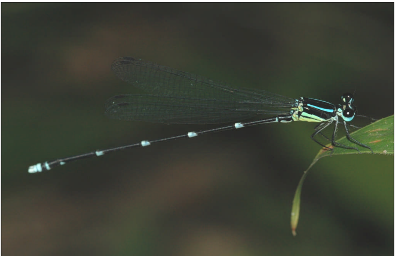
Figure 25. Indocnemis orang kempii at Xiaonanning – a new record for Hainan

Higher up, in better forest, Chlorogomphus usudai was encountered at another small stream. Two males were observed (and vouchered) making slow patrolling flights up and down the stream course, at a height of 0.5m to 1m above the stream. C. usudai seems to be much commoner than Chlorogomphus gracilis Wilson & Reels 2001, the only other member of the genus in Hainan (to which it is endemic), which was not encountered in any of the 2007-2008 field trips.