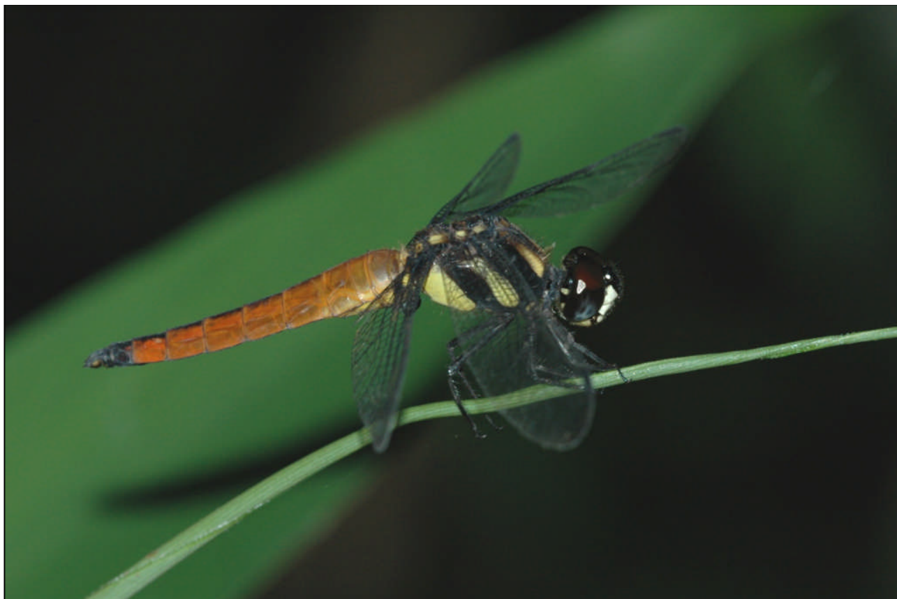
Figure 27. Lyriothemis tricolor male at tree-hole