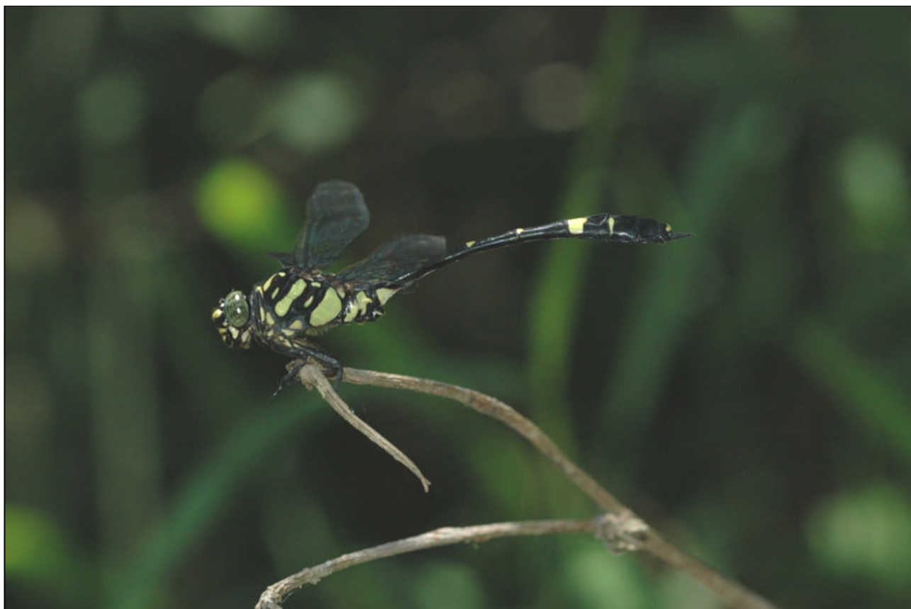
Figure 15. Gomphidia kruegeri on Nankai River

ovipositing at an isolated pool surrounded by grass / shrubs at the river margin. The endemic Drepanosticta elongata Wilson & Reels 2001 (Fig. 9) was also recorded.