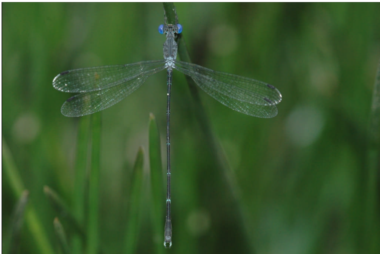
Figure 22. Lestes praemorsus at Yinggezhuai – a new record for Hainan