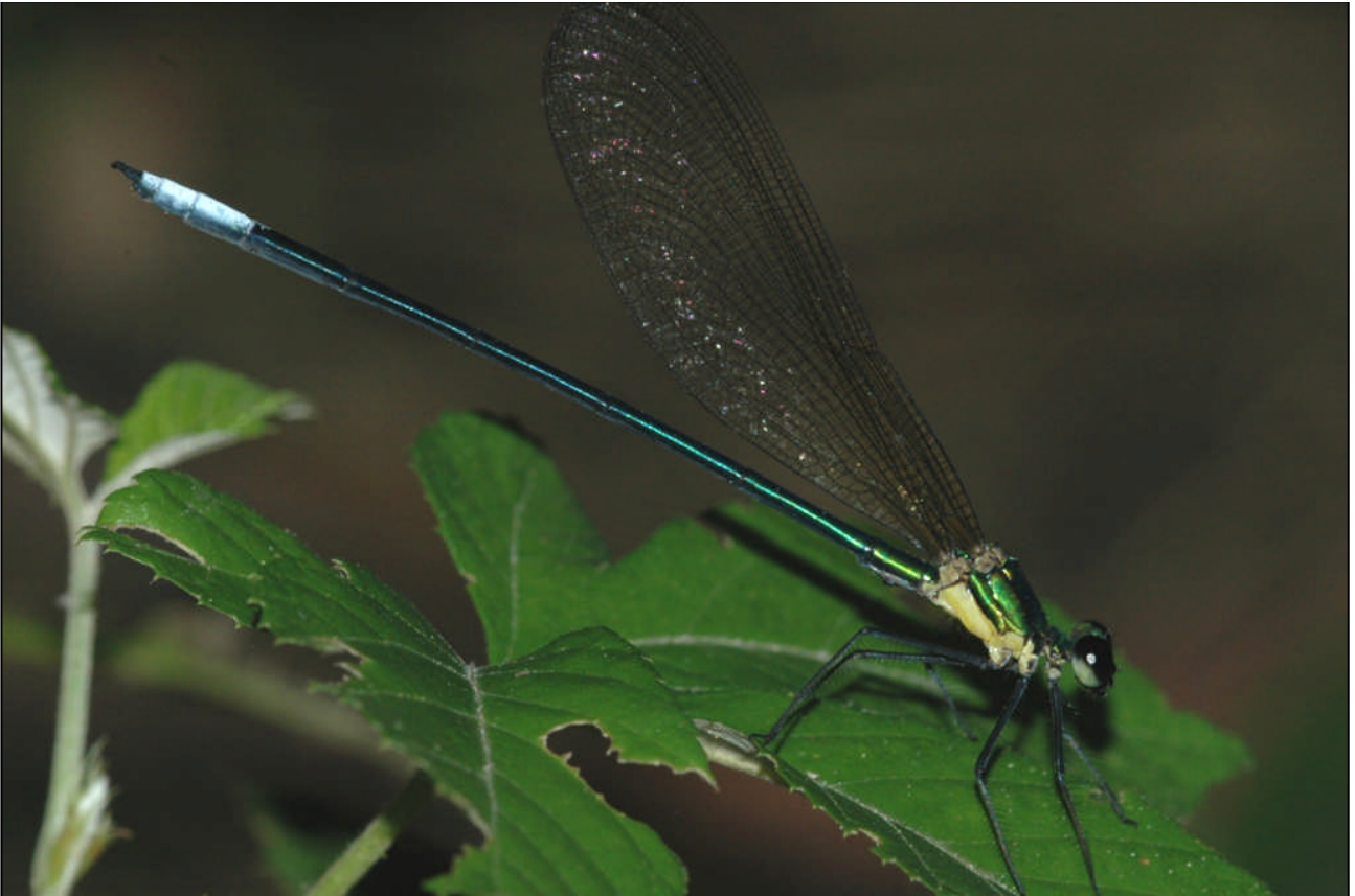
Figure 24. Vestalaria miao at Hui Shan

Further up, in forest, Drepanosticta elongata , D. zhoui and Agriomorpha fusca were all encountered, and, at a rocky forest stream, Aristocypha aino was present. This species was previously misidentified as the regionally widespread Rhinocypha (Aristocypha) fenestrella . It is in fact a new endemic species for Hainan.