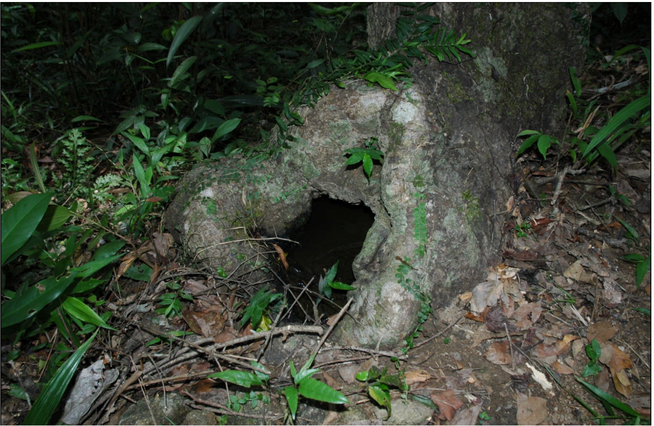
Figure 26. Water-filled tree-hole at which male Indocnemis orang kempfi and Lyriothemis tricolor were photographed and vouchered

Some way up from this stream, at about 350m, I came across a very large female platycnemidid which I vouchered and subsequently identified as Indocnemis orang kempfi Förster in Laidlaw 1907 (Fig. 25) – a new record for Hainan. The individual was several hundred metres from the nearest stream. This discovery was followed by me vouchering two males of the same species at 400m, again several hundred metres from the nearest stream, one of which was found perched above a water-filled tree-hole (Fig. 26), which begs the question as to whether this species is a tree-hole breeder. The tree-hole was being guarded by a male Lyriothemis tricolor Ris 1919 (Fig. 27). A female of this known tree-hole breeder was also photographed and vouchered in forest at 250m.