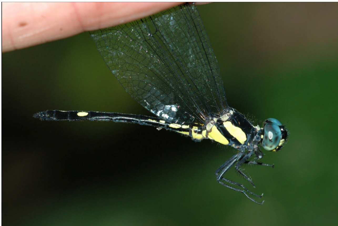
Figure 29. Hylaeothemis clementia at Wuzhishan – a new record for Hainan, first collected in 2005

At the end of the day I counted my leech bites and discovered I had 18, which is a personal record for me. They are the bane of fieldwork in forested uplands of Hainan.