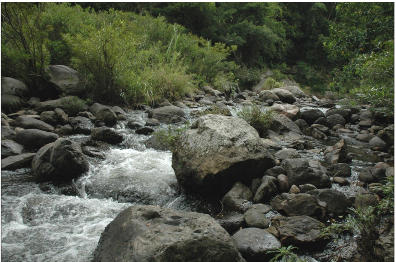
Figure 21. Nanyi River, Yinggeling

We drove up an extremely narrow dirt track at Qingjie, in Yinggeling, to an altitude of several hundred metres, before taking to a forest trail which led into primary forest. We got to an altitude of 1,000m.