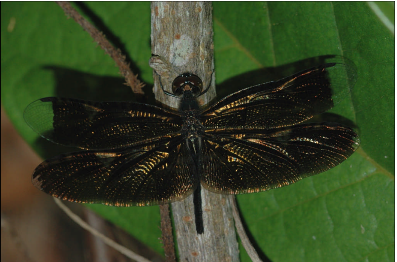
Figure 19. Rhythemis obsolescens at Ganzaling – a new record for Hainan