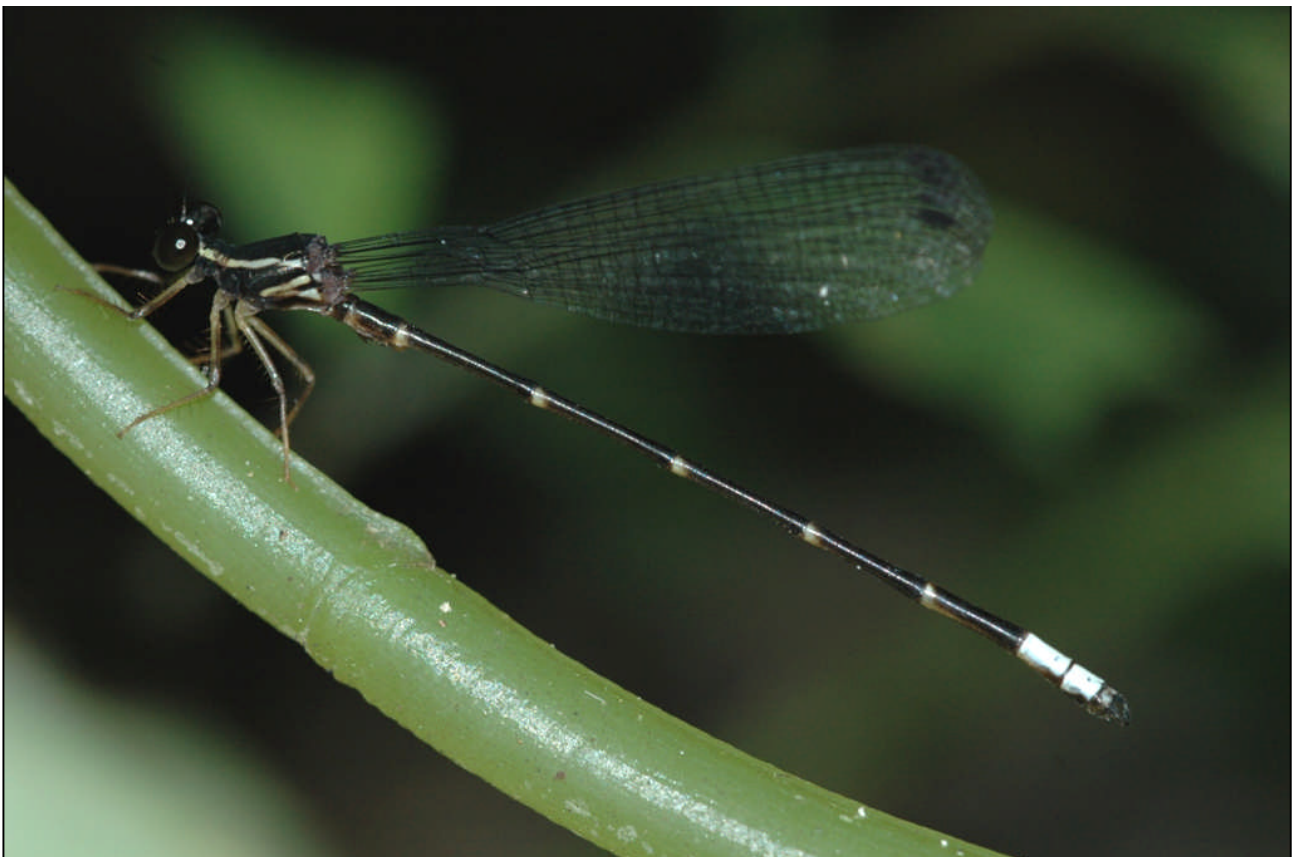
Figure 10. The endemic Burmargiolestes xinglongensis – described by Wilson & Reels in 2001