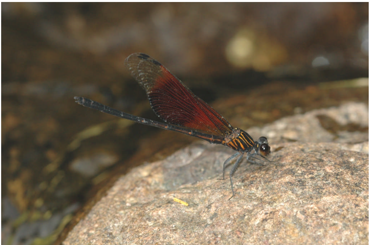
Figure 6. The endemic Euphaea ornata – described from Hainan by H. Champion in 1924