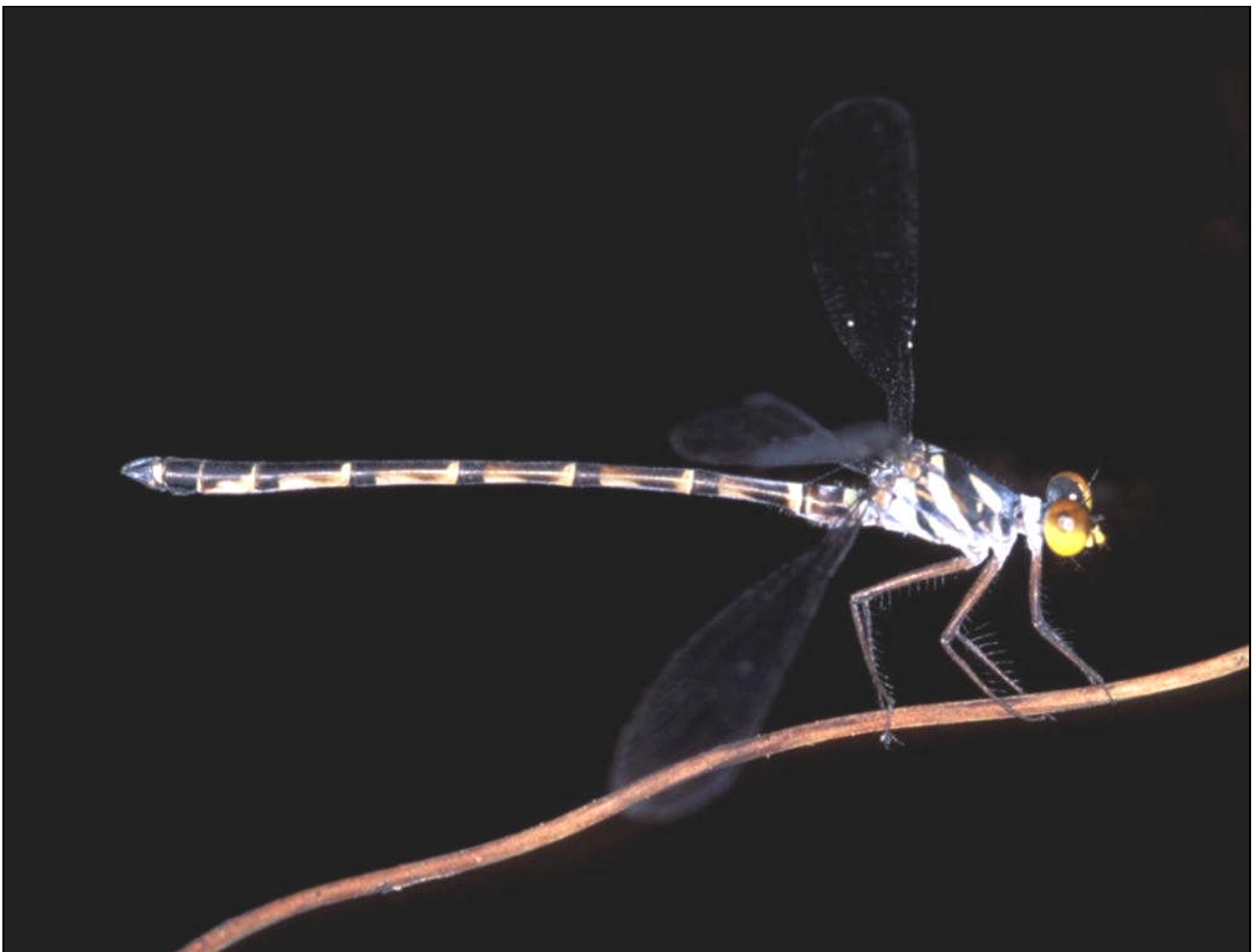
Figure 12. Podolestes pandanus – the northernmost Podolestes in the world

Podolestes pandanus (Fig. 12) and, to a lesser extent, Rhinagrion hainanense (Megapodagrionidae) are of particular interest because they are the only representatives of the genera Podolestes and Rhinagrion in China. Indeed, all other Podolestes species, and most species of Rhinagrion , are found much further south, in Sundaland (western Indonesia, Malaysia and southern Thailand), while the latter also has a single representative in the Philippines and two in Indochina.