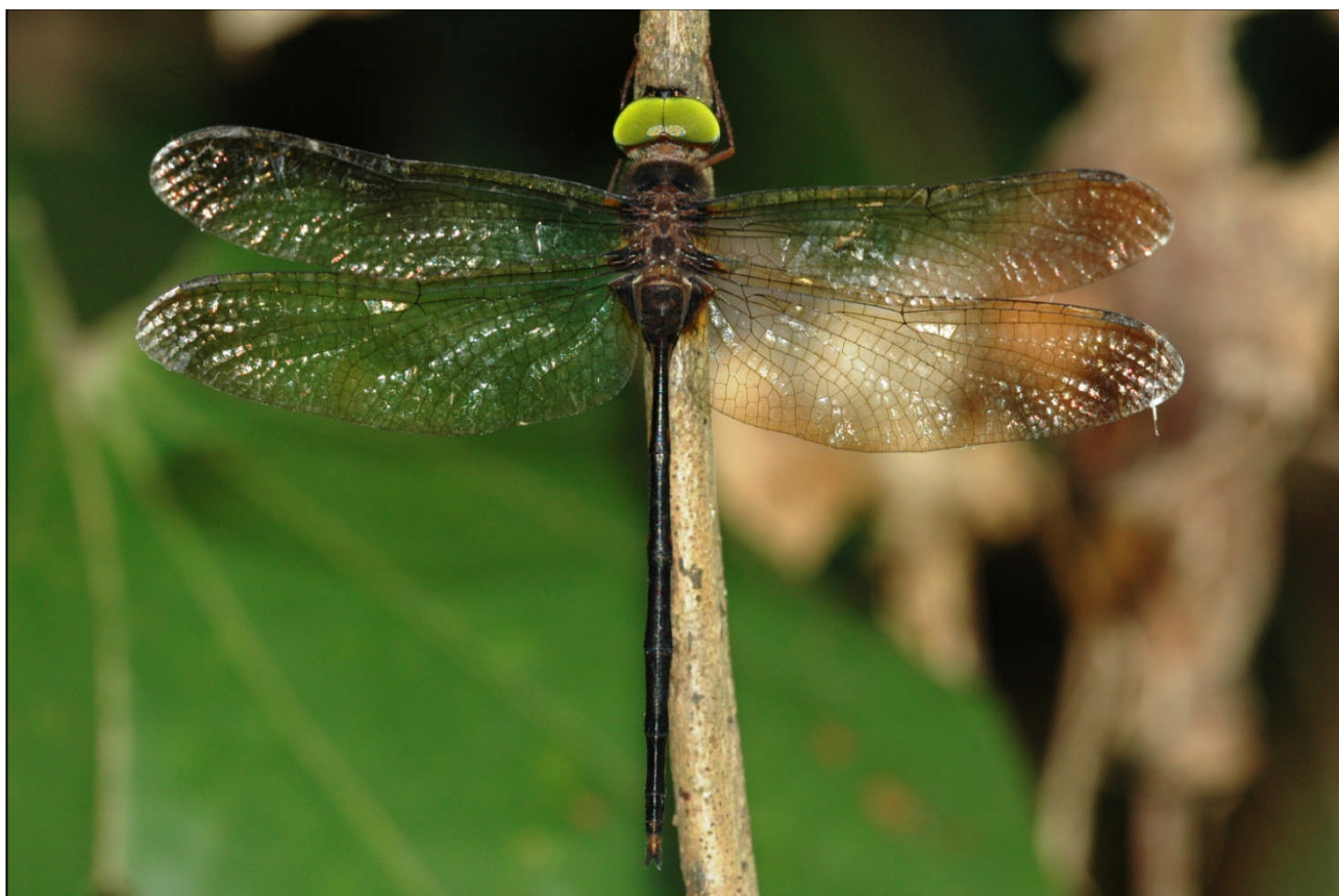
Figure 37. Zygomma petiolatum at Tongtielin – a new record for Hainan

To add to my frustration, I saw and photographed a male Gynacantha , but failed to voucher it as it flew deep into a woodland patch. I did, however, photograph and collect a male Zygomma petiolatum Rambur 1842 (Fig. 37) roosting in another small woodland patch. This represented the first record of this species for Hainan.