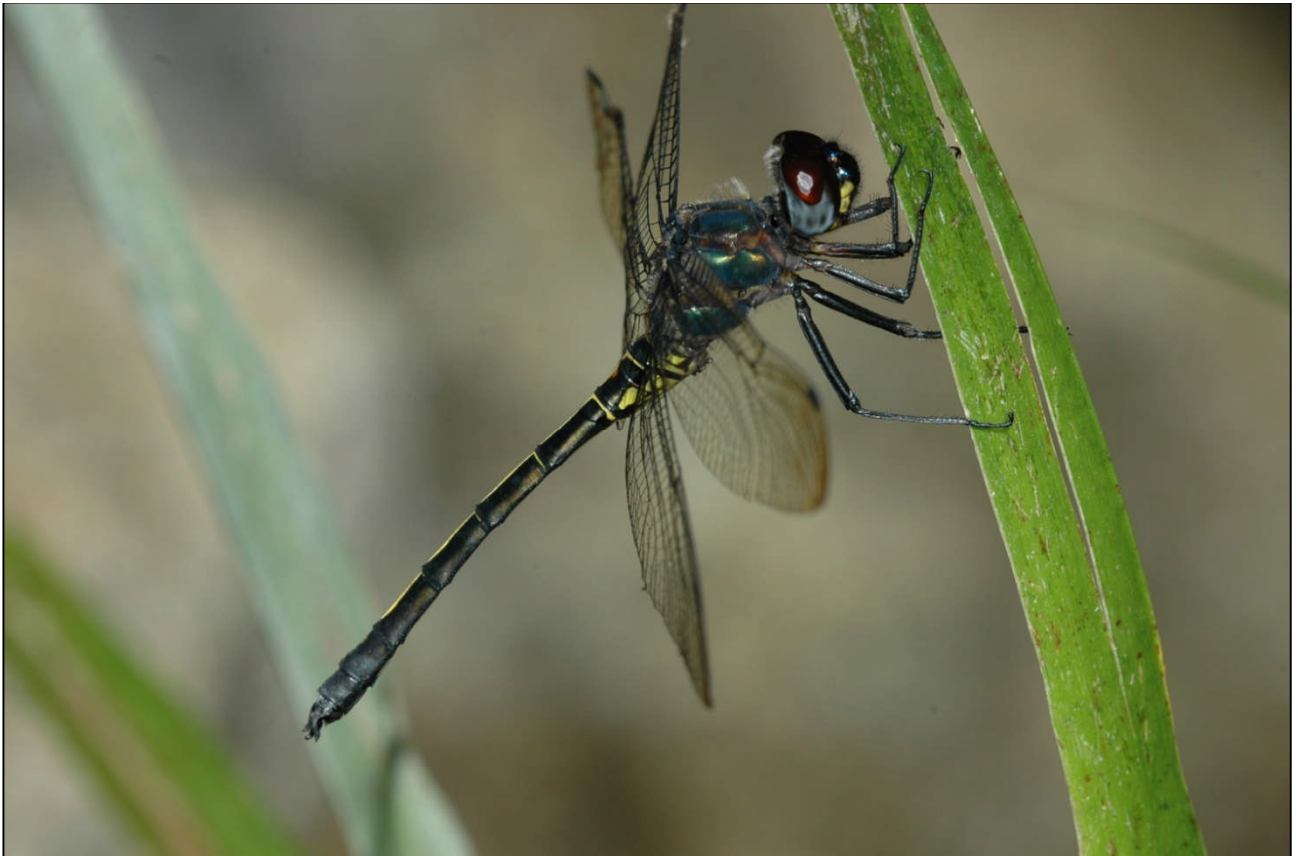
Figure 5. Zygonyx iris insignis – originally described from Hainan by W.F. Kirby in 1900