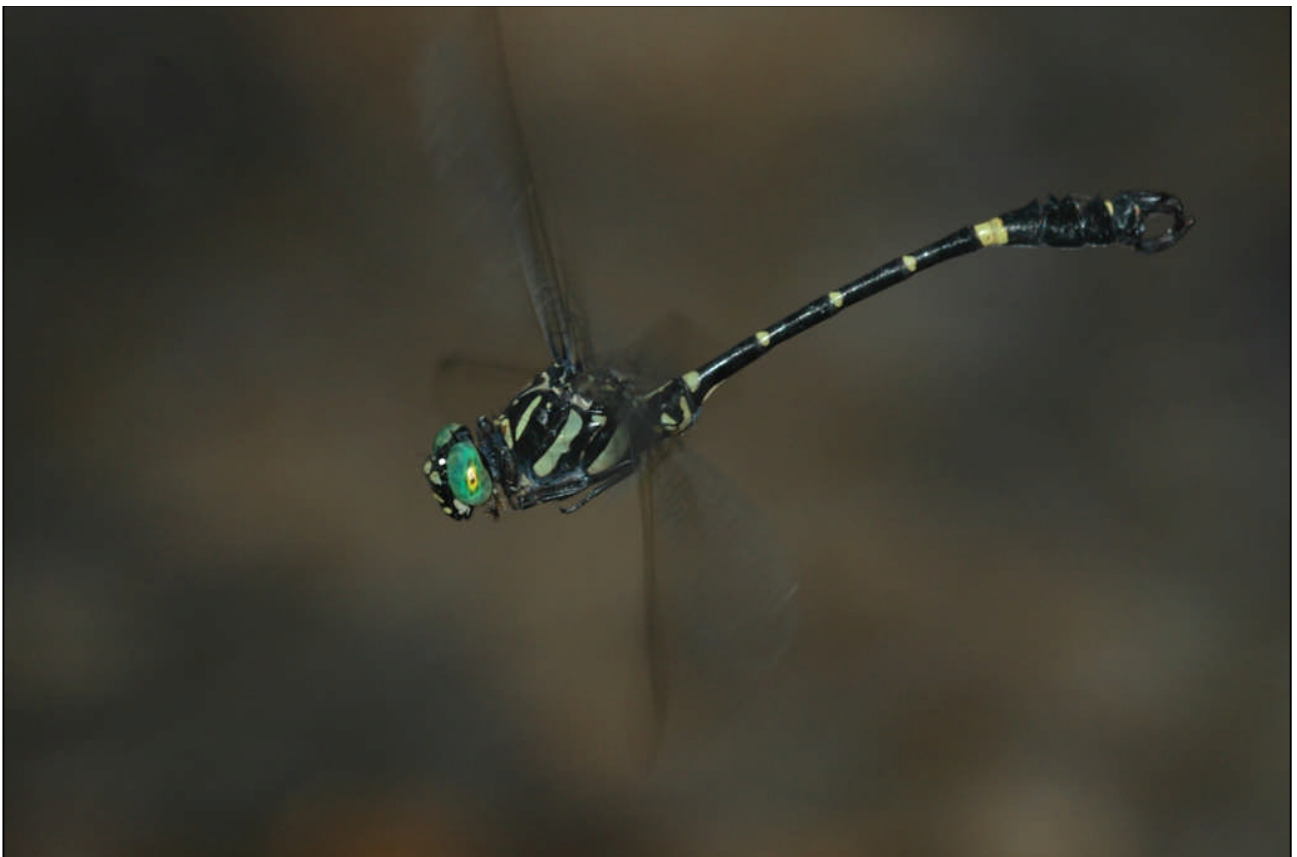
Figure 35. Lamelligomphus camelus male, patrolling sandy-bottomed stream at Wuzhi-shan

By 1000h, I was enjoying the sight of several males of Lamelligomphus camelus (Martin 1904) (Fig. 35) actively patrolling short stretches along the open aspect sandy-bottomed stretch of the stream (about 1 – 2m wide). A single female was observed forming a tandem with one of the males and flying off.