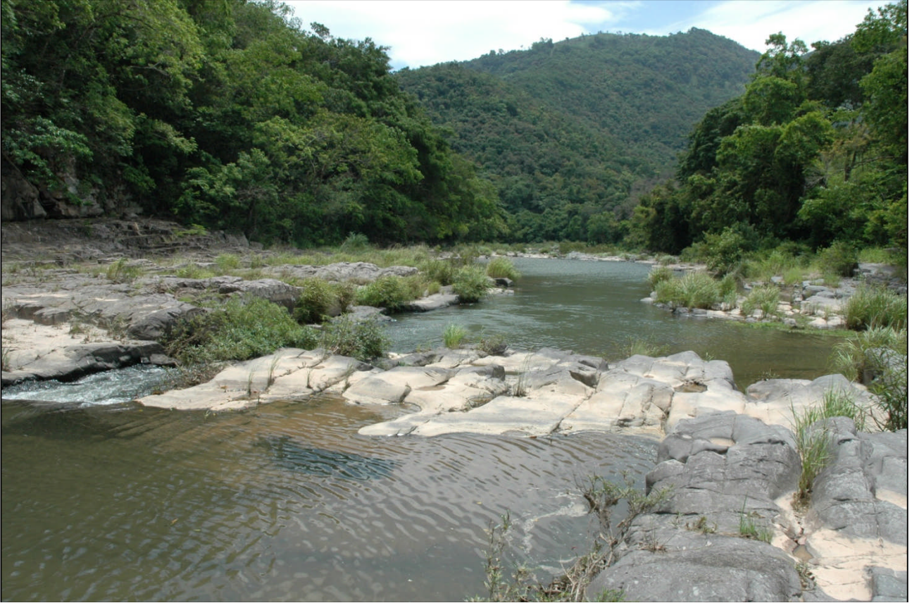
Figure 14. Nankai River, Yinggeling, 400m

Four gomphids were present on the river: Burmagomphus vermicularis (Martin 1904), Paragomphus pardalinus Needham 1942, Nihonogomphus thomassoni (Kirby 1900) and Gomphidia kruegeri Martin 1904 (Fig. 15). G. kruegeri – a very large lindeniiine – was abundant, with numerous males holding territories along the river, spaced at 10-20m intervals.