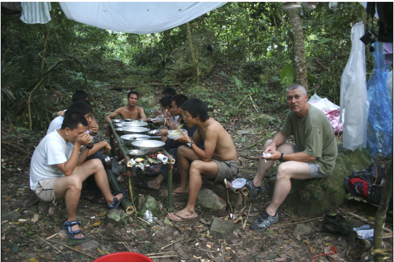
Figure 17. Camp site at Namkang River, 550m.