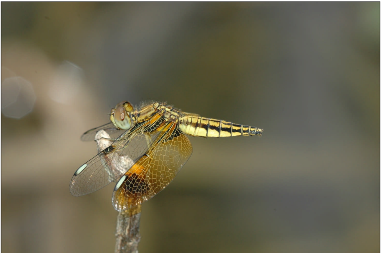
Figure 36. Palpopleura sexmaculata female at Shi Dai

The very attractive small libellulid Palpopleura sexmaculata (Fabricius 1787) (Fig. 36) was plentiful in an area of small flooded marshy fields. In the late afternoon we drove on to the city of Wanning in southeast Hainan.