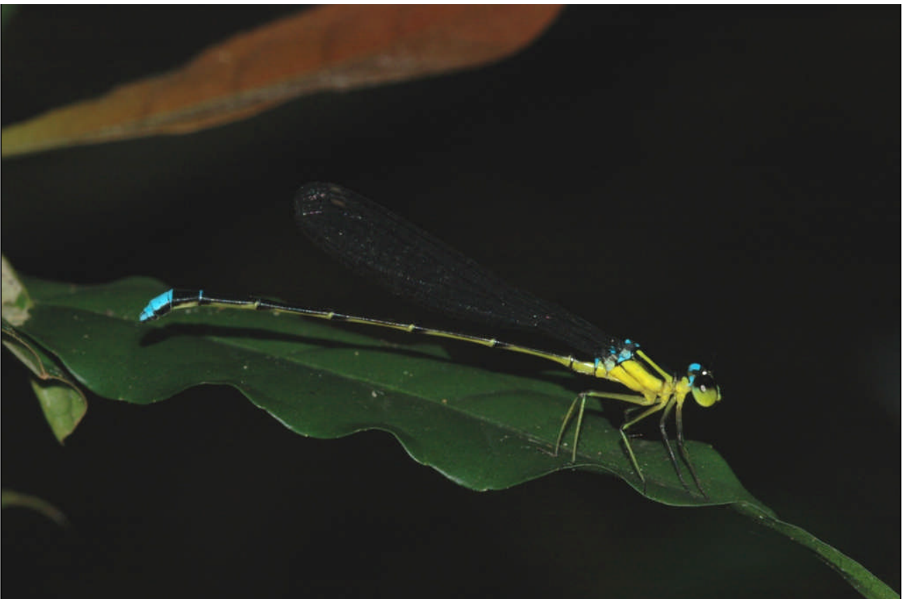
Figure 31. Sinosticta sylvatica at Wuzhishan