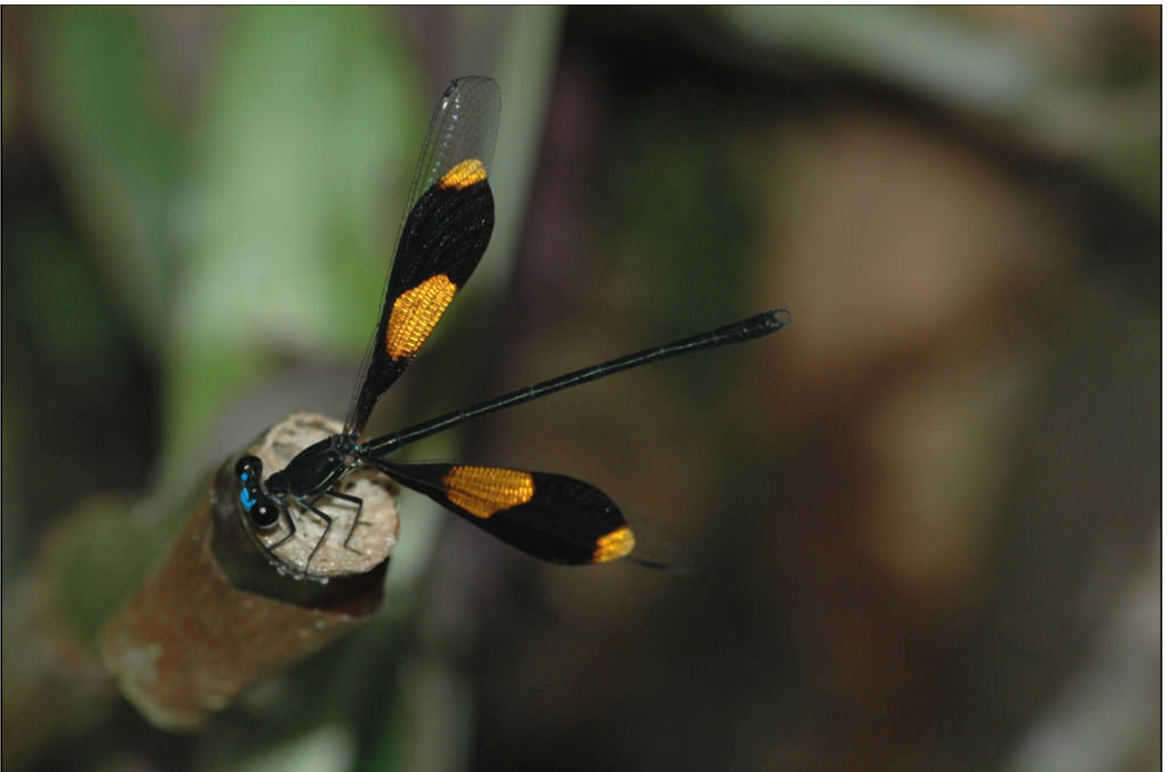
Figure 4. The endemic Pseudolestes mirabilis – described by W. F. Kirby in 1900