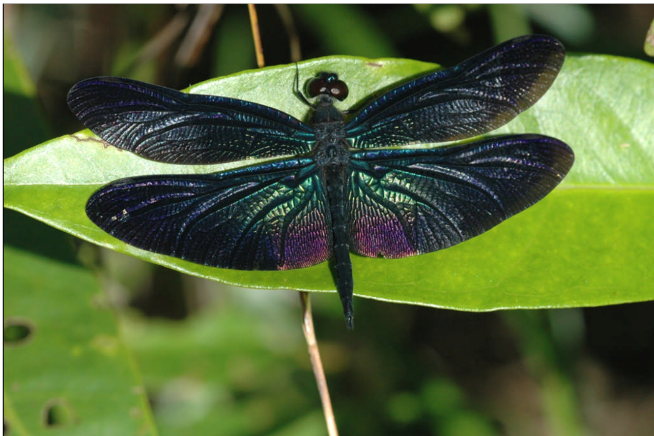
Figure 20. Rhyothemis plutonia at Ganzaling – a new record for Hainan

Another richly rewarding site was a large (1ha) pond, with weedy margins and swampy backwaters. The weedy margins supported good numbers of the minute libellulid Nannophyopsis clara (Needham 1930), while Paracercion calamorum (Fraser, 1919) was present in the swampy backwaters. The open water was populated by typical pond species such as Ictinogomphus pertinax (Hagen 1854), Sinictinogomphus clavatus (Fabricius 1775), Epophthalmia elegans (Brauer 1865), Hydrobasileus croceus (Brauer 1867) and Urothemis signata (Rambur 1842).