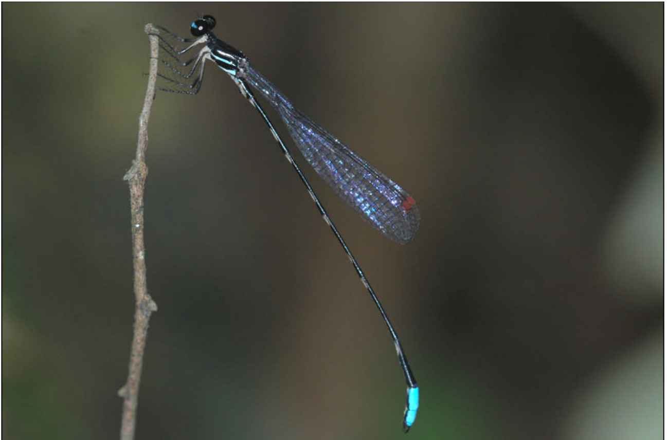
Figure 16. The endemic Drepanosticta zhoui at Yinggeling