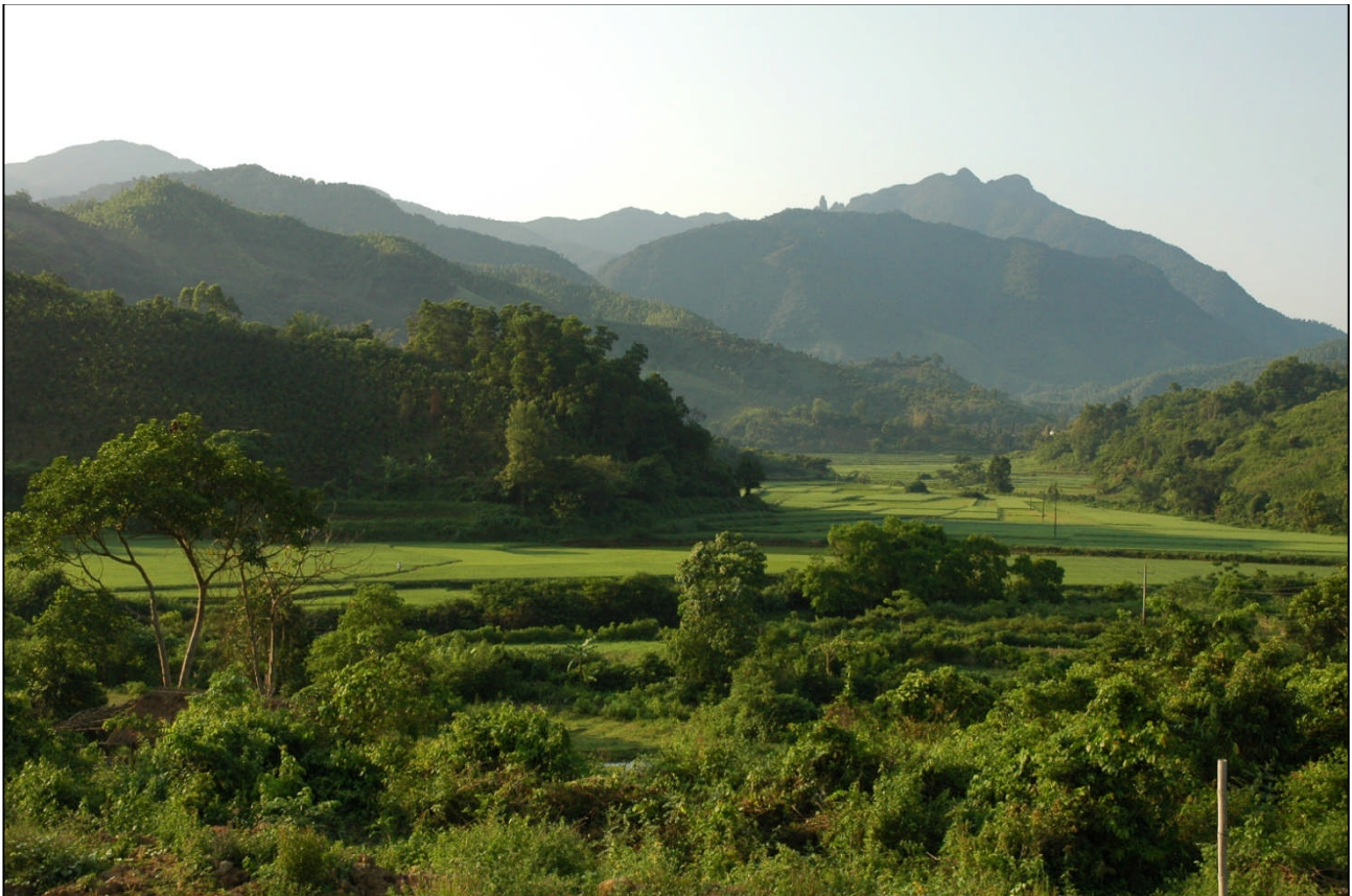
Figure 2. Wuzhishan, the highest peak in Hainan. Primary forest clads the upper slopes of the mountain. Secondary forest and various crops occupy the lower slopes. Rice paddies fill the valley bottoms

The upland areas of the interior are often well-forested, and extensive patches of primary rainforest still exist at Yinggeling, Bawangling, Wuzhishan, Jianfengling and various other upland protected areas. Elsewhere in the uplands there is secondary forest and cultivation of various crops on the hill sides, with rice grown intensively in the mountain valleys. Rice and vegetables are grown extensively in the northeast lowlands and also in the western coastal areas, while rubber is also grown in lower-lying areas across the island. Other major crops include coconuts, coffee, cocoa, pepper, mangoes and cashews. Mangroves and other estuarine habitats occur intermittently around the coast of the island, and there are extensive low-lying wetlands in the northeast. The rate of urbanisation of lowland areas has increased dramatically in the last decade. However, Hainan is not heavily industrialised and has a relatively small human population of just over eight million.