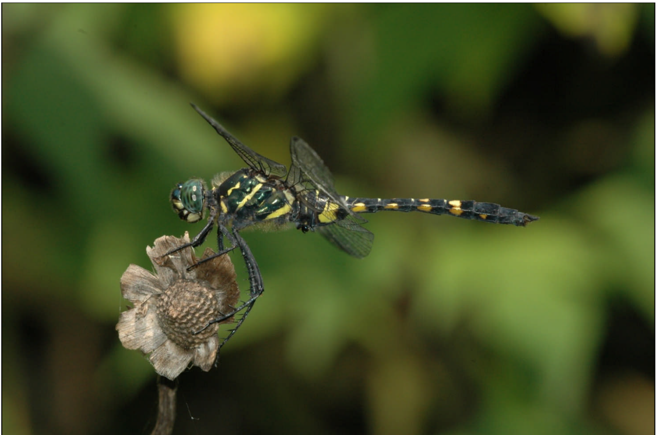
Figure 33. Onychothemis testaceum at Shui Man River, Wuzhishan

We drove to the Shui Man River, a broad, open aspect stream at about 400m, with a gentle gradient, boulders, large cobbles and sand, surrounded by agricultural land and shrubby vegetation, grading into forest at higher elevations. A number of widespread zygopteran were present, including two species of Pseudagrion ( P. pruinosum Schmidt 1934 and P. rubriceps Selys 1876), two of Copera ( C. ciliata and C. marginipes ) and two of Prodasineura ( P. autumnalis (Fraser 1922) and P. croconota (Ris, 1916)). The calopterygids Neurobasis chinensis and Matrona basilaris were also present in good numbers. Higher up in the forest, a single Sinosticta sylvatica (Fig. 31) was observed.