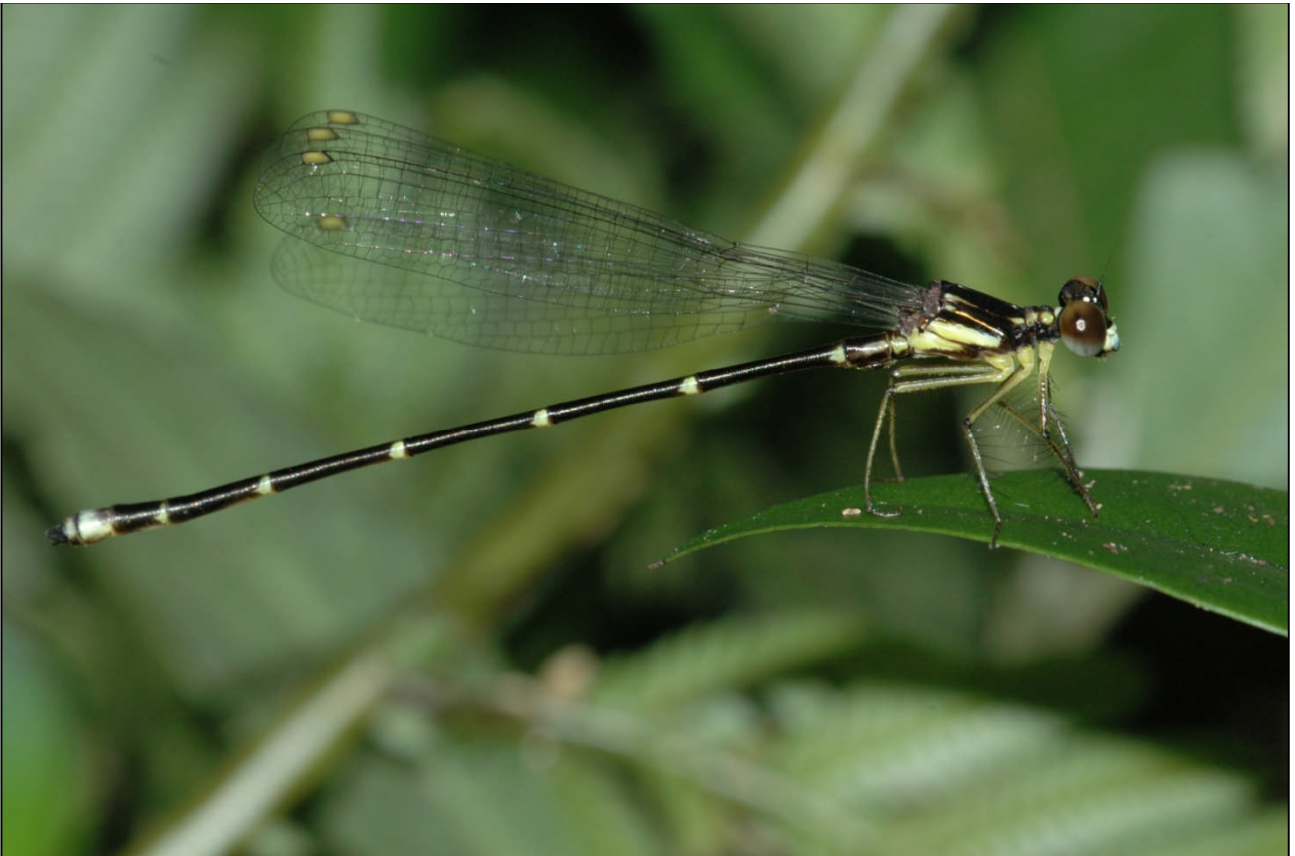
Figure 30. Sinosticta hainanense at Wuzhishan