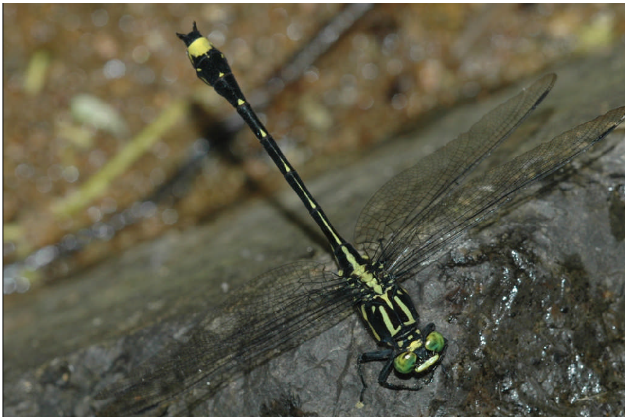
Figure 8. Asiagomphus hainanensis – described from Hainan by Chao Hsiu-fu in 1953

Nychogomphus flavicaudus and Leptogomphus celebratus . Liu Zu-yao added yet another Paragomphus species, the endemic Paragomphus wuzhishanensis , in 1988.