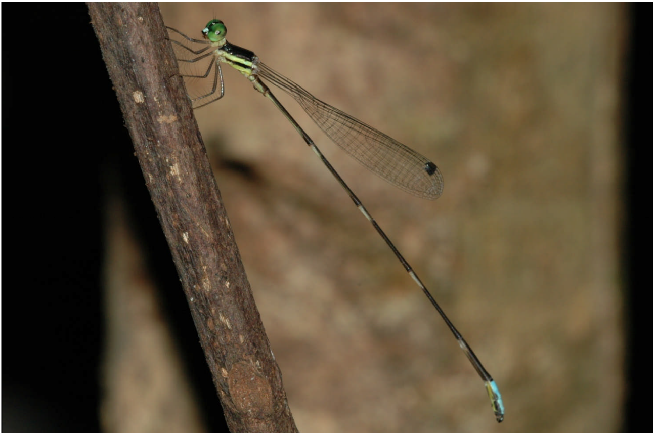
Figure 9. The endemic Drepanosticta elongata – described by Wilson & Reels in 2001