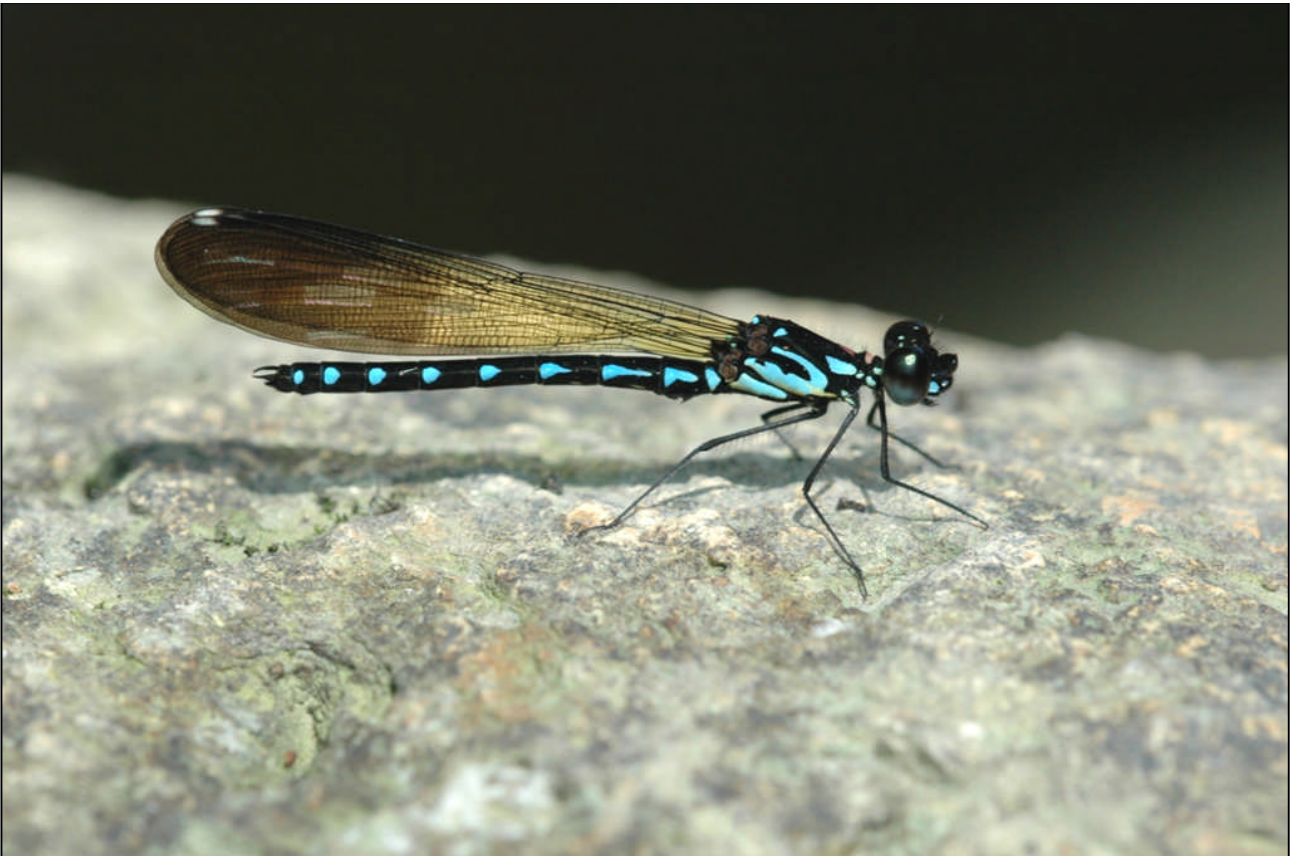
Figure 3. Heliocypha perforata – the first odonate recorded from Hainan, described by Baron de Selys Longchamps in 1873