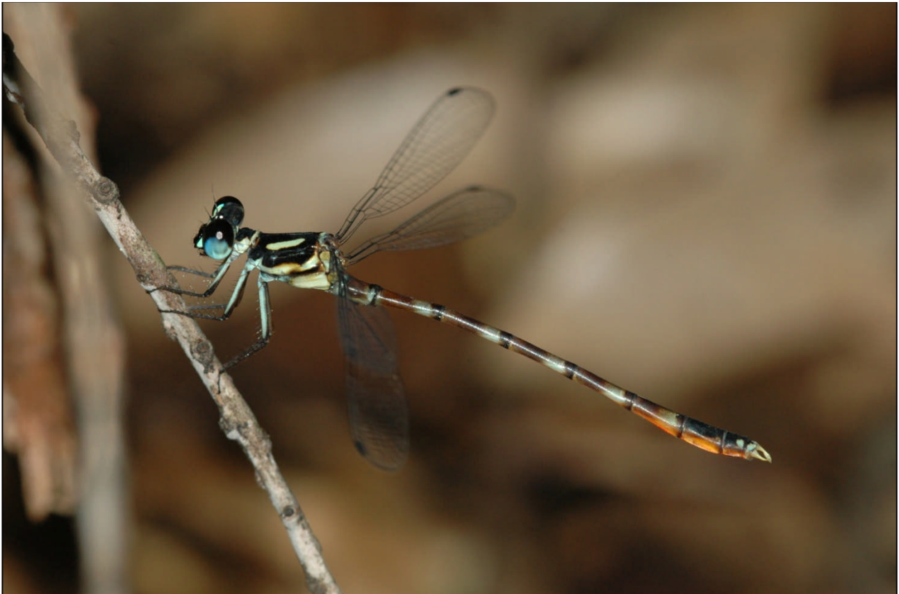
Figure 23. Rhinagrion hainanense at Fan Jia, near the type locality of Lumuwan

I was very thrilled to find a male and a female Rhinagrion hainanense (Fig. 23) at a shady, sandy-bottomed, slow-flowing forest stream, which had very dense marginal vegetation. The only previous Hainan record of this species (a single male) was made at Lumuwan, in 1999 (Wilson & Reels, 2001). It was previously considered endemic to Hainan, but is now known to be the same species as R. yokoi Sasamoto 2003 (a junior synonym of R. hainanense ), known from Vietnam and Laos (Vincent Kalkman, pers. comm.). I spent a fruitless hour attempting to voucher the male and female, but they stubbornly remained about 0.5m within the thick riparian vegetation, where it was impossible to swing a net, and evaded all attempts at capture by hand. I was, however, able to use a 200mm macro lens to obtain photographs of both sexes. Eventually I was called away from the site because the team needed to leave for Wanning.