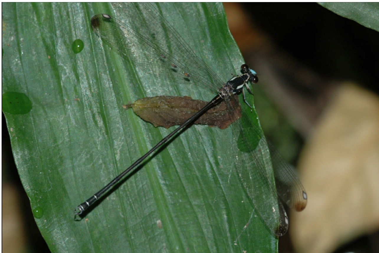
Figure 32. Rhipidolestes cyanoflavus at Wuzhishan

After arriving back at the ranger station in the afternoon, we found our support vehicle had returned to evacuate us back to the town of Wuzhishan, due to an approaching typhoon. We spent the following day holed up in the town as the typhoon blew through.