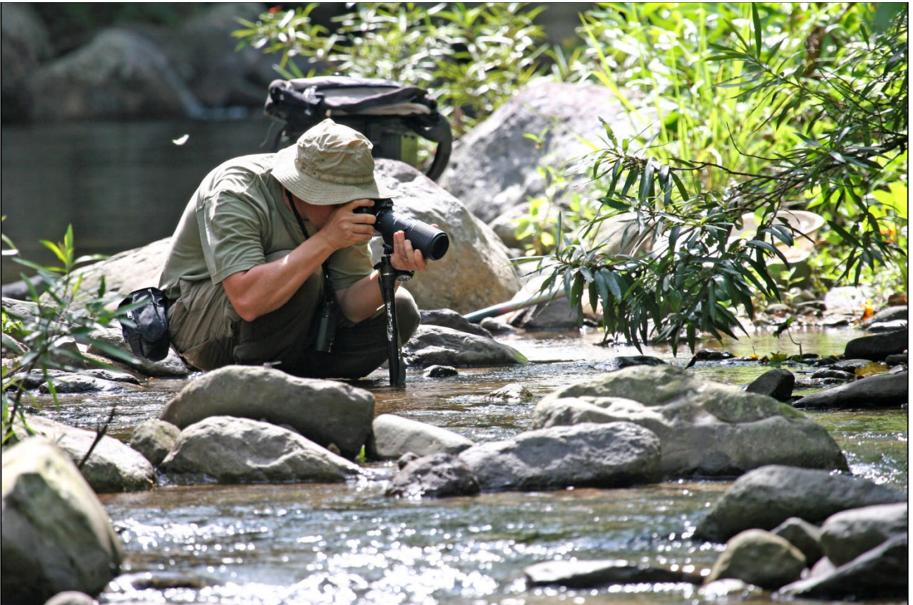
Figure 18. 'Capturing' an odonate (probably Heliocypha perforata ) on Namkang River.