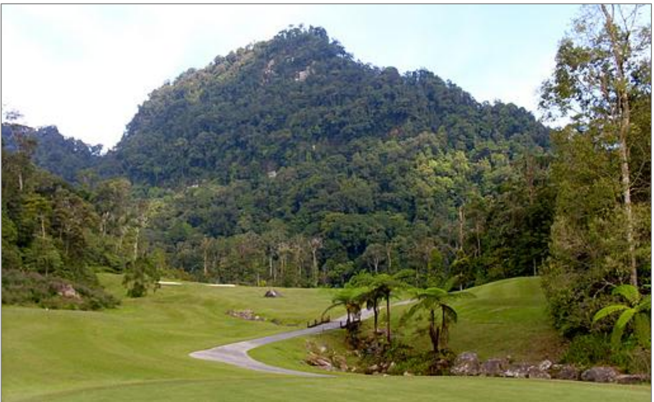
Fig. 2: Golf course with view to Mt Penrissen ( http://lh6.ggpht.com/-PHc7cvQwas4/TpZTRCarOqI/AAAAAAAAAP0s/olbAFvmu0sc/penrissen%2525202.JPG ).