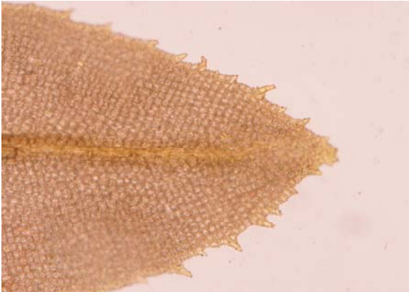
Fig. 5: Leaf apex of L. styriacum , Switzerland, Guttannen. There is no hyaline terminal cell as in L. flexifolium and the leaf shape is intermediate between L. flexifolium and styriacum .