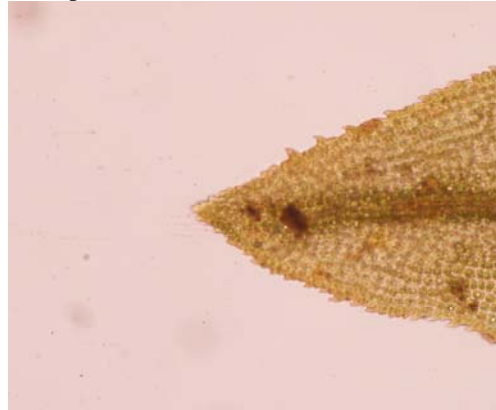
Fig. 6. Leaf apex of L. styriacum , Austria, Messelinkogel. There is no indication of a hyaline terminal cell.