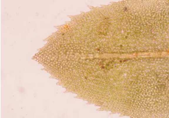
Fig. 3: Leaf apex of fig. 1.