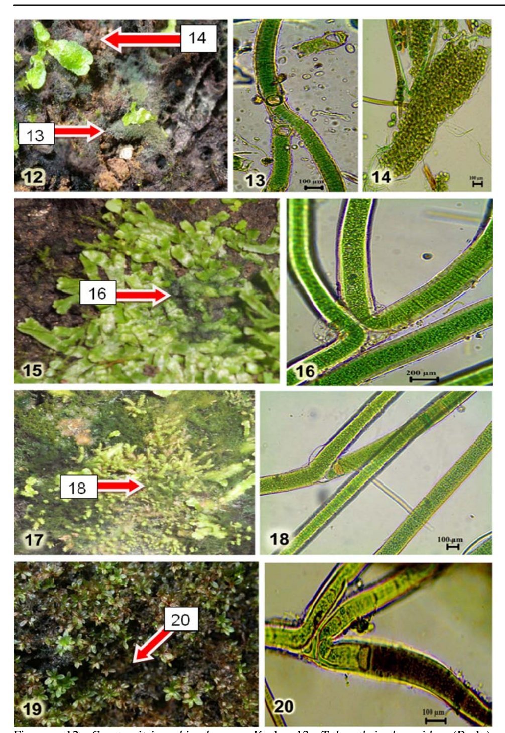
Figures: 12. Cryptomitrium himalayense Kash., 13. Tolypothrix byssoidea (Berk.) Kirchner, 14. Nostoc punctiforme (Kuetz.) Hariot, 15. Plagiochasma appendiculatum Lehm. et Lindenb., 16. Scytonema coactile Montagne ex Born. et Flah, 17. Philonotis thwaitesii Mitt. 18. Tolypothrix robusta Gardner, 19. Funaria hygrometrica Hedw., 20. Scytonema burmanicum Skuja.