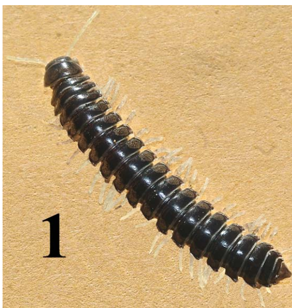
Figure 1. Dorsal view of Placer Co. male of X. brachymacris .

Color (of Placer Co. population) (Fig. 1). Collum, metaterga, and paranota subuniformly glossy grayish-black with lightly speckled ovoid areas adjacent to paranotal bases, pigmentation extending onto caudolateral paranotal extensions and medial surfaces of peritremata; lateral margins of peritremata and caudal edges of metaterga light gray; epiproct speckled dark gray. Epicranium speckled dark gray, continuing through interantennal region and entire lengths of frons and genae; antennae somewhat translucent light gray, sterna and legs translucent whitish.