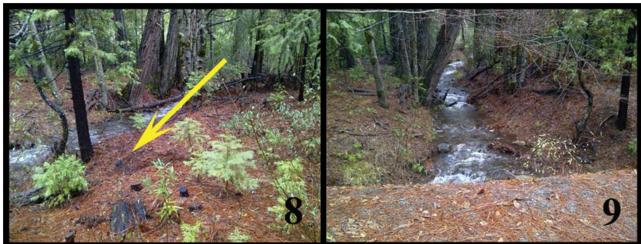
Figures 8–9. Broad environmental views of the riparian, mixed alder/conifer habitat at the Placer Co. X. brachymacris locality. 8) Side view showing sample area (arrow) on level ground above slope to Pagge Creek. 9) View looking up Pagge Creek with collecting area at right edge of photo.

CALIFORNIA: El Dorado Co. , 20.8 km (13 mi) E Georgetown, Blodgett Forest, M, 6 May 1972, J. B. Heppner (FSCA); and Snowline Camp, along U.S. Hwy. 50 just W Pollock Pines, M, 21 June 1948, J. W. MacSwain (CAS). Placer Co. , 20 km (12.5 mi) NE Foresthill, Sugar Pine OHV area, Tahoe National Forest (39° 7' 4.06" N, 120° 45' 30.30" W), 1,186 m (3,890 ft.), 7M, 21 February 2014, D. J. Ross (NCSM), and M, 4 F, 1 March 2014, D. J. Ross (NCSM).