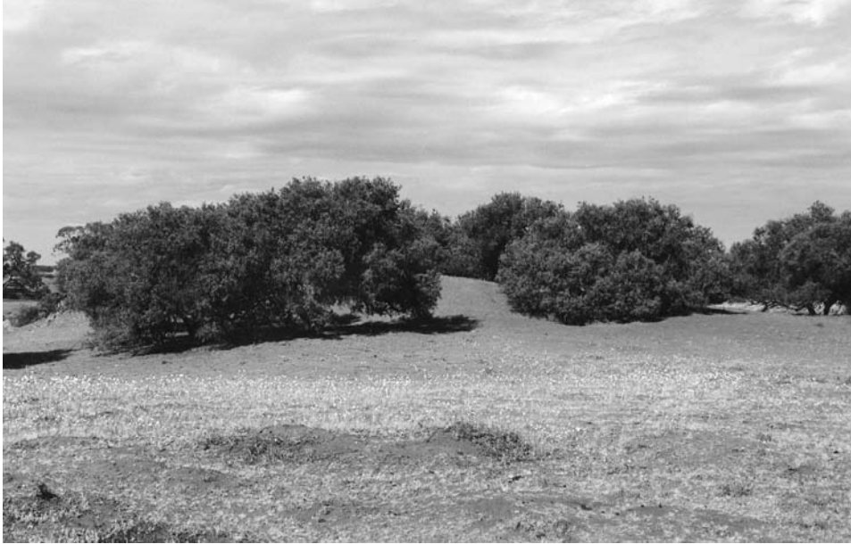
Fig. 7. Small areas of Acacia carneorum , an endangered species in NSW, occur to the south of Lake Cawndilla.