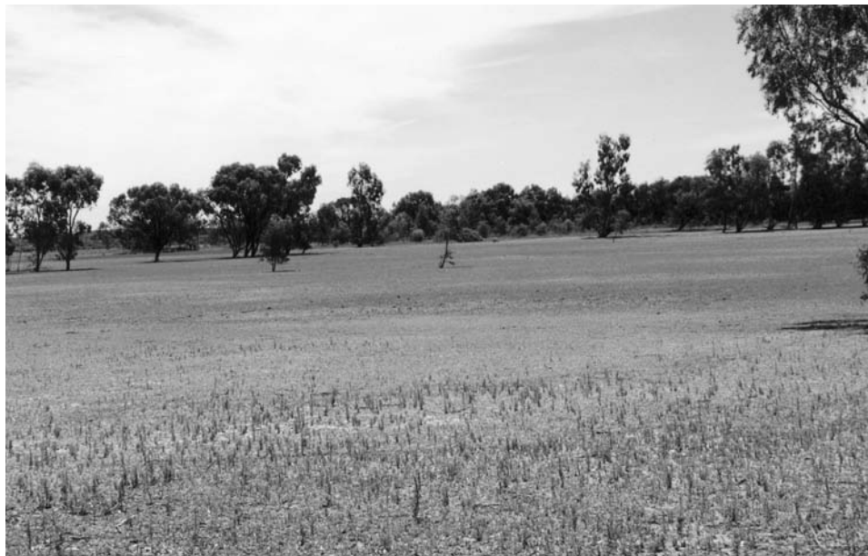
Fig. 12. Periodically inundated flats adjacent to the main lakes support a herbland community.