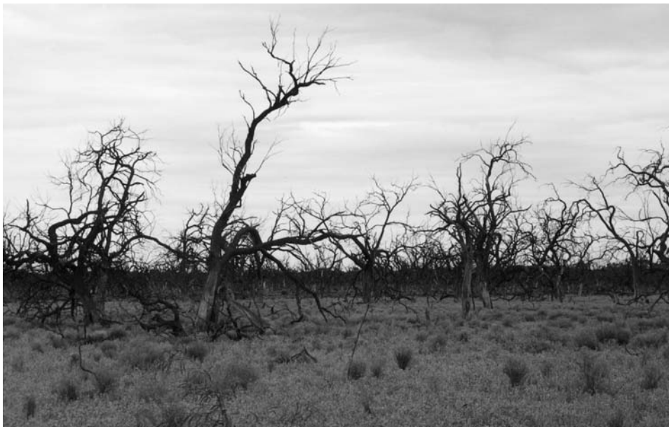
Fig. 15. Large areas of Eucalyptus largiflorens open-woodland have been killed as a result of prolonged flooding from the Cawndilla Channel.