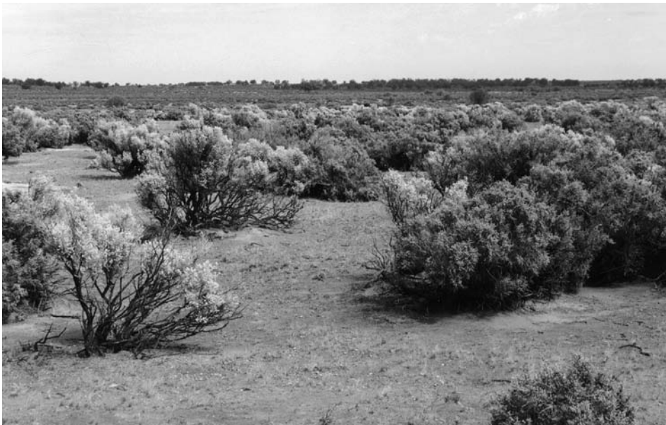
Fig. 8. The most extensive community of the park is Maireana pyramidata / Maireana sedifolia low open-shrubland.