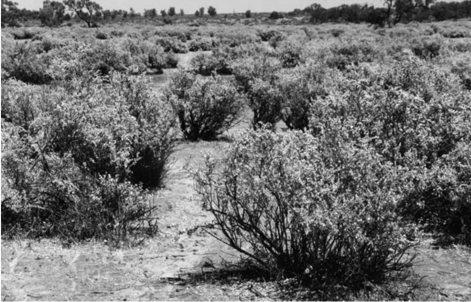
Fig. 9. Atriplex nummularia open-shrubland occurs adjacent to the Darling River and Cawndilla Channel.