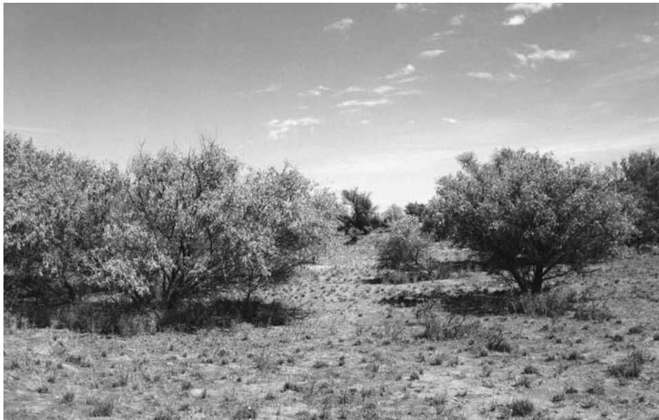
Fig. 6. Areas of Acacia victoriae subsp. victoriae open-shrubland occur in association with the Darling River floodplains.