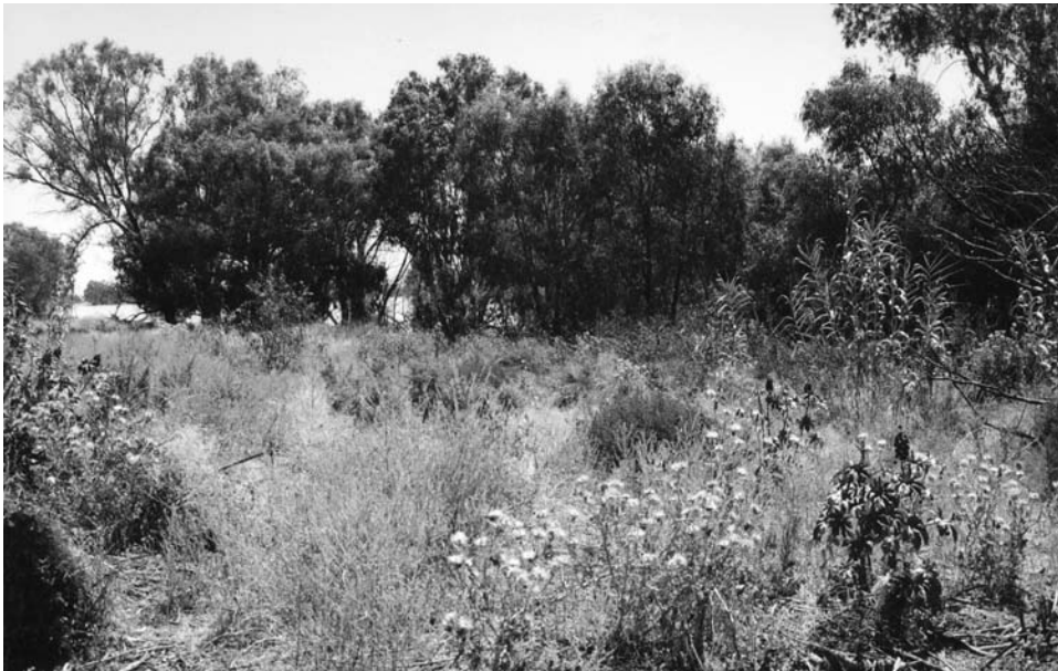
Fig. 13. Eucalyptus camaldulensis open-woodland communities around lake Menindee have a high level of exotic weeds.

Of the 503 species recorded from the Park, 100 (20%) are exotics. Mean percentage occurrence of exotic species ranged from 27% in the Eucalyptus camaldulensis open-woodland (Fig. 13) to 7% in the mixed shrubland (Table 1). The highest levels of occurrence of exotic species were in communities subject to the greatest influence from water, i.e. the open woodlands and herblands associated with the lakebeds and major channels. This is in accord with Westbrooke (1990) who found a high negative correlation between occurrence of exotic species and distance from water in studies at Mallee Cliffs National Park and Nanya Station. A number of exotics are winter rainfall