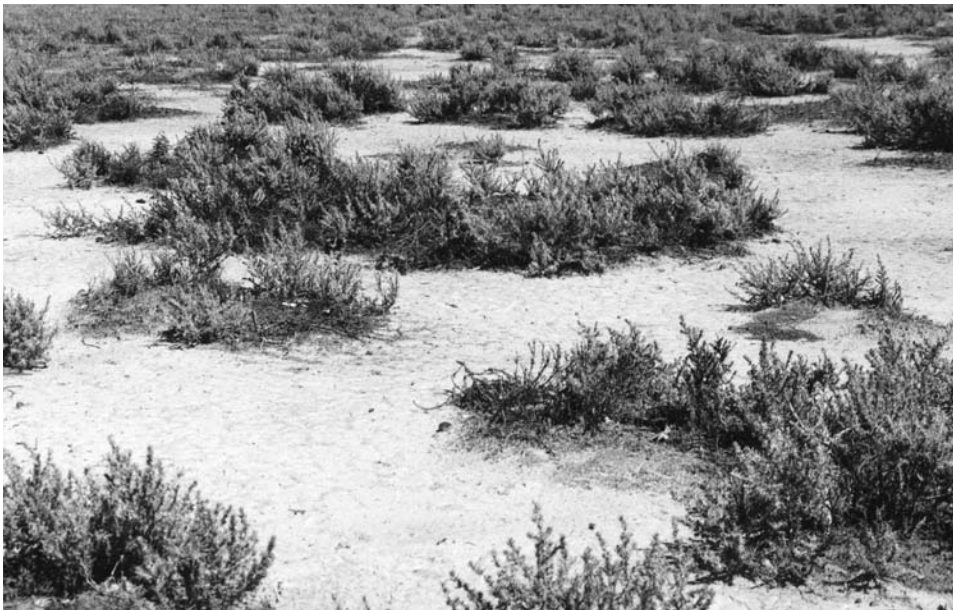
Fig. 10. In the south of the Park periodically flooded lakebeds support Sclerolaena spp./ Atriplex spp. low open-shrubland.