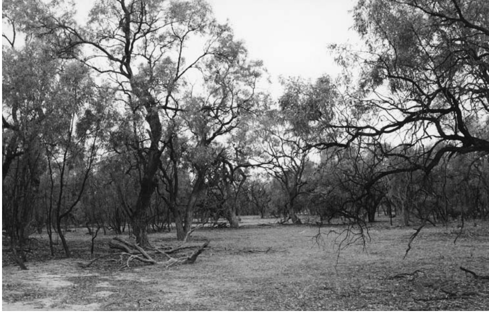
Fig. 3. Eucalyptus largiflorens open-woodland occurs across the floodplain of the Darling River.