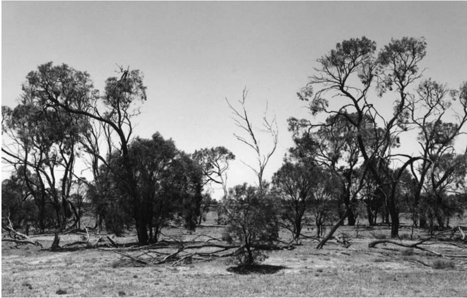
Fig. 5. Isolated stands of Acacia loderi tall open-shrubland show no recent regeneration.