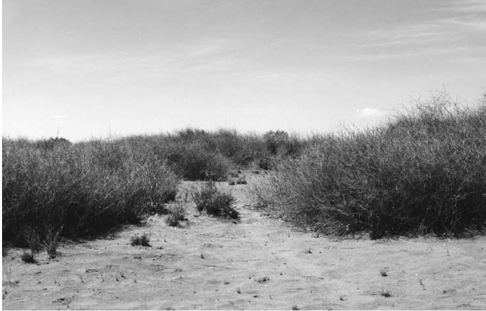
Fig. 11. The small areas of Zygochloa paradoxa hummock grassland occur on the Lake Cawndilla lunette.