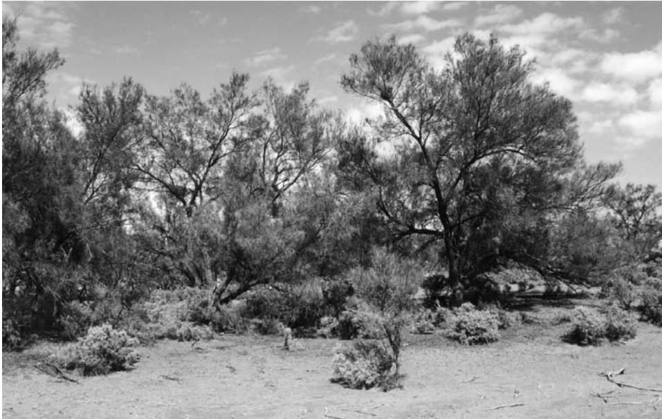
Fig. 4. Degraded examples of Casuarina pauper / Alectryon oleifolius low open-woodland occur in the south-west of the Park.