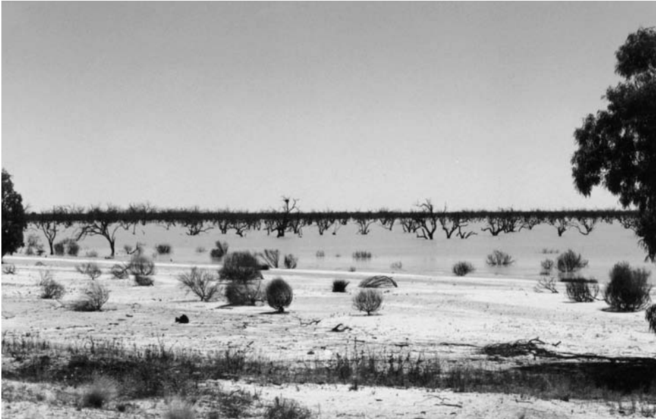
Fig. 14. Flooding of the lake system resulted in death of large areas of Eucalyptus largiflorens open-woodland.