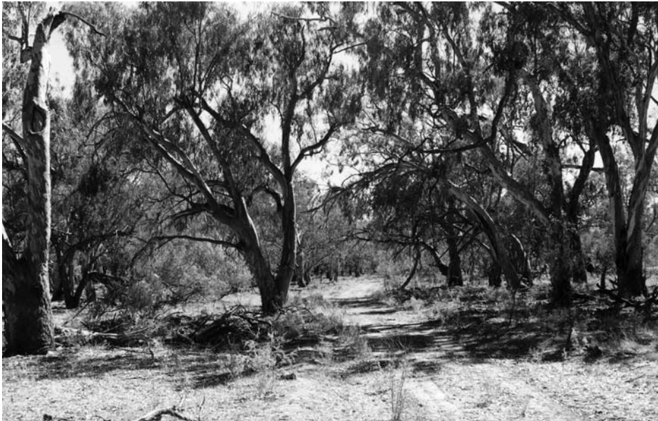
Fig. 2. Eucalyptus camaldulensis open-woodland occurs as a narrow strip along the Darling River.