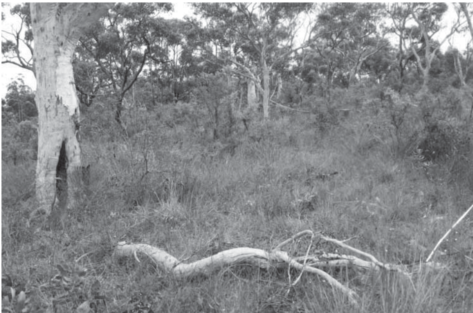
Fig. 3. Typical habitat for Cryptostylis hunteriana on the Central Coast of New South Wales: Coastal Plains Scribbly Gum Woodland near Wyee.

This specimen was located on a gentle undulating crest (2° slope to the south-west) on soils of the Gorokan (gk) soil landscape (Murphy 1993), in a very open 6–8 m woodland of Eucalyptus haemastoma , Corymbia gummifera , Banksia serrata and Angophora inopina . Understorey vegetation was comprised of a variety of heathy shrubs to 0.7 m in height (emergents to 1.5 m), such as Isopogon anemonifolius , Banksia oblongifolia , Hakea laevipes ( dactyloides ), Lambertia formosa , Leptospermum trinervium , Epacris pulchella , Grevillea sericea , Persoonia levis , Acacia suaveolens , Pimelea linifolia subsp. linifolia , Comesperma ericinum , Petrophile pulchella , Allocasuarina littoralis and Hakea teretifolia . Ground layer vegetation was well represented and merged with the shrub layer, and included Lomandra obliqua , Actinotus minor , Aristida vagans , Aristida warburgii , Lindsaea linearis , Melichrus procumbens , Patersonia sericea , Pultenaea sp. H, Panicum simile , Xanthorrhoea latifolia subsp. latifolia , Hibbertia vestita , Stylidium graminifolium and Mirbelia rubrifolia .