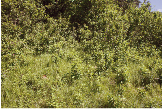
Fig. 1: Place of discovery of the infected spider: Grassland, dominated by tor-grass ( Brachypodium pinnatum ), which is interspersed with dogwood ( Cornus sanguinea ). – Photo: M. Meyer, June 2013

characterized by pine-forests, shrubs or barren calcareous sunny slopes.