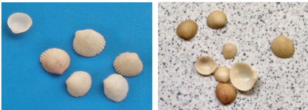
Plagiocardium papillosum (Poli, 1795) (L - 5mm)