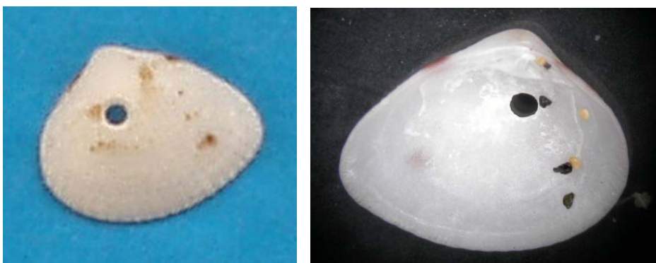
Timoclea ovata (Pennant, 1777) (L - 7mm)