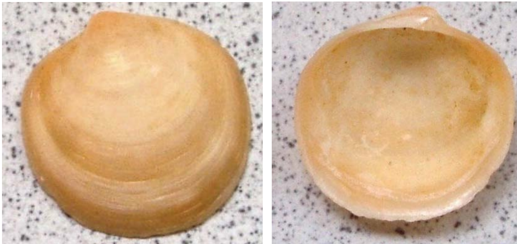
Diplodonta rotundata (Montagu, 1803) (L - 20mm)