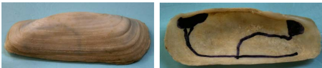
Tagelus adansoni (Bosc, 1801) (L - 60mm)