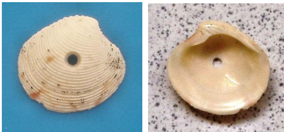
Venus declivis Sowerby, 1853 (L - 30mm)