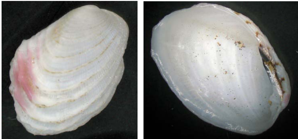
Irus irus (Linnaeus, 1758) (L - 12mm)