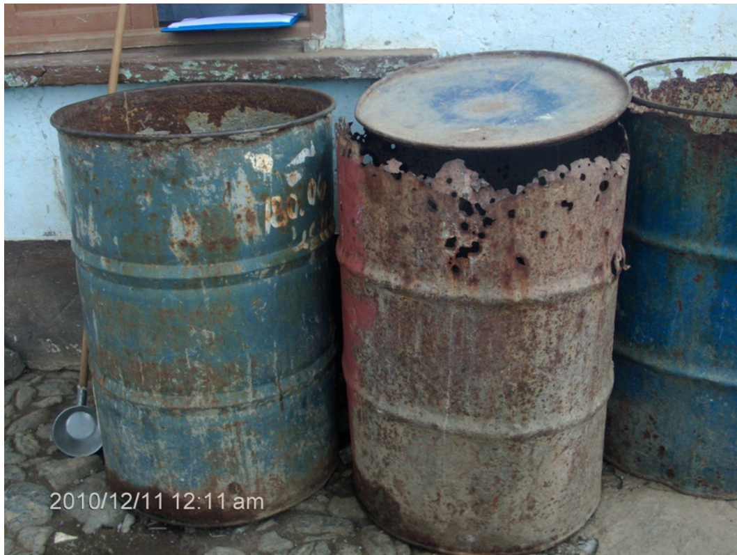
Fig. 3. Degraded drums, Achada Bel-Bel, Santa Cruz, Santiago, 11 December 2010.

Only two parameters evaluated in the logistic regression did not present any effect in container positivity. Container placement, when tested alone, showed no effect in container positivity (ANOVA, p > 0.05 ), but in interaction with container type, a moderate significant effect was demonstrated ( p < 0.05 ). This interaction augments the drums odds-ratio (OR) of 3.36 to 8.67, when compared with barrels (OR=1). We believe that this interaction is caused by socio-economic factors, because this interaction represents the number of containers indoors or outdoors of