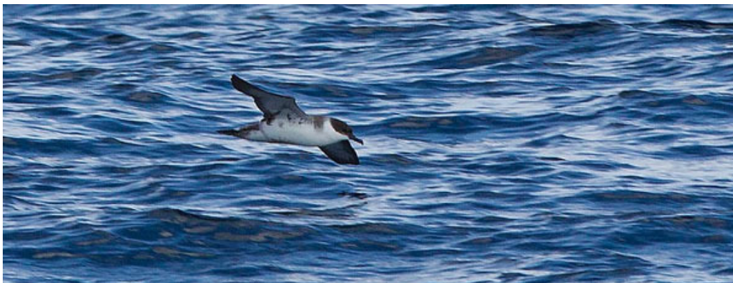
Fig. 5. Great shearwater Puffinus gravis , between São Nicolau and Raso, 9 November 2010 (Stefan Cherrug).

(2), October (1), November (3), December (2) and February (1). Off West Africa, it is a rare migrant visitor to offshore waters (Borrow & Demey 2001, Dubois et al. 2009). Breeds on islands in the Southern Ocean.