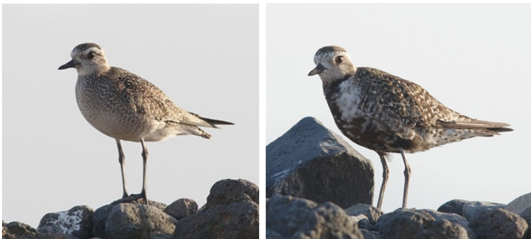
Fig. 18-19. American golden plover Pluvialis dominicus , first winter and adult, Porto Novo, Santo Antão, 23 November 2011 (Yann Coatanéa).

July) from Santiago (2), São Vicente (2), Sal (2), Boavista (6) and Maio (1). A locally common to very common migrant visitor along West African coasts (Borrow & Demey 2001).