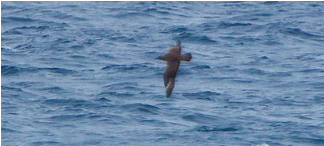
Fig. 23. Great skua Stercorarius skua , Curral Velho, Boavista, 13 November 2010 (Stefan Cherrug).

(3, 13) BOAVISTA: one off Curral Velho, 13 November 2010 (RBT, TS). In addition, one off Ponta do Barril, São Nicolau, 27 February 2012 (PAC), was presumably S. skua , but the possibility of S. maccormicki or another southern hemisphere taxon could not be ruled out with certainty. A Palearctic passage migrant and visitor, great skua winters (mainly September-March) in the Atlantic, south to West Africa, being uncommon off Mauritania and rare further south (Borrow & Demey 2001).