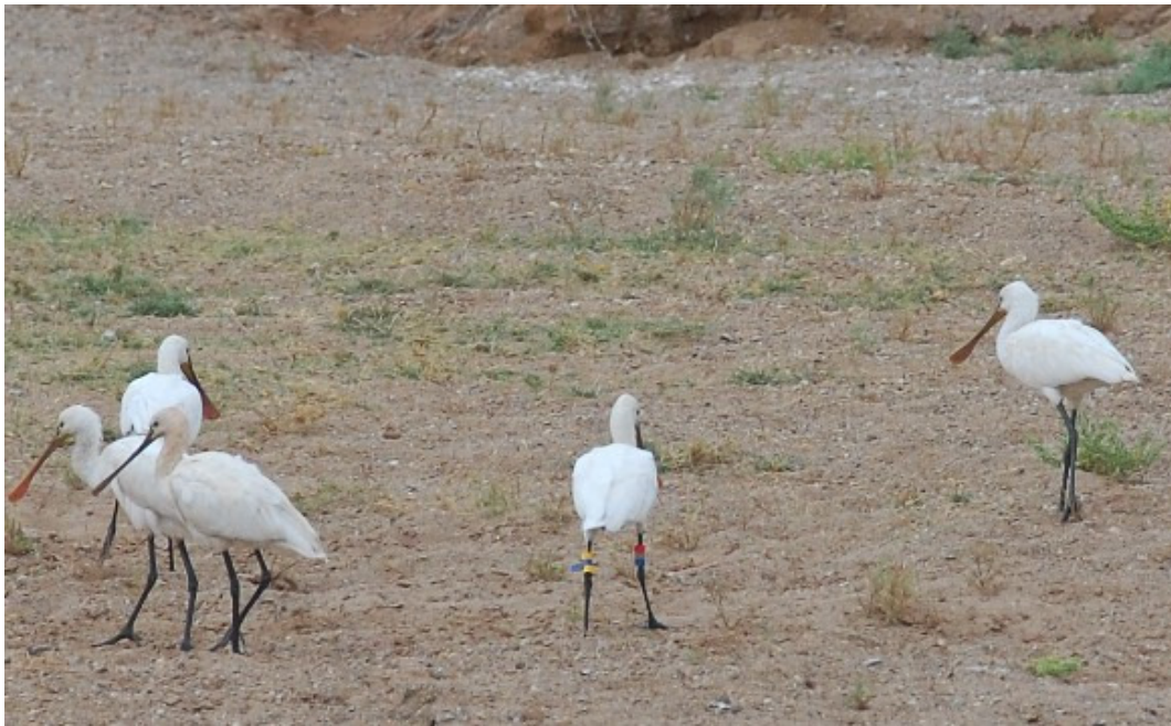
Fig. 14. Eurasian spoonbills Platalea leucorodia , Monte Trigo, Boavista, 20 May 2010 (Maria Camacho). The colour-ringed bird was marked as a nestling at Beveren, Belgium, 10 June 2008.

West Africa, it is a not uncommon to rare, locally sometimes common, resident and European migrant, widespread, mainly in the Sahel and northern savanna zones (Borrow & Demey 2001).