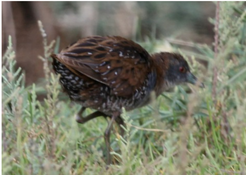
Fig. 17. Baillon's crane Porzana pusilla , Monte Trigo, Boavista, 1 April 2012 (Pedro López-Suárez).