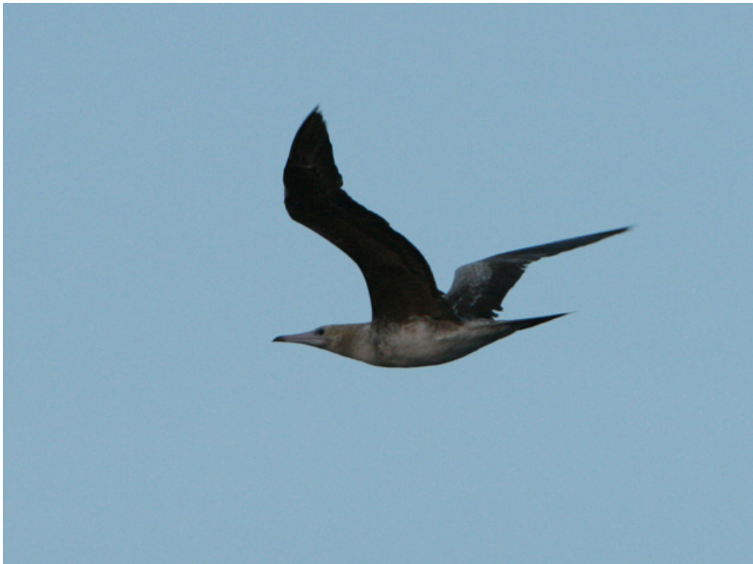
Fig. 7. Red-footed booby Sula sula , 17°14,9'N, 21°54,9'W, 14 April 2011 (Richard White).