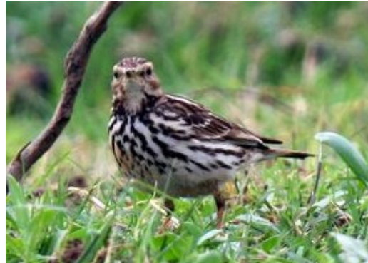
Fig. 26. Red-throated pipit Anthus cervinus , Santa Maria, Sal, 6 February 2011 (John Lines).