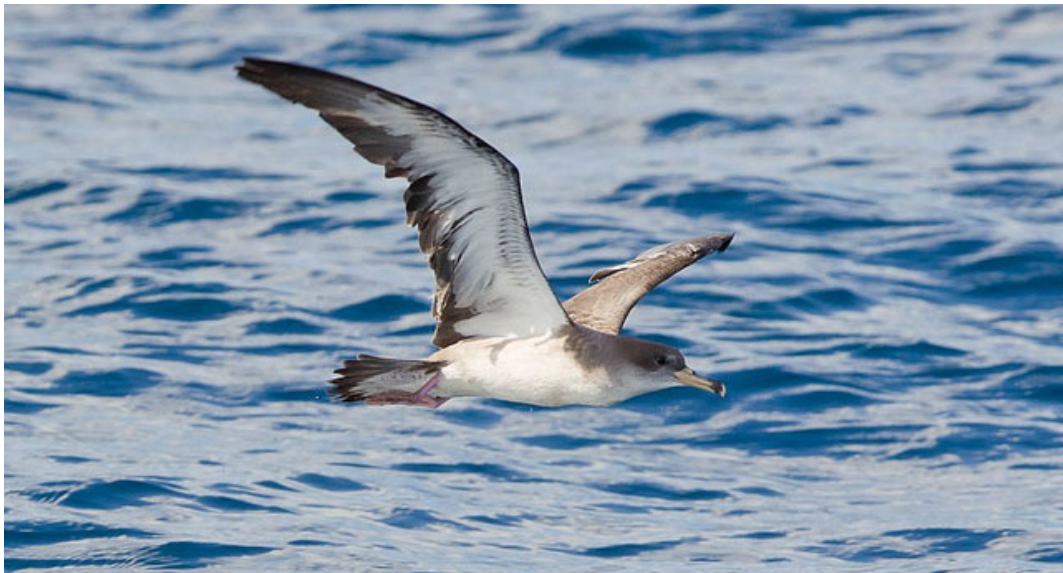
Fig. 4. Cory's shearwater Calonectris borealis , between São Nicolau and Raso, 9 November 2010.

(November-March) from Santiago (1), São Vicente (2) and Sal (1). There appear to be as yet no records from the West African mainland (cf. Borrow & Demey 2001).