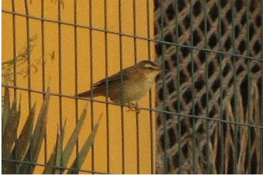
Fig. 28. Sedge warbler Acrocephalus schoenobaenus , Santa Maria, Sal, 16 September 2010.