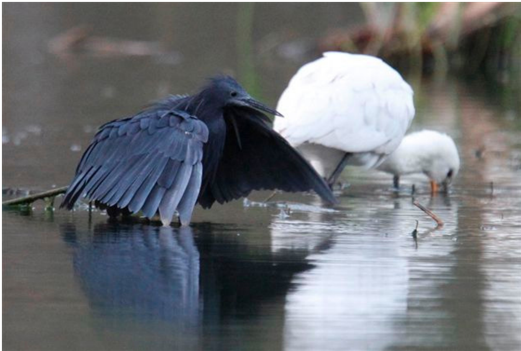
Fig. 10. Black heron Egretta ardesiaca , Barragem de Poilão, Santiago, 4 March 2012.

recorded (January-May) from Santiago (2), São Vicente (1), Raso (1) and Boavista (1). In West Africa, it is an uncommon to locally common resident, but local movements have been recorded (Borrow & Demey 2001).