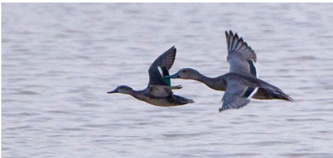
Fig. 3. Common teal Anas crecca and northern pintail A. acuta, Ribeira da Madama, Sal, 11 November 2010.