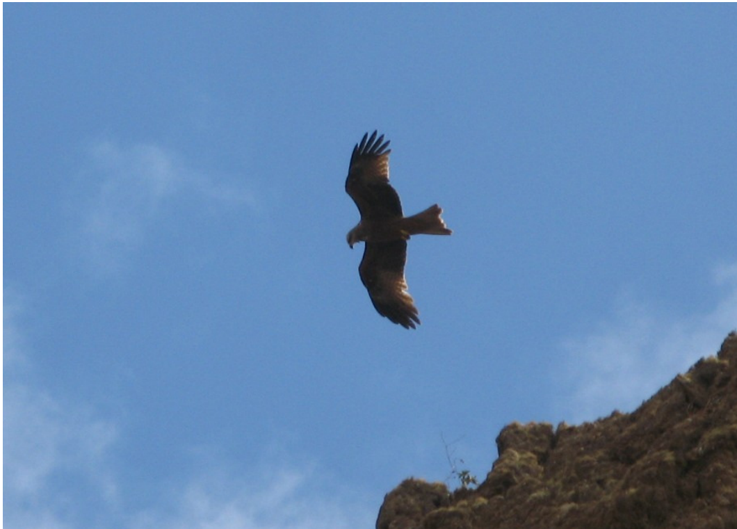
Fig. 1. Black Kite Milvus migrans , Monte Verde, São Vicente, 6 March 2011.

and the occurrence of six birds on São Vicente in 2011 comes as a surprise. It is as yet unclear whether the black kites seen in Cape Verde are local breeding birds or Palearctic migrant visitors. Very little information on breeding of black kite in the Cape Verde Islands exists.