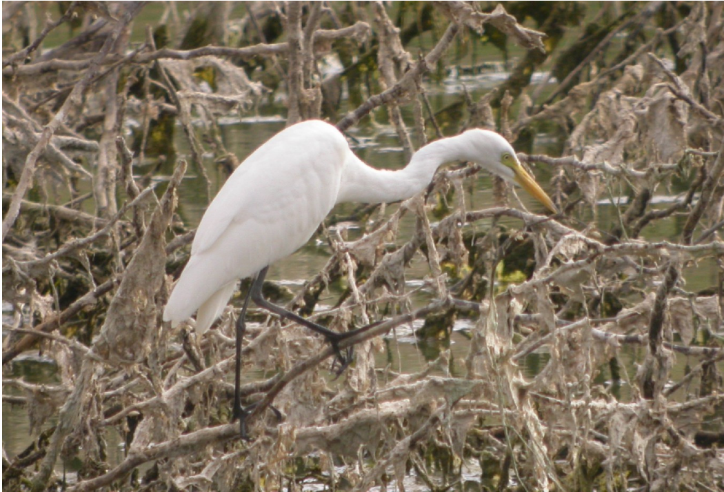
Fig. 11. Intermediate egret Egretta intermedia , Barragem de Poilão, Santiago, 22 March 2011.