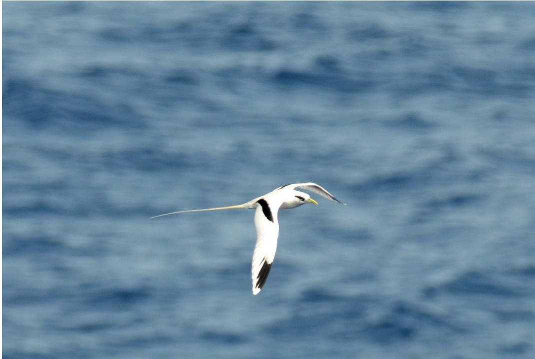
Fig. 6. White-tailed tropicbird Phaethon lepturus , off western Santiago, 3 May 2011 (Laurens Steijn).