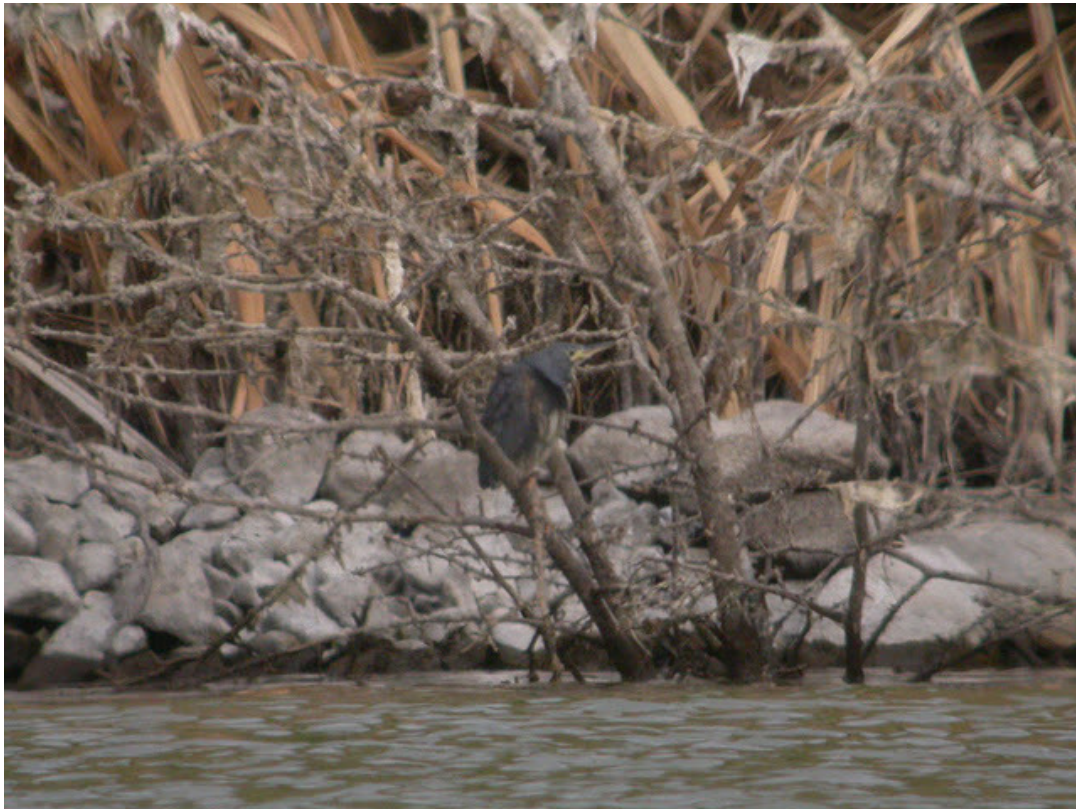
Fig. 8. Dwarf bittern Ixobrychus sturmii , Barragem de Poilão, Santiago, 12 June 2011.

taxon is an uncommon to scarce intra-African migrant, occurring during the wet season in suitable habitat throughout most of the region; movements are poorly understood due to its secretive habits (Borrow & Demey 2001).