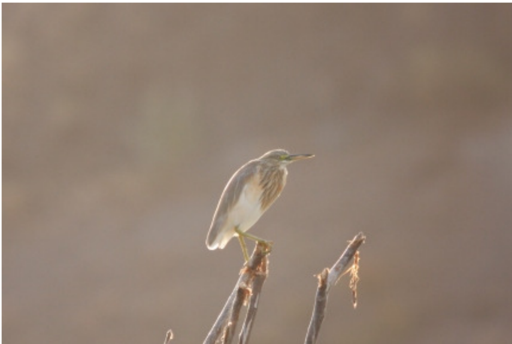
Fig. 9. Squacco heron Ardeola ralloides , Barragem de Poilão, Santiago, 22 March 2011.

(2, 11) SANTIAGO: singles at Barragem de Poilão, 6 June and 18 July 2009 (UF), are considered to have been the same bird(s) present there, 21 March-7 April 2009 (cf. Hazevoet 2010); up to seven at Barragem de Poilão, 18 November 2009-2 April 2010 (EB, UF); up to 10 there, 6 November 2010-29 May 2011 (DC, GBH, KDR, LS, MD, RBT, TS, UF), and up to seven at that locality, 24 September 2011-18 March 2012 (AML, BG, PAC, UF). Squacco heron has now been recorded in all months except August. Records are from Santiago (10), São Nicolau (1), Sal (1) and Boavista (1). In West Africa, migrants from Europe occur alongside residents during the northern winter and may outnumber them in most areas (Borrow & Demey 2001).