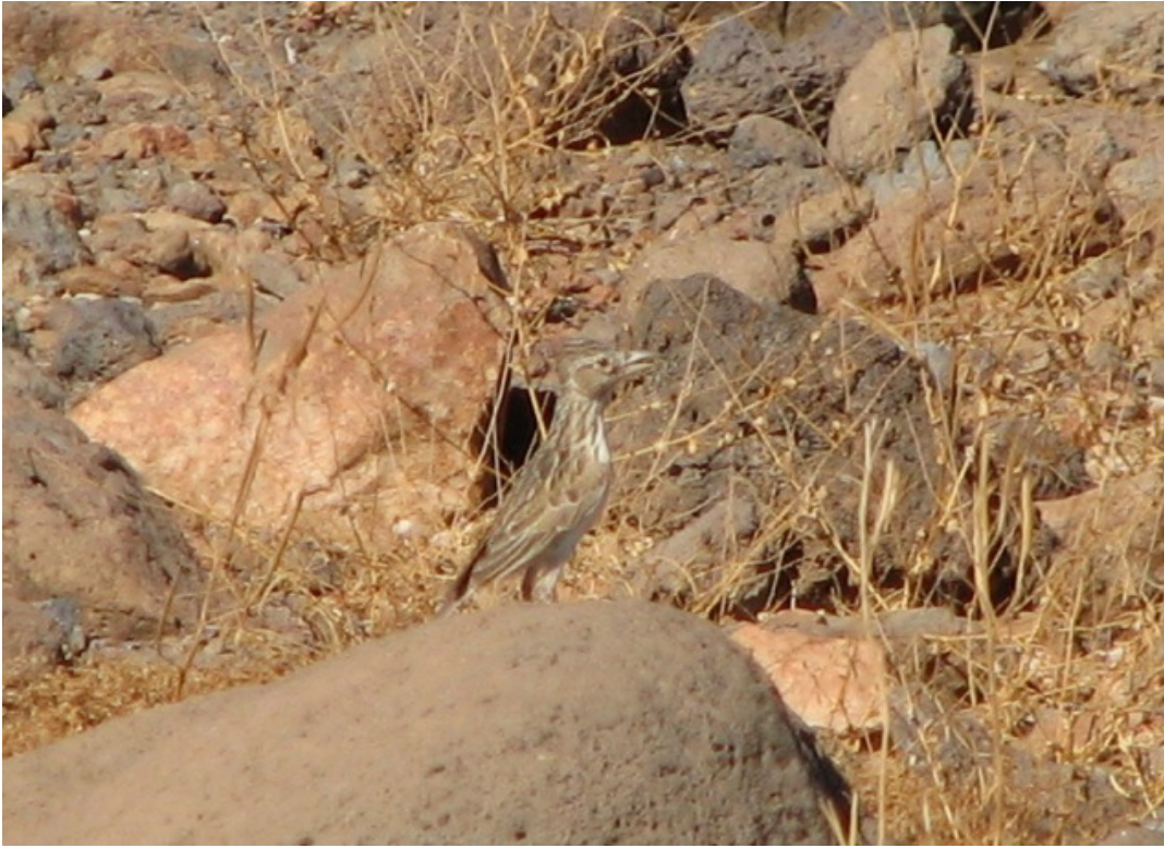
Fig. 2. Raso lark Alauda razae , Ponta do Barril, São Nicolau, 16 March 2009 (Jamie Hooper).