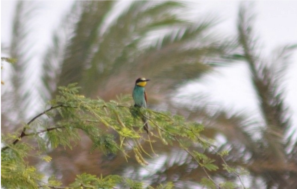
Fig. 25. European bee-eater Merops apiaster , Via Pitoresca, Boavista, 19 February 2012 (Pedro López-Suárez).