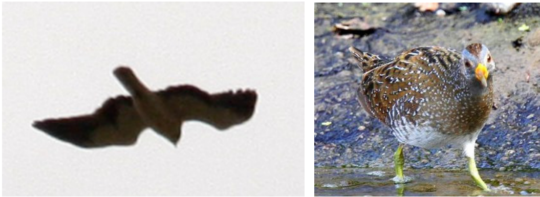
Fig. 15. Booted eagle Hieraaetus pennatus , Barragem de Poilão, Santiago, 21 March 2011. Fig. 16. Spotted crane Porzana porzana , Barragem de Poilão, Santiago, 4 March 2012.

(0, 4) SANTIAGO: one at Barragem de Poilão, 20 February-6 March 2011 (UF), and 1-2 there, 26 November 2011-4 March 2012 (PAC, UF). SAL: one at Ribeira da Madama, 11 November 2010 (Barone et al. 2012). BOAVISTA: one at Rabil lagoon, 24 November 2011 (RT). These are the first records of Eurasian coot for the Cape Verde Islands. In West Africa, it is a rare to locally common Palearctic winter visitor to desert oases and Sahel, and it has bred in northern Senegal (Borrow & Demey 2001).