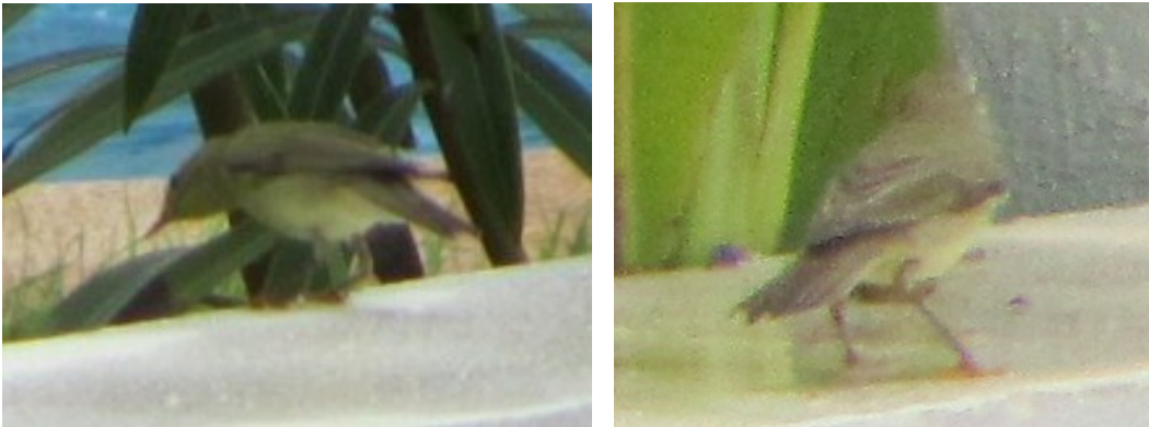
Fig. 29-30. Melodious warbler Hippolais polyglotta , Ponta Preta, Sal, 18 September 2010 (Steve Payne).