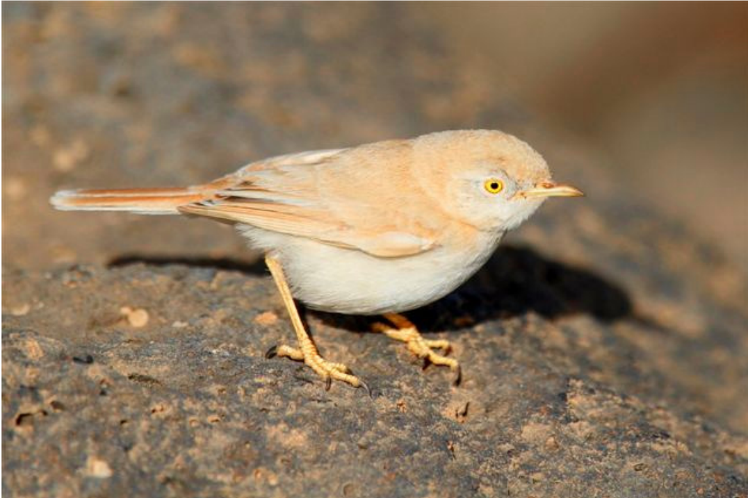
Fig. 31. African desert warbler Sylvia deserti , Raso, 28 February 2012 (Eric Didner).