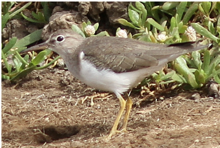
Fig. 22. Spotted sandpiper Actitis macularius , Pedra Badejo, Santiago, 2 March 2012.

(2, 21) SANTIAGO: singles were seen at Barragem de Poilão on several occasions from 18 July 2009 to 2 April 2010, with three there, 7 March 2010 (EB, UF), these are here counted as a single record; again 1-4 at Barragem de Poilão, 22 January-17 July 2011 (DC, GBH, KDR, UF), 1-3 there, 22 February-18 March 2012 (PAC, UF), and two at Pedra Badejo, 22 February-4 March 2012 (PAC). SAL: 1-3 at the sewage works near Santa Maria, 1-14 February 2010, and one there, 1-6 February 2011 (JLD). BOAVISTA: 2-3 at the lagoon near Curral Velho, 2 February 2012 (AML). Green sandpiper has been recorded (July-April) from Santiago (12), São Vicente (3), São Nicolau (1), Sal (2), Boavista (4) and Maio (1). In West Africa, it is a common to not uncommon Palearctic passage migrant and visitor throughout, mainly September-April (Borrow & Demey 2001). With 21 records since 1980 (and many more individuals involved), it is clear that green sandpiper is a regular migrant visitor to the Cape Verde Islands and, except for unusual records, it will not be included in future reports anymore.