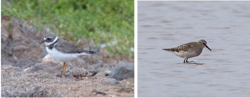
Fig. 20. Semipalmated plover Charadrius semipalmatus , Ponta do Sol, Santo Antão, 23 March 2010. Fig. 21. White-rumped sandpiper Calidris fuscicollis , Sal Rei, Boavista, 13 November 2010.