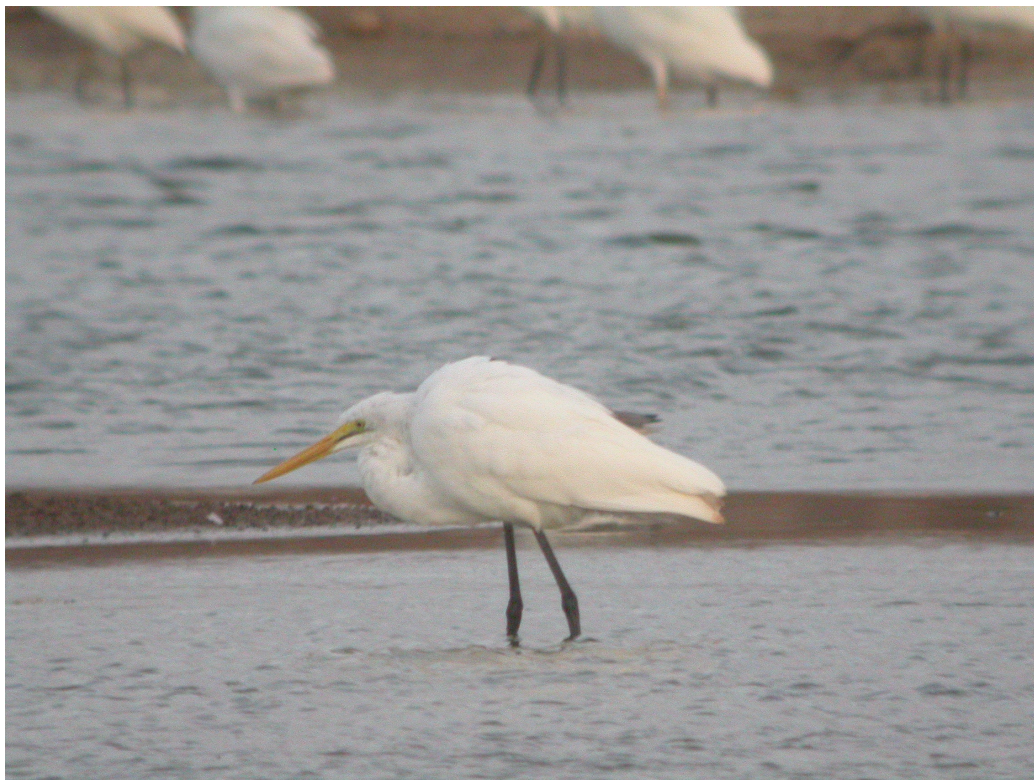
Fig. 12. Great white egret Casmerodius albus (showing characters of American great white egret C.a. egretta ), sewage ponds, São Vicente, 1 March 2012 (Pierre-André Crochet).