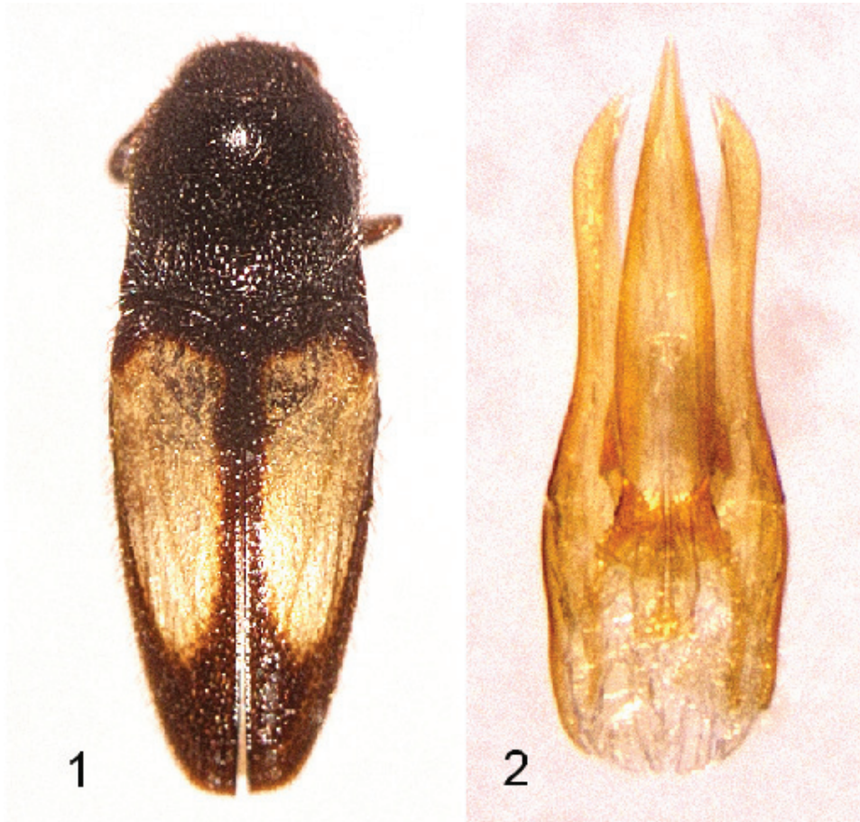
Figures 1–2. Drapetes chiricahua , new species. 1) Adult male, dorsal habitus. 2) Aedeagus, dorsal aspect.

Female (n = 1) externally similar to male; slightly broader in silhouette.