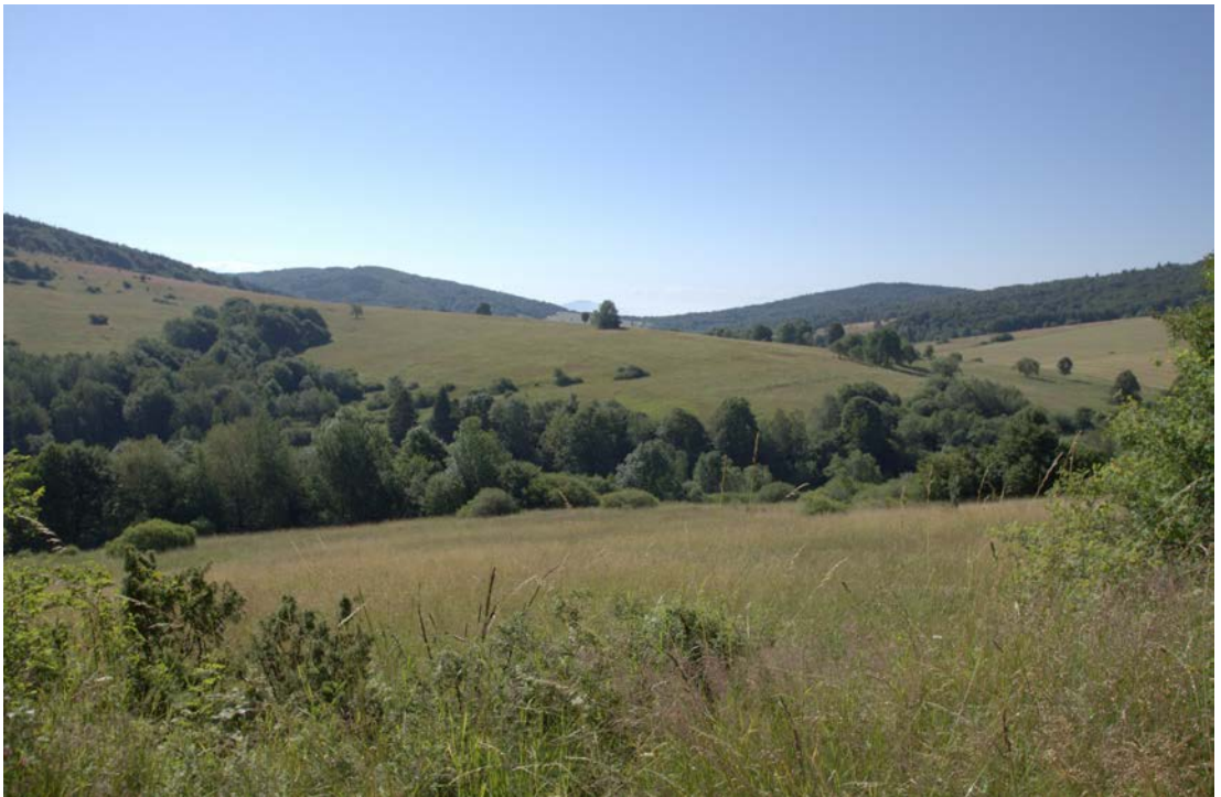
Fig. 1. Typical landscape of the Beskid Niski Mts – view of Ciechania village in Magurski National Park.

built of Carpathian flysch (Fig. 1). Altitude ranges mainly from 650 to 700 m a.s.l., reaching maximum of 847 m at the summit of Magura Wątkowska Mt. The park covers 19,439 ha of the Wisłoka River valley, including its upper reaches and origin. MNP is located in a pass in the Carpathians where two