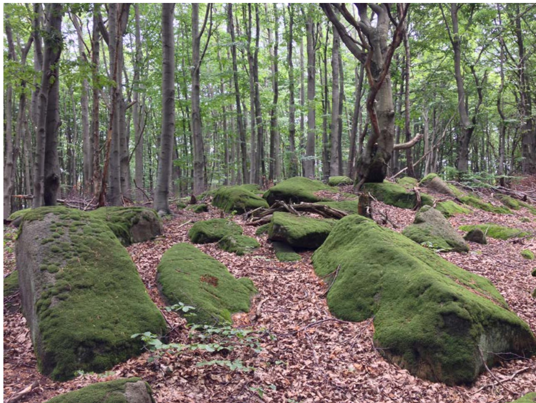
Fig. 2. Dentario glandulosae-Fagetum – dominant forest association in Magurski National Park.

main ecological corridors intersect: north-south and east-west. The park is a typical woodland (90% wooded area) with relatively well-preserved vegetation. The most frequent forest community is Dentario glandulosae-Fagetum , which creates the characteristic landscape of the park (Fig. 2). Sycamore woods, rare in the Polish Carpathians, are represented by three associations: Sorbo-Aceretum , which occurs only on the peak rocks on Kamień Mt., Phyllitido-Aceretum , occurring on Magura Wątkowska Mt., Kamień Mt. and Suchania Mt., as well as Lunario-Aceretum developed in several patches. In the foothills there are mainly planted and managed stands dominated by pine, as well as multi-species riparian forests, and rarely hornbeam woods. Non-forest vegetation is represented by varied meadow and grassland communities, and also peat-bogs. Biocenoses in MNP having