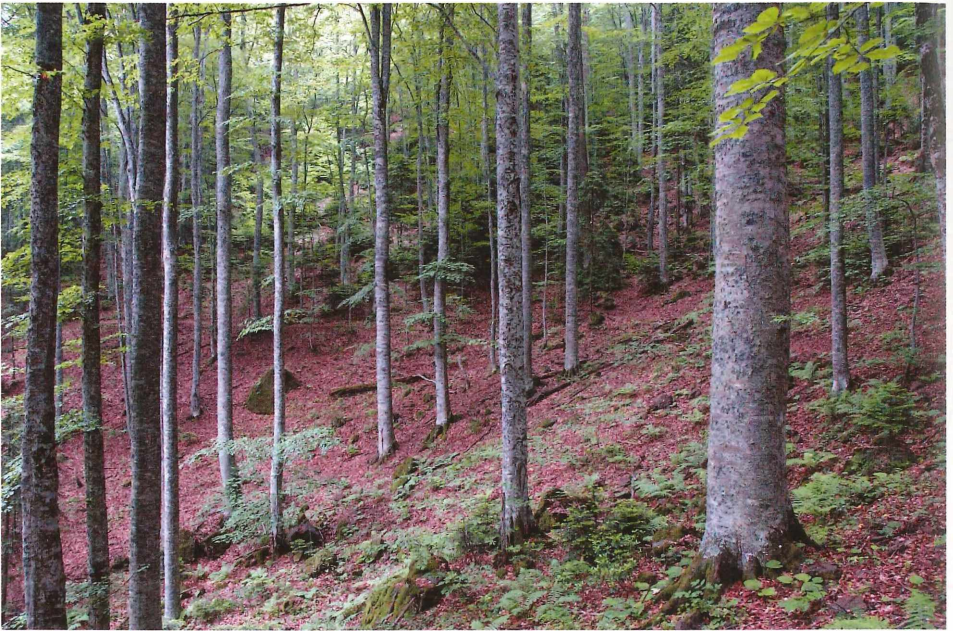
Fig. 3: Oriental beech forest ( Fagus orientalis ) in the Yedigöller National Park (Northwest Turkey).

Abb. 3: Orientbuchenwald ( Fagus orientalis ) im Nationalpark Yedigöller (Nordwest-Türkei).