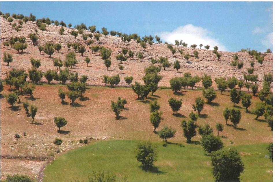
Fig. 6: Agrosylvopastoral deciduous oak woodland in the Nemrud National Park, province of Adiyaman, eastcentral Turkey. Photo: U. Hauke, June 2005.