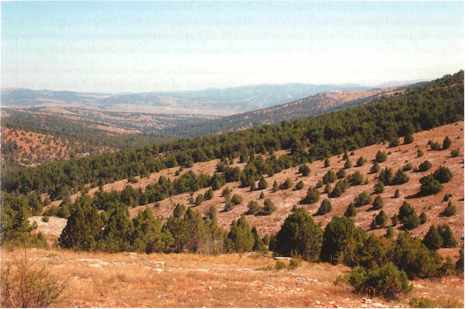
Fig. 5: Juniperus excelsa pasture woodlands in Central Anatolia, province of Sivas. Photo: U. Hauke, August 2005.