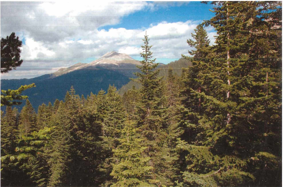
Fig. 4: Abies bornmuelleriana forest near timberline at 1700 m in the Ilgaz mountain range (province of Kastamonu, northern Turkey). Photo: U. Hauke, June 2005.

Abb. 3: Orientbuchenwald ( Fagus orientalis ) im Nationalpark Yedigöller (Nordwest-Türkei). Foto: U. Hauke, Juni 2005.