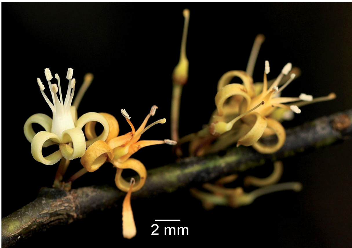
Fig. 3. Rhaphiostylis beninensis (Hook.f. ex Planch.) Planch. ex Benth., like Fig. 2, but also showing ovary and style in older flowers. Photograph by Bart Wursten from Boyekoli Ebale Botany 785 (BR) from Congo Kinshasa (copyright Botanic Garden Meise).

part of Liberia, and while it is not sure that the species grows in a protected area, “Vulnerable” should be the correct status for the moment (B1 & B2 ab(iii), IUCN 2015).