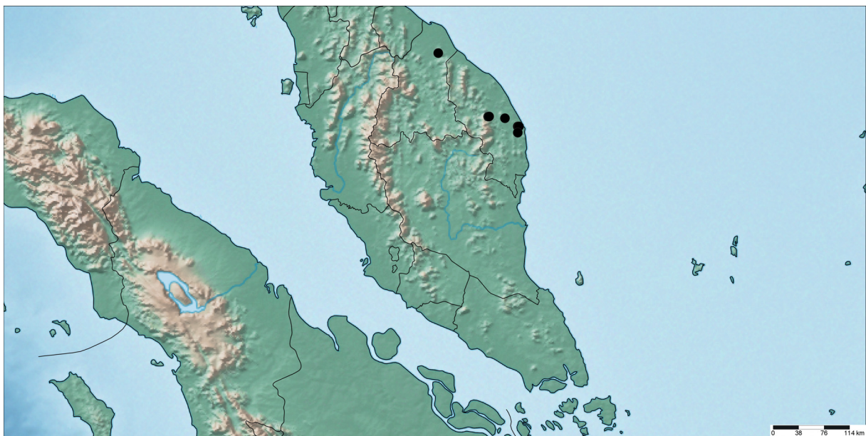
Fig. 2. Map showing the collecting localities of Polyalthia pakdin I.M. Turner & Utteridge sp. nov.

Polyalthia rufa Craib, Bulletin of Miscellaneous Information, Kew 1924: 82 (Craib 1924). – Type: Thailand, Nakawn Sawawn, Mè Wong, 25 May 1922, A.F.G. Kerr 6022 (holo-: K[×2] (K00595497, K00595496); iso-: ABD, BM (000553972(BM))).