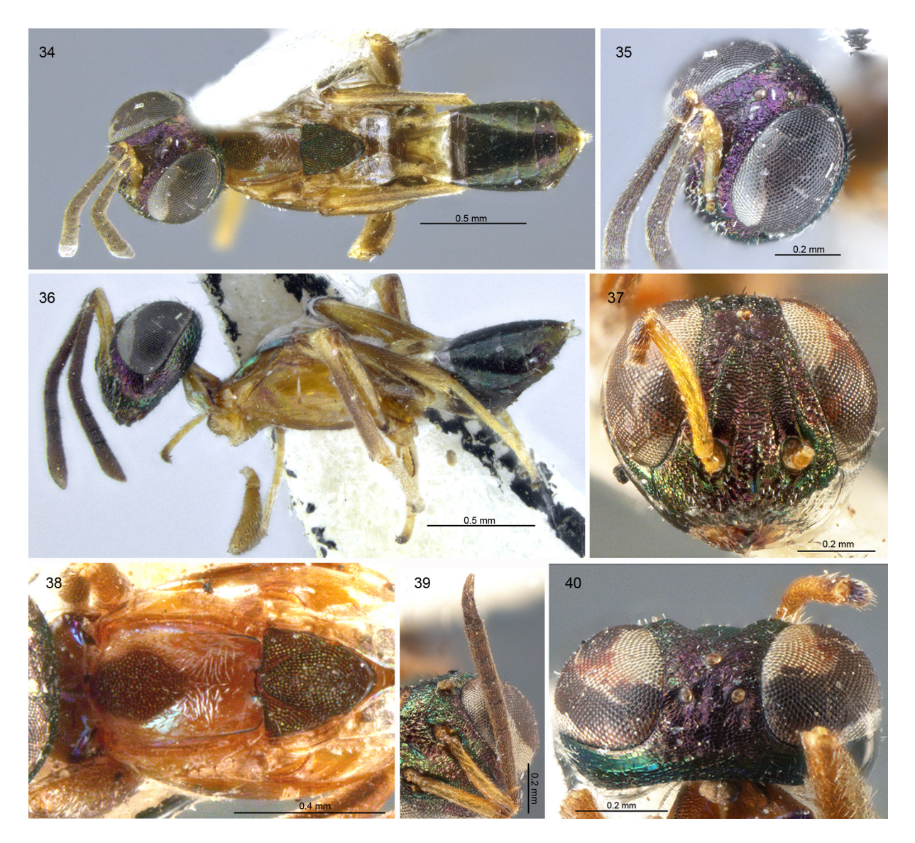
Figs 34–40. Anastatus meilingensis Sheng & Yu, 1998. 34–36, 39. Holotype, \bigcirc . 37, 38, 40. Paratype, \bigcirc . – 34. Body, dorsal view. 35. Head, frontodorsal view. 36. Body, lateral view. 37. Head, frontal view. 38. Mesonotum, dorsal view. 39. Antenna. 40. Head, dorsal view.

HEAD. In frontal view (Fig. 37) about 1.32 \times wider than high; in dorsal view (Fig. 40) width about 2.0 \times length, hind margin slight concave; in lateral view (Fig. 36) about 1.55 \times higher than long. Eye height 1.57 \times eye length in lateral view; distance between eyes below 2.2 \times distance between eyes above; malar space about 0.43 \times eye height; distance between toruli 1.29 \times as long as distance between torulus and clypeal edge, and 1.8 \times distance between torulus and orbit; frontovertex narrower than eye. OOL: POL: LOL = 3: 9: 9. Vertex (Fig. 40) imbricate with several brown hair-like setae, frons coriaceous with white hair-like setae; lower face (Fig. 37) alveolate with short translucent hair-like setae, and medially angulate; gena strigose; parascrobal region and interantennal region rugose, interanternnal region with few translucent hair-like setae. Scrobal depression (Fig. 37) with scrobe alveolate and deep, distinctly delimited ventrally but not distinctly delimited dorsally, separated from anterior ocellus by distance equal to diameter of anterior ocellus. Lower orbit about in line with ventral margin of torulus. Antenna (Fig. 39) with relative length (width) of scape = 35(5); pedicel 7(4); anellus 3.5(3.5); 1^{st} to 7^{th} funculars: 8(4): 9(5): 10(6): 9(6): 8(6.5): 7.5(7): 7(7); clava 18(7.5).