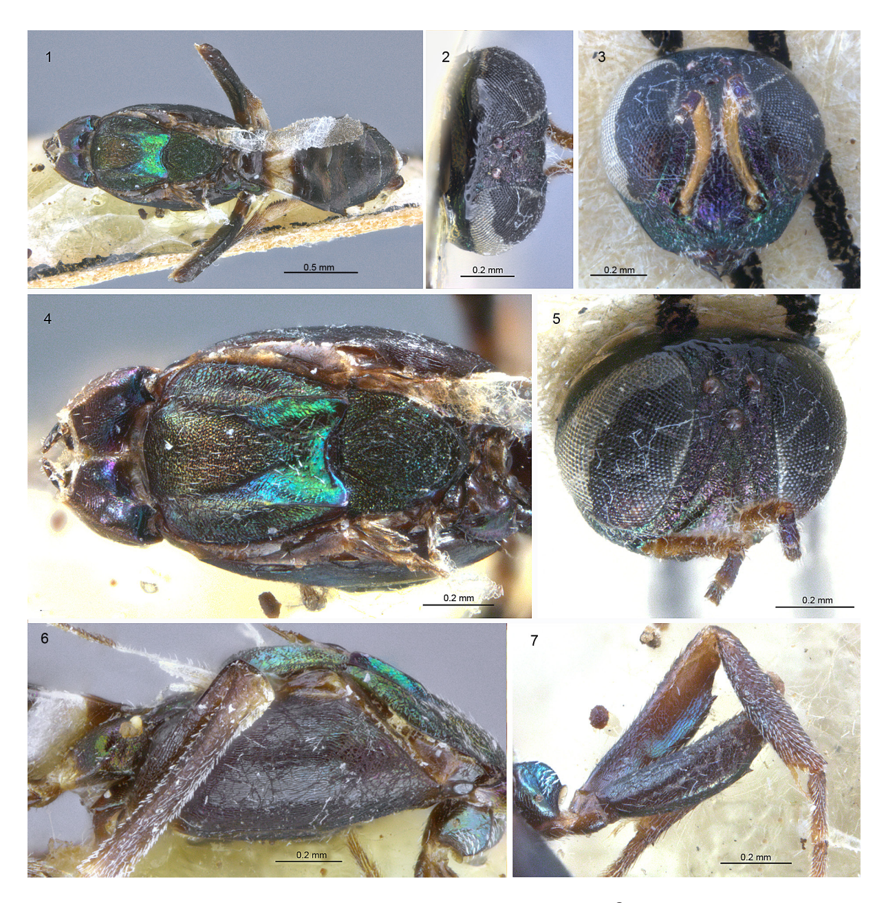
Figs 1–7. Anastatus dexingensis Sheng & Wang, 1997. 1–6 . Holotype, \bigcirc . 1 . Body, dorsal view (wing mostly destroyed, remnants superficially appear like a short wing). 2 . Head, dorsal view. 3 . Head, frontal view. 4 . Mesosoma, dorsal view. 5 . Head, frontolateral view. 6 . Mesosoma, lateral view. -7 . Paratype, \bigcirc , front legs.

and 2.4 \times distance between torulus and orbit; frontovertex narrower than eye. OOL: POL: LOL = 2.5: 7: 5.5. Vertex and frons reticulate with a few white setae; lower face reticulate-rugose, with dense lanceolate white setae (mostly broken), medially angulate; gena and parascrobal region reticulate; scrobes imbricate; interantennal region imbricate with dense white lanceolate setose. Scrobal depression (Fig. 5) with scrobes shallow and channel-like, with lateral margin carinate ventrally but very weak dorsally, the dorsal margin not clearly delimited but dorsal-most limit of lateral margin 2.3 × diameter of anterior ocellus from ocellus. Lower orbit higher than ventral margin of torulus (Fig. 3). Antenna with relative length (width) of scape = 42(6); pedicel 10(5); anellus 5(5).