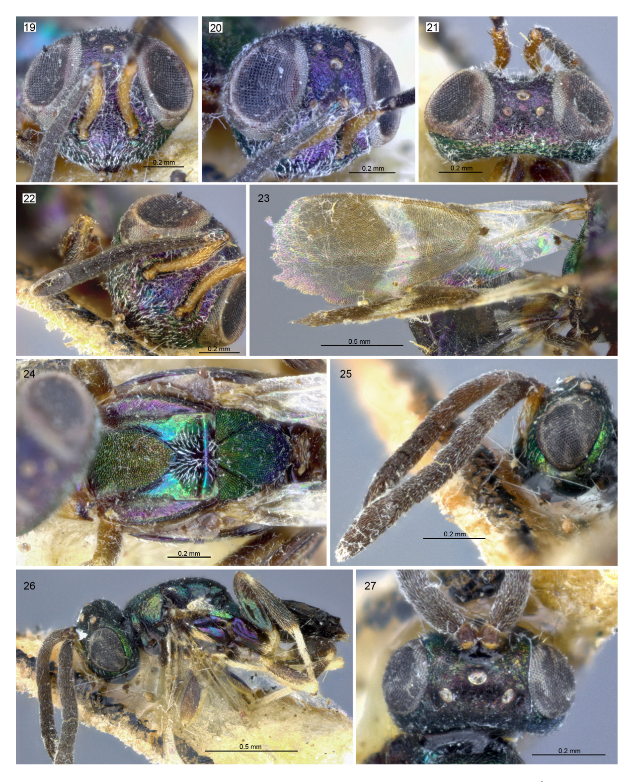
Figs 19–27. Anastatus fulloi Sheng & Wang, 1997. 19–24. Holotype, ♀. 25–27. Allotype, ♂. – 19. Head, frontal view. 20. Head, frontolateral view. 21. Head, dorsal view. 22. Antennae. 23. Fore wing. 24. Mesonotum. 25. Antennae. 26. Body, lateral view. 27. Head, dorsal view.