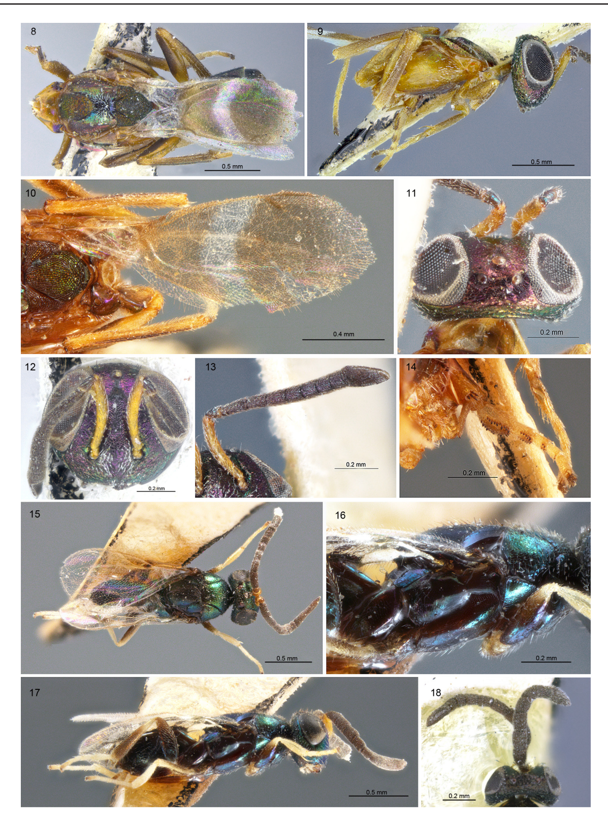
Figs 8–18. Anastatus flavipes Sheng & Wang, 1997. 8 , 12–13 . Holotype, \bigcirc . 9–11, 14 . Paratype, \bigcirc . -8 . Body, dorsal view. 9 . Body, lateral view. 10 . Scutellar-axillar complex and fore wing. 11 . Head, dorsal view. 12 . Head, frontal view. 13 . Antenna. 14 . Apex of mesotibia and mesotarsus. – 15–18 . Allotype, \bigcirc . 15 . Body, dorsal view. 16 . Mesosoma, lateral view. 17 . Body, lateral view. 18 . Antennae.