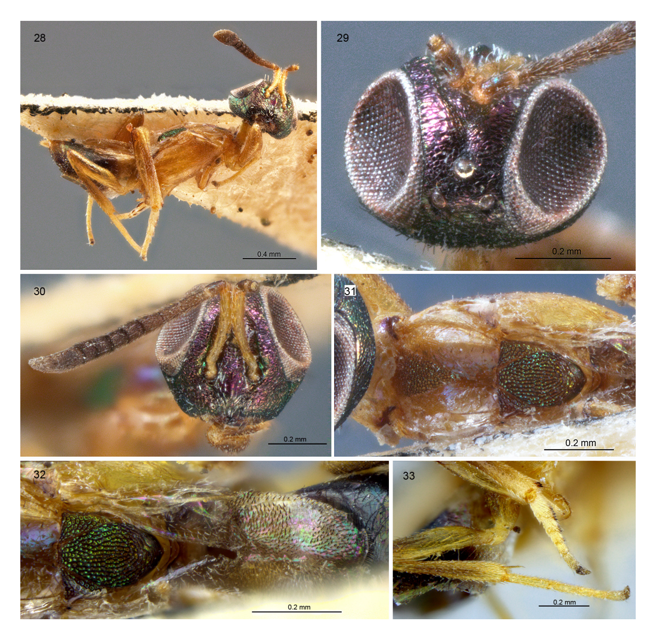
Figs 28–33 . Anastatus huangi Sheng & Yu, 1998, holotype, \bigcirc . 28 . Body, lateral view. 29 . Head, frontodorsal view. 30 . Head, frontal view. 31 . Mesosoma, dorsal view. 32 . Scutellar-axillar complex and fore wing, dorsal view. 33 . Middle and hind legs.

GASTER (Fig. 28). Shorter than mesosoma; ovipositor sheath exserted for distance equal to length of syntergum.