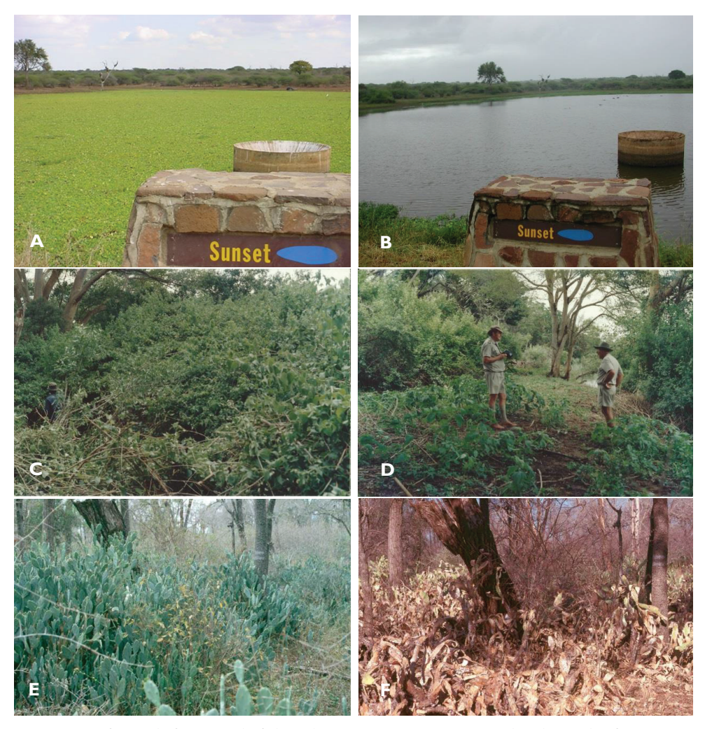
Figure 2. Before and after control of alien plant species in Kruger National Park, South Africa. Sunset Dam was heavily infested by Pistia stratiotes ( A ), which was effectively eliminated by a combination of biological and chemical control ( B ). Dense invasions of Lantana camara along the Sabie River ( C ) have required intensive mechanical and chemical control to clear ( D ). Populations of Opuntia stricta ( E ) have been effectively reduced to low numbers with biological control ( F ).

alien invasive plant densities by 80%. This study concluded that "Continuous clearing acts to effectively limit the establishment and spread of many invasive species despite the ever-present threat of invasion from upstream. Furthermore, the continuous clearing of invasive alien plant stands in KNP ensures that stands are relatively short-lived, preventing long lasting negative impacts on the ecosystem. Removal of invasive alien plant species reduces their disproportionate competitive influence and facilitates the natural re-establishment of native vegetation". This study re-enforces the views of staff above that the densities of some species have decreased.