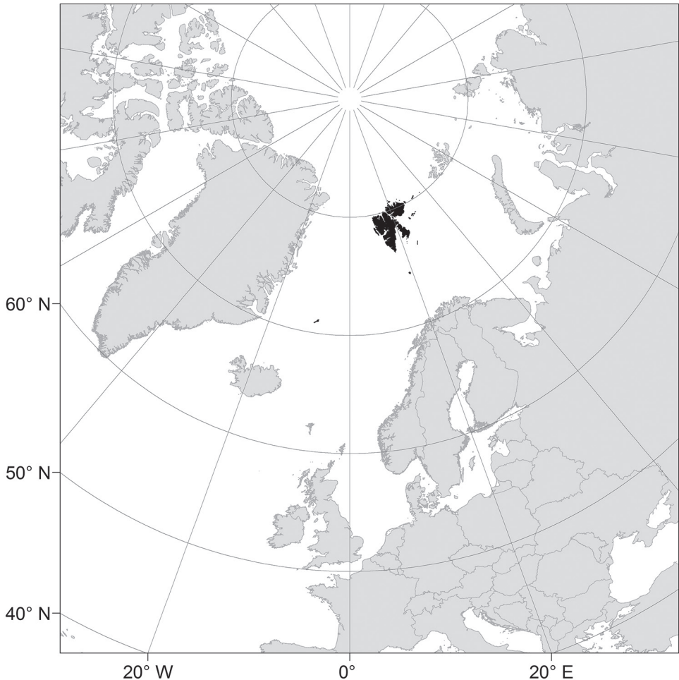
Figure 1. Geographical location of the study site Svalbard (highlighted in black).