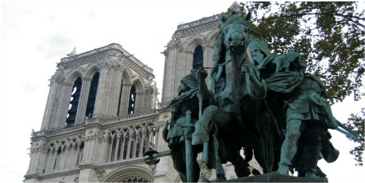
Image Credit: Statue of Charlemagne, Notre Dame, Paris

For the most part, the work takes a positive view of Charlemagne and his activities, presenting him as something of a saviour of western civilisation and of western Christianity. The conversion of pagans to Christianity, for instance, is interpreted as a sign of Charlemagne's civility. Charlemagne's Admonitio (a collection of legislature reforming the Frankish Kingdom) ensured 'murder, theft, unlawful marriage, and bearing false witness were all punishable offences' (265). This is certainly one of the goals of the document, but here it is presented in such a way as to suggest that prior to the Admonitio , the pagan peasantry were lawless and obsessed with never-ending blood feuds.