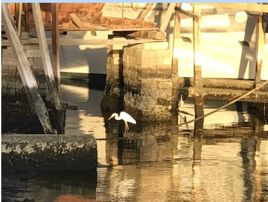
White Heron at sunset—taken by an enormous traditional wooden dhow being constructed at Jadhafs, Dubai (M. Swan)