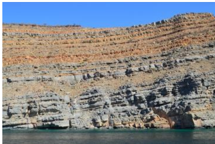
Layers forming the Musandam, Oman