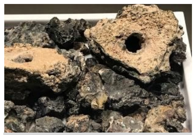
Slag remains provide evidence for the mass smelting of copper at the site. The hole reveals where a pipe was inserted to help to control the temperature in the furnace.