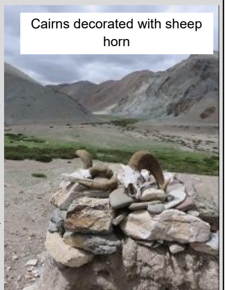
(Continued on page 6)

High up on the mountain slopes we saw herds of Tibetan Sheep. Some were indicated by the guides as Blue Sheep.