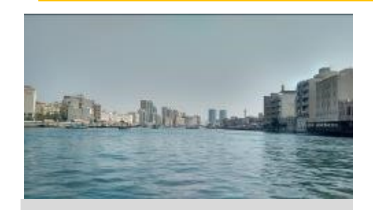
An Abra ride on the Creek offers a different perspective of the city