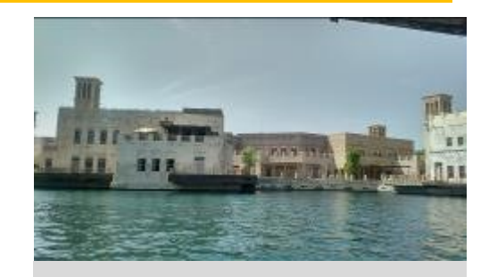
New Creek developments blend in seamlessly with the Old Fahidi District