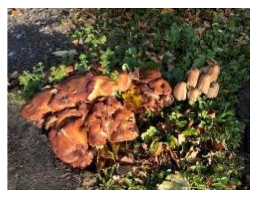
I couldn't help but notice different types of fungi, randomly growing in a medical practice car park and wondered if they were harmful.

If travelling on Emirates, watch the documentary on the amazing life of fungi and how communication takes place underground.