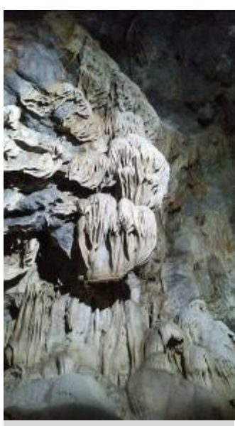
Cave of Lakes

Relatively recently discovered by a shepherd looking for a lost sheep, the Cave of Lakes is a subterranean river