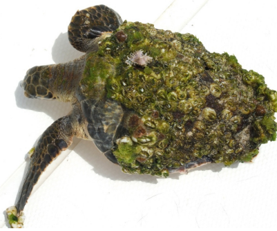
Even Hexaplex has hitched a ride

wounds will bleed heavily and can lead to the death of the animal. Some of the barnacles were of enormous size and deeply embedded in the turtle's shell. Therefore we decided to take the animal back home, wrapped in a wet cloth to protect it from drying out.