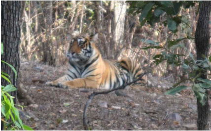
One of the tigers

snacks. However the stars of Ranthambore are the tigers with around 40 estimated to live in the 1330 sqkm park. On our first drive we saw tiger prints in soft sand and on this and the next drive tigers were spotted in zones adjacent to ours. Our third drive proved to be the lucky one as we gained access to a zone where tiger sightings had been consistent over previous days.