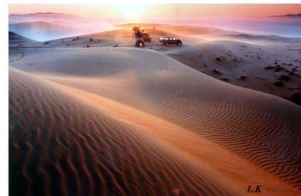
Lamjed's Empty Quarter landscape

The winner of the Earth and Environment: Landscapes/Geology section was Lamjed El-Kefi with his Empty Quarter landscape.