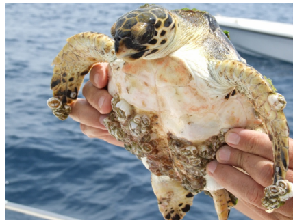
The underbelly of the little hawksbill

Back at the house, we kept it overnight in the bath tub filled with fresh water. I once read that this is the best way to get the barnacles off the shell as they die in fresh water and then eventually fall off. To be sure that this was the right thing to do with a sea creature, I phoned turtle specialist Nancy who confirmed this kind of treatment is safe.