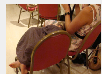
For some, the end-of-season dinner was just too much!