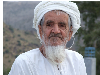
Old man, Jebel Akhdar