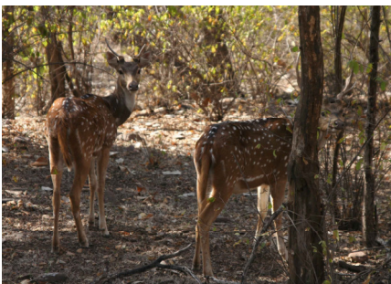
Chittal — also tiger food

Nothing is guaranteed with wildlife watching but after a lengthy drive the guides spotted 2 young tigers lazing in the grass – apparently a brother and sister that had only recently separated from their mother. We spent over an hour watching them rolling around, stretching and yawning and, towards the end of our allotted time, the female made a half hearted attempt at stalking a sambar deer.