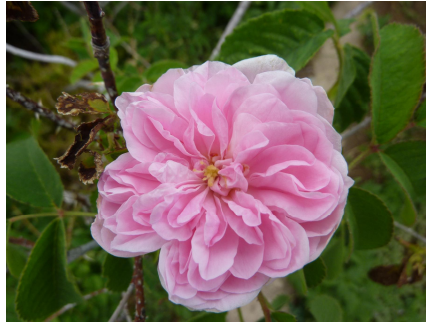
A Jebel Akhdar rose

The local Omani people grow a variety of vegetable and fruits on the terraces. The rose terrace was not in full bloom, but we were pleased to see a few blushing pink flowers. It is amazing that what one would consider to be a delicate bloom can thrive in such a seemingly inhospitable area.