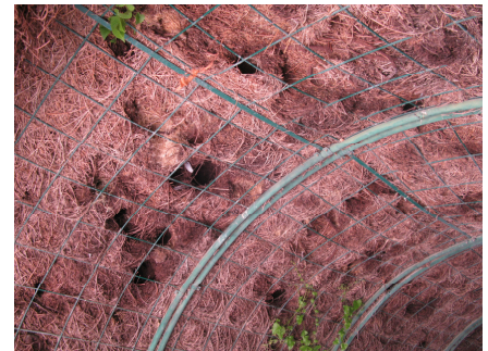
House sparrow nests in the roof of the arbour

Although the house sparrow usually nests colonially (e.g., in trees, bushes or holes in buildings or rocks), the density of nests at the arbor site is exceptional. Report and photographs by Gary Feulner