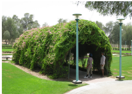
An arbour in Mushrif Park

On an early summer visit to Mushrif Park we made a point to try to inspect different habitats for signs of life. Within the grassy lawns and walkways near the Oasis Garden are two tunnel-like arbours consisting of a metal frame thickly covered by a (still unidentified) pink-flowering climber.