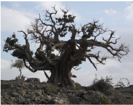
An ancient juniper

On our first trip to the Saiq Plateau in the Jebel Akhdar in April, the Ibri Hotel provided a much needed rest after a full day's work and a long drive. Next day, we found the gradient of the unique mountain road a little intimidating initially, but soon relaxed and stopped on occasions to admire the views.