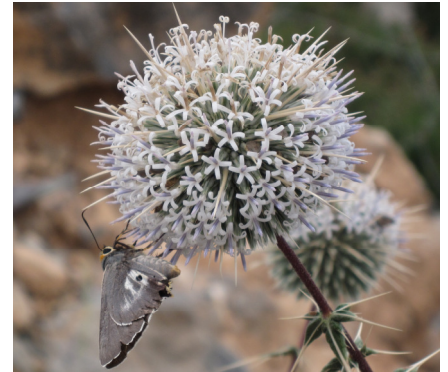
Giant Skipper butterfly ( Coeliades anchises ) feeding on the flowers of Echinops erinaceus

The weekend was just too short, but our drive back to Dubai had one small highlight – it rained for about 30 seconds! Thanks to everyone at the DNHG for the wonderful memory.