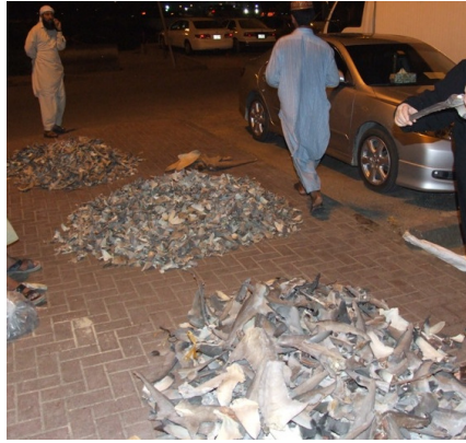
Shark fins destined for the far east

On the floor next to the dead sharks were piles of dried shark fins destined to be traded to the far eastern markets. One shark fin trader told us that one kilo of dried shark fins would get him US$100 on the Hong Kong market. Once the sharks were sold, their fins were chopped off, and the carcasses