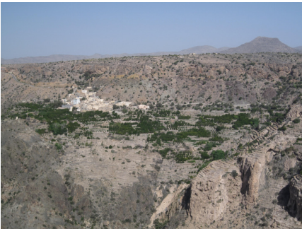
Terraced gardens (View at 400%)

Valerie arranged a wonderful itinerary and our first point of call was at a cluster of small villages which appeared to cling to the sides of a perilous slope. It was remarkable to see how the terraced areas descended the side of the steep rock face – quite a feat of engineering!