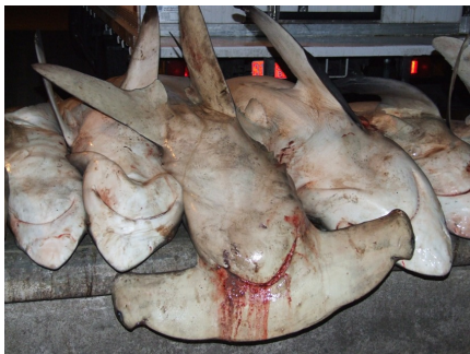
Hammerhead waiting for the fins to be chopped off

We saw so many different types, even hammerhead and leopard sharks. Some of them were of enormous size and we were told that they were caught on the UAE East Coast or Oman. Even baby black tip reef sharks were being sold in large numbers.