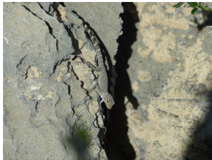
Probably the Dwarf Semaphore Gecko, Pristurus rupestris