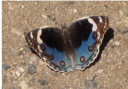
Blue Pansy butterfly, basking

The Jebel Akhdar Hotel is a little haven of quiet tucked away in the cool air of the mountain top. The temperature on the plateau is about 10 degrees cooler than it is 'down below,' so it is pleasant enough to switch off the air conditioner and enjoy fresh air.