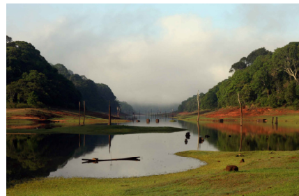
The Periyar reservoir

Then in April, we visited Periyar Wildlife Sanctuary in Kerala, South India. This very popular park is located in the hilly Western Ghats and encompasses a 26 sqkm reservoir created in 1895 - the black stumps of submerged trees are still visible throughout the lake, making an eerie and picturesque sight.