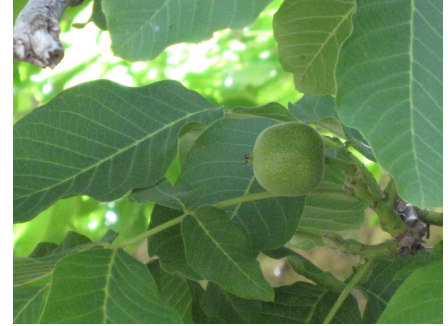
Walnut growing in Wadi Bani Habib

rather different to those we buy in a packet from a supermarket shelf.