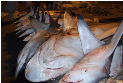
Sharks at the market