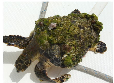
The floating ecosystem