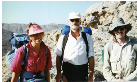
Enjoying a hike, north of Jebel Yibir