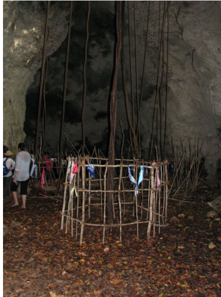
Inside the cave

Humans and Humanity in Africa: Many years ago, two young lovers were looking for a quiet place to be together. They chanced upon an opening in the rock and entered ... Afterwards the young girl threw a stone into the back of the cave. She heard a splash and discovered sweet water. They washed themselves and went home, reporting the cave they had found and the precious water.