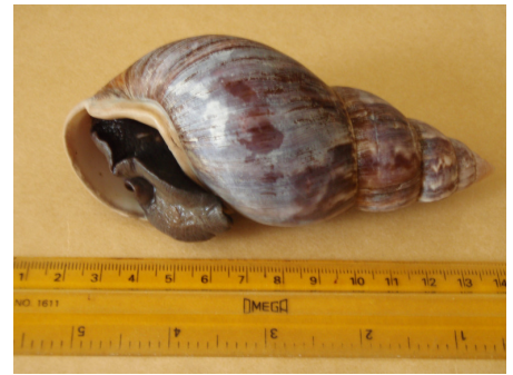
The giant East African land snail Achatina fulica -- reviled by some, lamented by others. Pictured here is the late "Blackie", 12.5cm long

Instead, Sue's photo was instantly recognizable as another type of snail well known to me – a giant East African land snail ( Achatina spp.). I thought at first it must be Achatina fulica , which it closely resembles, and which is the most widespread species in that group. A. fulica is native to East Africa (Kenya, Tanzania, etc.) but is found today in most seasonally wet countries and islands of the Eastern Indian Ocean and the West Pacific, and beyond, including Mauritius, Guam, Tahiti, Hawaii and Brazil. In most instances introduction has been facilitated by man, sometimes inadvertently but most often as an edible food source. In these new environments it has proven to be hardy and prolific and in most places it is now considered an invasive and unwelcome species. A. fulica adults often reach a length of c.12 cm.