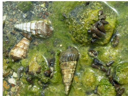
Terebralia palustris – Large mangrove mud creeper (The smaller shells are adult Cerithidea cingulata )

In her inviting report on Zanzibar in the December Gazelle , Sue Hunter mentioned and illustrated a "horribly" large snail observed from the boardwalk among the mangroves there. On reading, I immediately assumed that this would be the large, conical, mangrove mud creeper, Terebralia palustris -- a common mangrove-associated intertidal species in the Indian Ocean, whose range extends into the UAE, where it is known from archaeological sites and as a subfossil along the Arabian Gulf and can still be found alive at Khor Kalba. T. palustris can reach a length of 12cm.