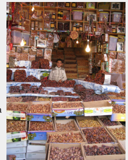
The Date Seller, Sana'a