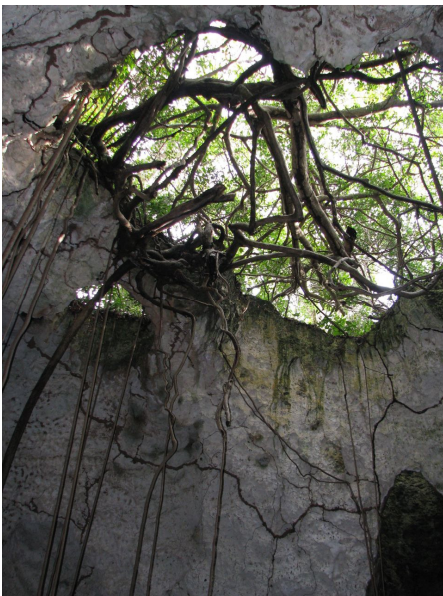
Part of Kuumbi Cave

Kuumbi means 'Great Hall'. It has been the subject of considerable archaeological work in Zanzibar, and human activity there is dated at 20,000 years BC.