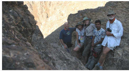
The Hatta hiking team at their high point

The snake was characteristically calm and we got good photos -- but readers should note that this species is reported to be less even-tempered if it is encountered while hunting after dark. (A bite should be treated as potentially life-threatening, and a visit to the hospital for observation and/or antivenin is recommended.)