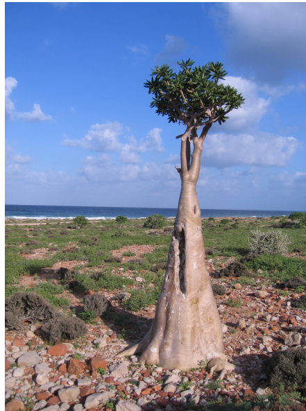
The 'cucumber tree', dendrosicyos socotranum

Our observations and reading about the island emphasized two non-intuitive points, however. First, endemic species are not necessarily rare. Forested Soqotra hillsides are dominated by ranks of the "Bottle Tree" Adenium obesum sokotranum , arrayed like an army of pot-bellied soldiers. Plateau areas are equally dominated by the huge umbrellas of the "Dragon's Blood Tree" Dracaena cinnabari . Both are endemic.