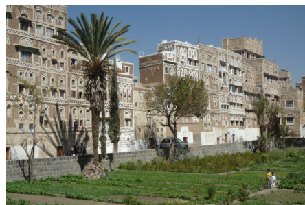
Garden plots in the city