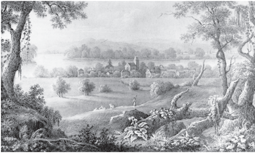
Fig. 2. 'New Harmony'.

social mission in New Lanark was meant to be accomplished with the help of the government 28 or of political parties, his new experiment was insularly located within the society and maintained without the idea of governmental support. Moreover, whereas 'New Lanark' conformed to the interests of the government, 'New Harmony' was designed to break with the existing society. He intended it to constitute the perfect microstructure of the future society, that is, his experiment was meant to be only the beginning of a large-scale extension of his concepts from the insular realm of 'New Harmony' to the whole society. 29 A closer look at the constitution and development of this newly founded community might show how the tension within nineteenth-century society was conceptualized and how it might be understood or even criticized from today's perspective.