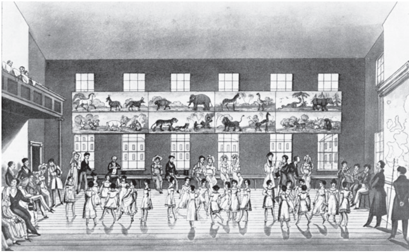
Fig. 1. The School at 'New Lanark'.

cational circumstances, one could 'produce' right-minded and benevolent people. 24 Over the years 'New Lanark' – promoted by Owen in his theoretical essays as a solution to the problems of industrialization 25 – developed into a much-admired model plant, which was visited by many social reformers and even statesmen. Interestingly, it also became a great commercial success. But while his enterprise was still based on the relation 'employer – worker', the former being generous to the latter, Owen's attitude changed step-by-step from that of a liberal reformist to one that was increasingly socialist.