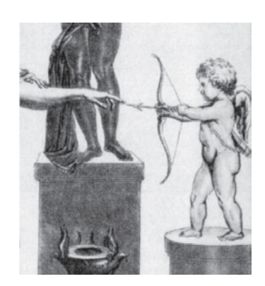
Fig. 4. A. Boissier: Les amants électrisés par l'amour (detail).

Even if the sleight of hand is graphically exposed to the observers, the question remains whether the electric shock actually happens. The image does not disclose whether the finger will make contact with the arrowhead and close the electrical circuit, or whether the hesitant woman - who is not gazing at the arrow but beyond it, seemingly through the wall in the direction of the experimenter - will uncover the sleight of hand before touching the metal arrowhead. This moment of suspense is increased by the title, since it speaks not of an imminent but of an actual electrification. But the Enlightenment image that craves to be enlightened also draws back from the desire for absolute enlightenment. Not the resolution of suspense, but rather its preservation and perpetuation is what corresponds to the aesthetics of Boissier's engraving: the anticipation of an event, and the withholding of its realization in the engraving. The outstretched finger not only points in a direction, but also indicates the intensity and meaning of the image by pointing to a future event.