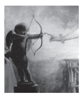
Fig. 3. L.-L. Boilly: L'etincelle électrique (detail).

and are dressed in the fashion of 1800. There is no blending of Greek mythology and modern science in the nocturne. The gender roles are switched, at least in terms of the one who is touching the arrowhead, even though the man uses his right hand to point the woman's arm in the direction of the arrow. She also does not make contact with Cupid's arrow, like the man in Boissier's engraving. Very much in contrast to Les amants électrisés par l'amour, the event which gives the nocturne its title is represented: a small, barely visible spark stretches between her forefinger and the arrow of the statue of Cupid, thereby depicting the technical realization and the moment of electrification (Fig. 3). The act of electrification is not postponed – the anticipation of a future event is not evoked – but rather the surprise, the brief moment of electrification, is made evident in the muscle play of the woman's face. The title corresponds to what is shown, whereas in Boissier's case it is clearly distinct, since the continuance of suspense and not the short moment of surprise is at the centre of Boissier's engraving.