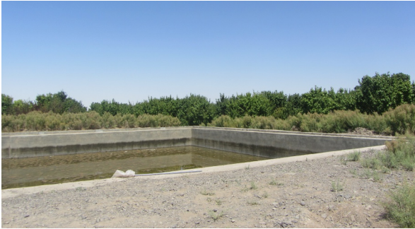
Fig. 3. A reservoir at Meshkat city, Esfahan province (Loc. 2).