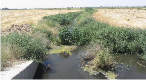
Fig. 11. A concrete canal 3 km south west of Qomrood city, Qom province (Loc. 11).