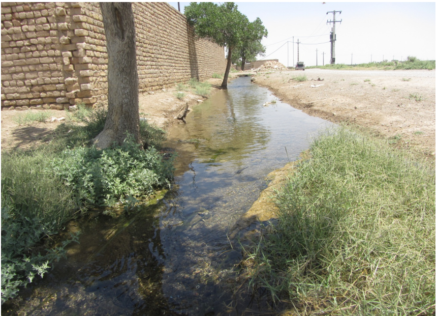
Fig. 12. A shallow canal 2 km north of Qomrood city, Qom province (Loc. 12).