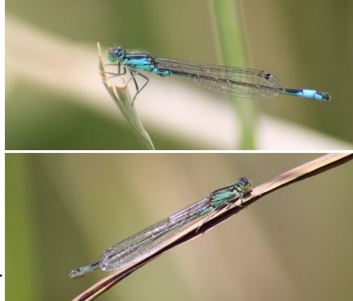
Fig. 16a. Ischnura elegans : male, b. female.

♀ seen, 1 ♀ collected; Loc. 8: Many ♂♂, ♀♀ and several copulae seen, 2 ♂ and 1 ♀ collected; Loc. 9: Several ♂♂, ♀♀ seen, 1 ♂ and 1 ♀ collected, Loc. 13. Many ♂♂, ♀♀ and several copulae seen, 3 ♂ and 1 ♀ Collected; Loc. 15: Several ♂♂, ♀♀, seen, 2 ♂♂ and 1 ♀ collected.