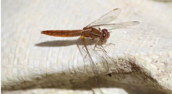
Fig. 17a. male, b. female of Crocothemis erythraea perching on plastic debris.