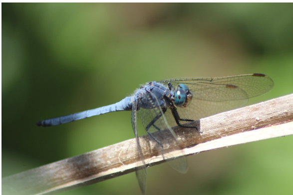
Fig. 18. A male of Orthetrum anceps .