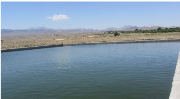
Fig. 5. A reservoir at San San village, Esfahan province (Loc. 4).