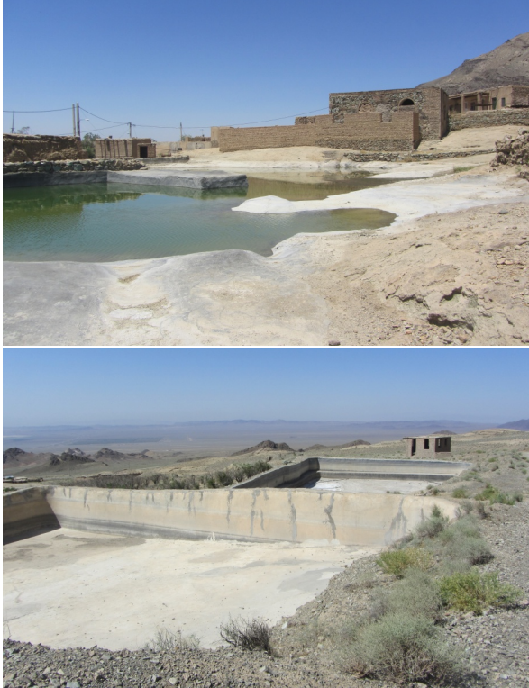
Fig. 15 a. A reservoir at Baghak village, Gom province (Loc. 15). b. Reservoirs in the Baghak village that had dried up.

Loc. 15. Baghak village, 15 km north of Hoz-e-Soltan Lake, 35.140737°N, 50.896738°E, 1,257 m a.s.l., a concrete water reservoir with 770 m 2 area and maximum depth of 3 m, located in the middle of Baghak village, fed by Qanat, bank with gentle slope, with large patches of floating aquatic macrophytes and without riparian vegetation, There were also several smaller reservoirs in the village, all of them dried up (Fig. 15), salinity = .55 (‰).