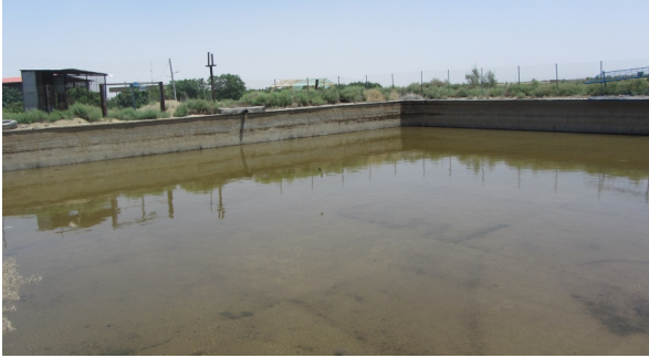
Fig. 2. A reservoir at Khozaq village, Esfahan province (Loc. 1).