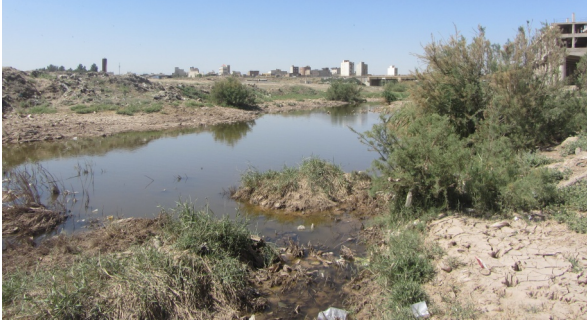
Fig. 10. Backwater section downstream of Qomrood River, beside Qom city, Qom province (Loc. 9).