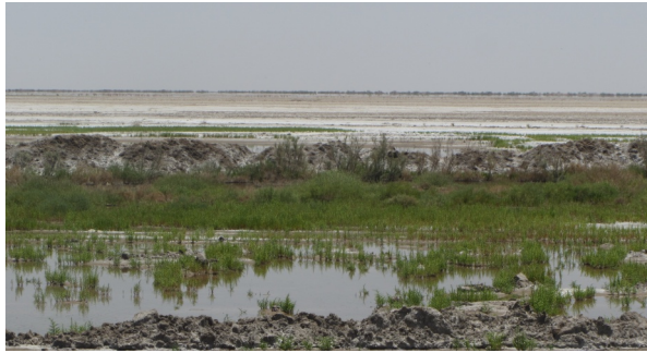
Fig. 13a, b. Marreh wetland, Qom province (Loc. 13).