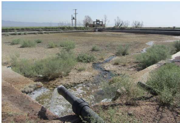
Fig. 14. A reservoir at 30 km north of Qom city, at margin of Hoz-e-Soltan Lake, Qom province (Loc. 14).

Loc. 14. 30 km north of Qom city, at margin of Hoz-e-Soltan Lake, 34.97512°N, 50.858732°E, 818 m a.s.l., a 45 x 35 concrete water reservoir with maximum depth of about 2 m, fed by a well, beside the freeway, surrounded by bare ground (worked farmland), due to reduced water inflow only a small percentage of the reservoir had water, and on the dried bottom Tamarix sp. and Alhagi bushes had grown (Fig. 14), Salinity = 9.9 (‰). Only one specimen, an Orthetrum sp., was observed.