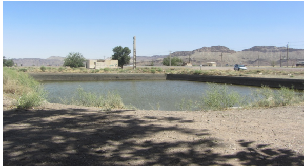
Fig. 8 a. A reservoir at Zanburak village, Qom province (Loc. 7). b. Concrete channels that connect the reservoir of picture (a) to another one.