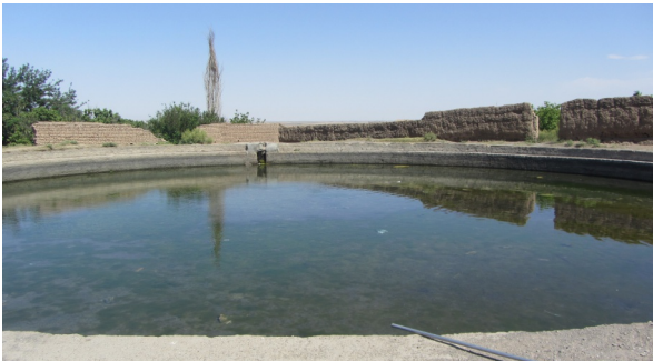
Fig. 4. Main reservoir of Meshkat Qanat, Esfahan province (Loc. 3).