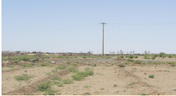
Fig. 6a. Dried farmland around the reservoir, b. A reservoir at San San village, Esfahan province (Loc. 5).