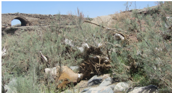
Fig. 9 (a-c). Qomrood River near Tayeghan village, Qom province (Loc. 8).