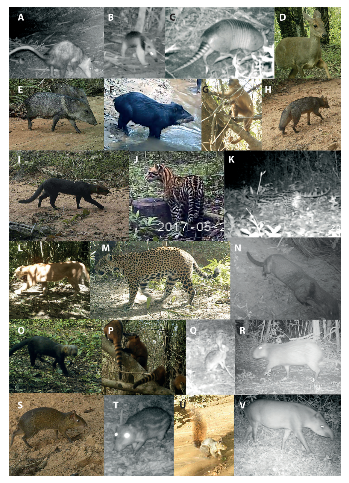
Figure 4. Mammal species detected at Hacienda San Sebastián through a camera trapping survey carried out from March to October 2017. A. Didelphis marsupialis, B. Tamandua tetradactyla, C. Dasypus novemcinctus, D. Mazama gouazoubira, E. Tayassu pecari, F. Pecari tajacu, G. Sapajus apella, H. Cerdocyon thous, I. Herpailurus yagouaroundi, J. Leopardus pardalis, K. Leopardus wiedii, L. Puma concolor, M. Panthera onca, N. Lontra longicaudis, O. Eira barbara, P. Nasua nasua, Q. Sylvilagus brasiliensis, R. Hydrochoerus hydrochaeris, S. Dasyprocta azarae, T. Cuniculus paca, U. Hadrosciurus spadiceus, V. Tapirus terrestris.

primary forest, and border of pastureland to forest. Identification. This is a medium-sized but robust (2–4.5 kg) primate, which is widespread through most of Boliva, although there are uncertain taxonomic differences and