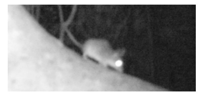
Figure 3. Possible Mouse opossum sp. (aff. Marmosa sp.) detected at Hacienda San Sebastián through a camera trapping survey carried out from March to October 2017.

pastureland, primary forest, and border of pastureland to forest.