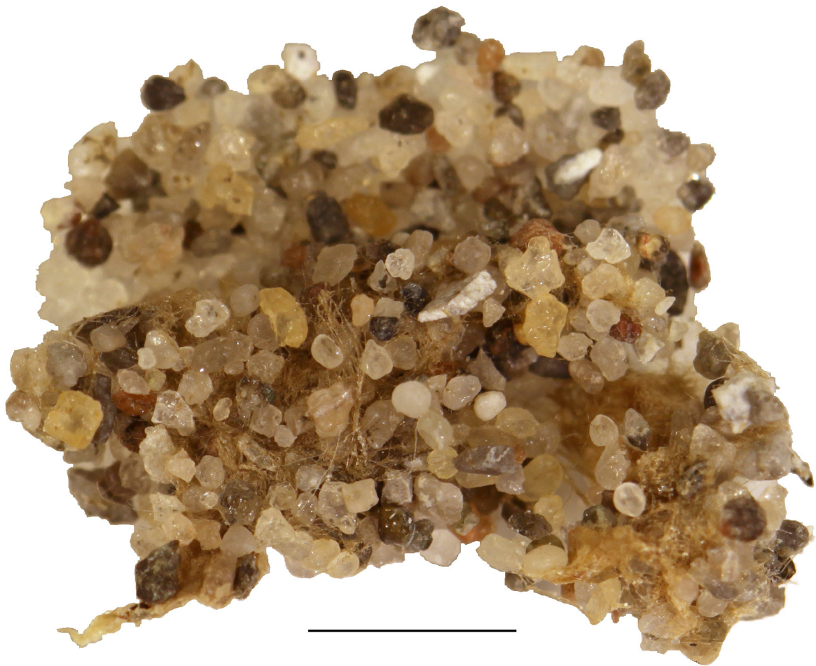
Fig. 2. Modiolus cimbricus sp. nov. A 17.5 mm long specimen in its ball of sand grains. This specimen has been cultured for five years. Scale bar = 5 mm.

A plausible hypothesis is that Modiolus cimbricus sp. nov. has evolved into a separate species after the Weichselian glaciation. It closely resembles M. adriaticus , from which it has evolved. The latter species belongs to the Lusitanian (Mediterranean) fauna that today has its northern border on the south and west coasts of the British Isles, including the Irish Sea (Ekman 1953; Hylleberg & Riis-Vestergaard 1984) (Fig. 3). This fauna is characterized by its corresponding Mediterranean-influenced water masses from the south. Today, a branch of the Gulf Stream presses towards the northwestern parts of the British Isles and the North Sea. It fills the latter with its water and results in a very stable current pattern because it is determined by sufficient water depth that allows for three amphidromic points in the North Sea (Dietrich 1963; Jelgersma 1979; Lund-Hansen et al. 1994; see also below). Consequently, the edge