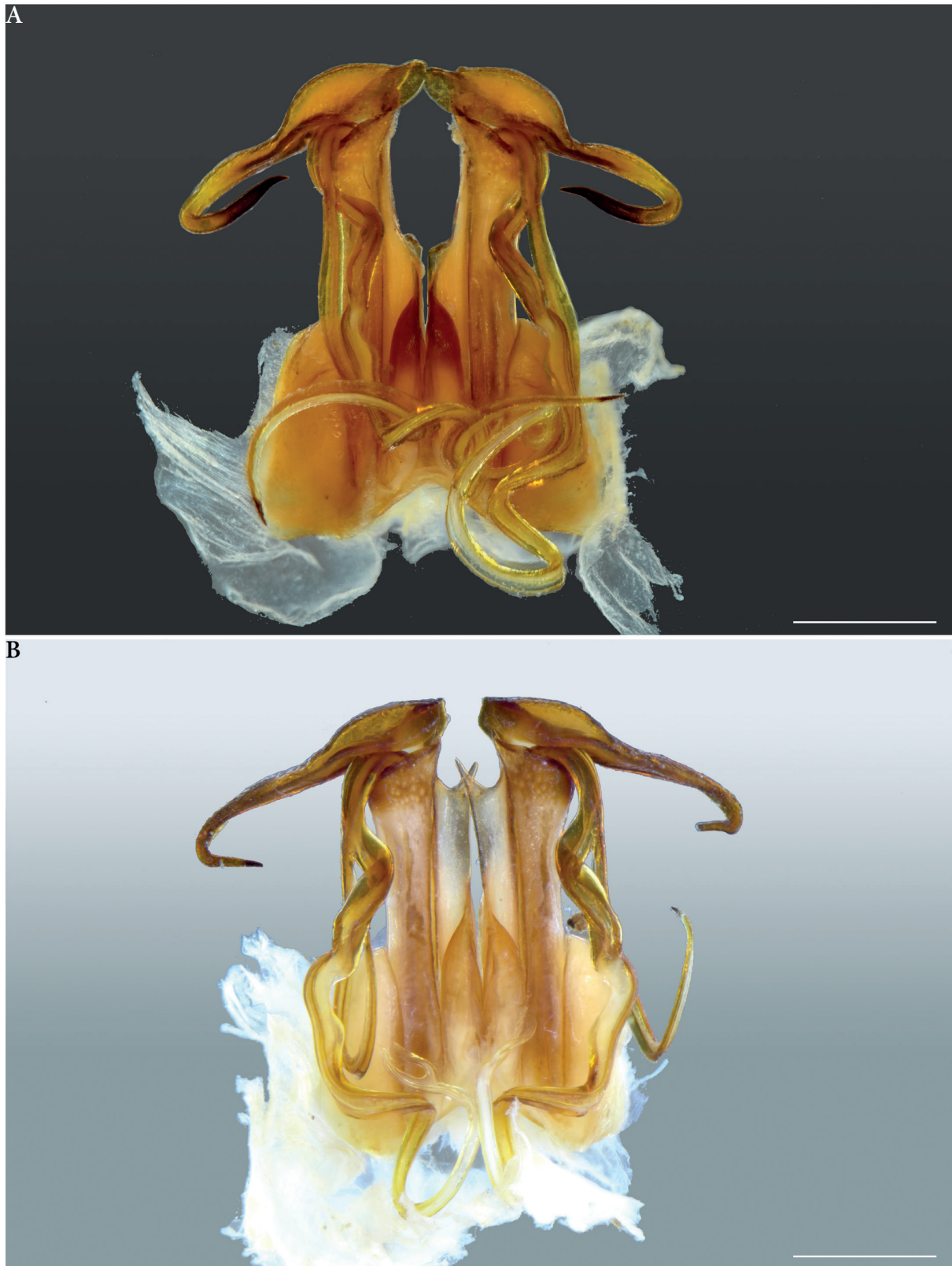
Fig. 5. Attemsostreptus reflexus , males without locality data. A. ♂, (NHMD621669). B. ♂, deviating gonopods (HNHM diplo-1697). Scale bar: 1 mm.