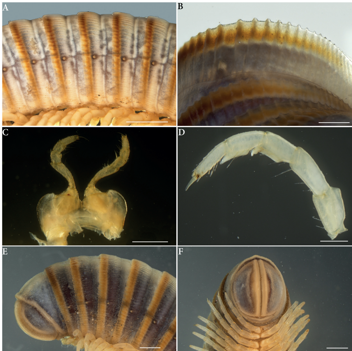
Fig. 3. Attemsostreptus reflexus sp. nov., external structures. A. Midbody rings in lateral view, telson towards the left, female paratype. B. Limbus, male holotype (NHMD607065). C. First pair of legs, male holotype (NHMD607065). D. Midbody leg with soft pads, male holotype (NHMD607065). E. Posteriormost body rings and telson in lateral view, female paratype. F. Posteriormost body rings and telson in ventral view, female paratype. Scale bar: 1 mm.

TANZANIA • 1 ♂, missing posterior part, dissected; Morogoro Reg., Morogoro Distr., Kimboza Forest Reserve; 37°48' E, 07°01' S; Jan.–Mar. 1994; Frontier Tanzania leg.; NHMD607065.