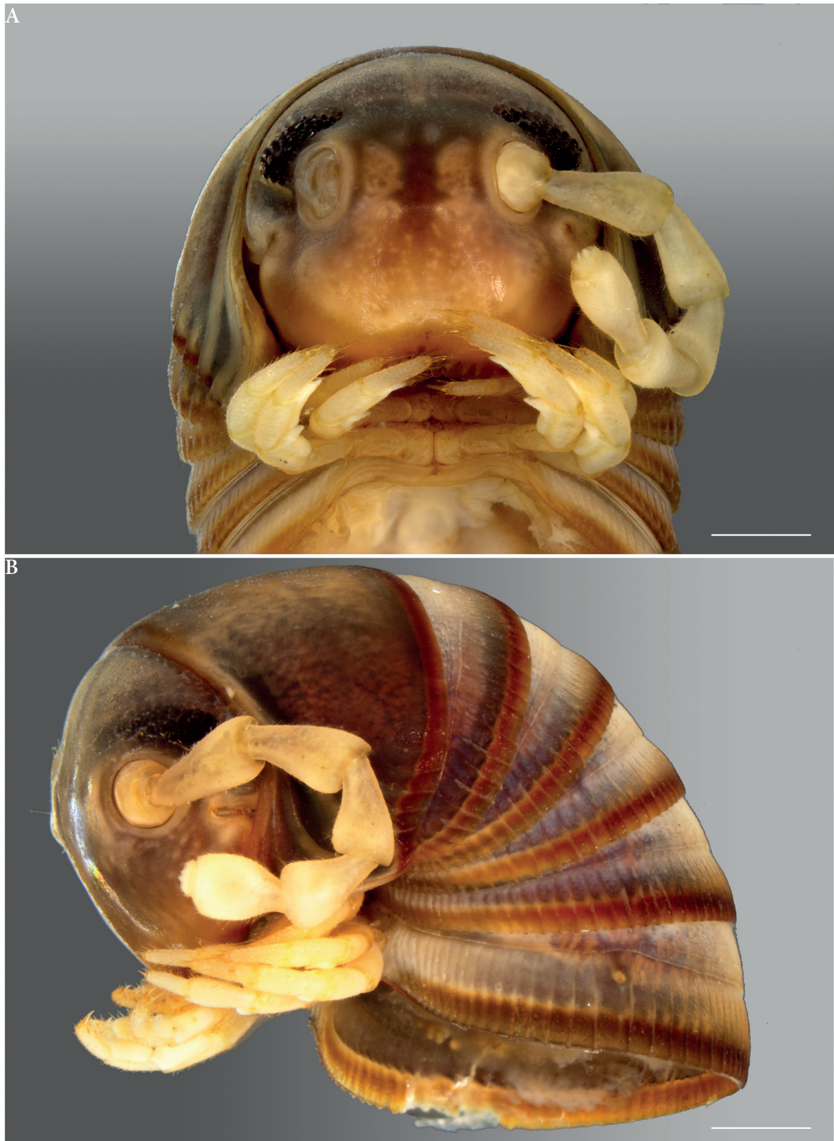
Fig. 2. Attemsostreptus reflexus sp. nov., male holotype (NHMD607065), head and anteriormost body rings. A. Ventral view. B. Lateral view. Scale bar: 1 mm.