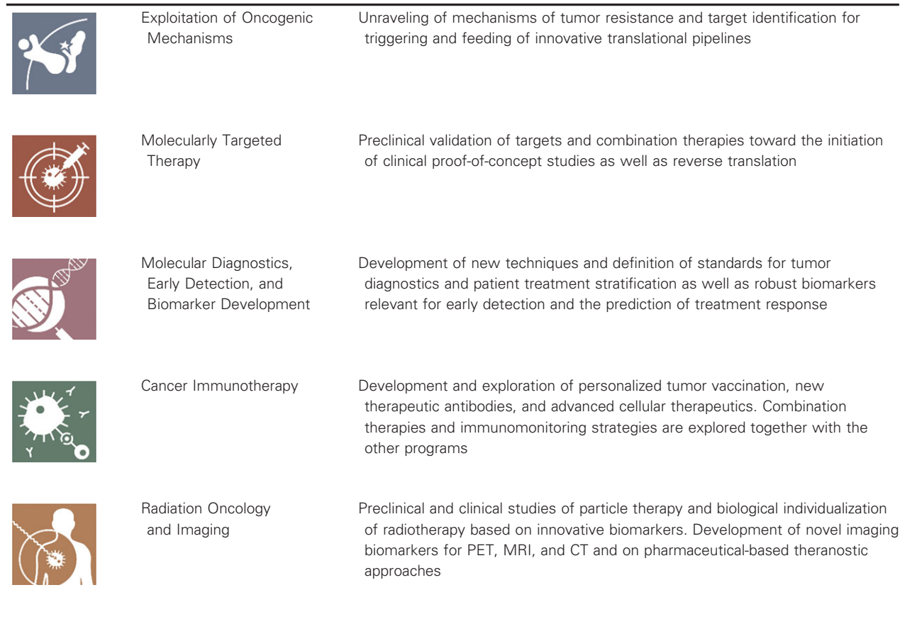
Table 1. The DKTK's translational research programs.

CCP bridgehead structure is rolled out to non-DKTK CCCs sponsored by the Deutsche Krebshilfe (German Cancer Aid) within their Comprehensive Cancer Center of Excellence program (which also includes all DKTK partner sites).