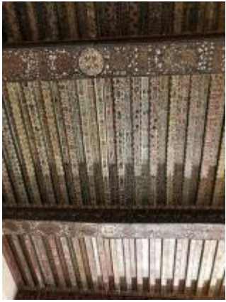
The intricate and exquisite interior of Jabreen Castle in Oman, by Alexis Biller. (Dates gathered from the date plantation [3rd pic], were pressed in this room [4th pic] to extract the honey)