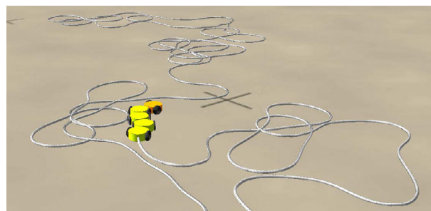
Figure 4: A train consisting of elastically coupled cars. The attractor resulting from a projection to a reduced phase space is manifestly not a limit cycle.