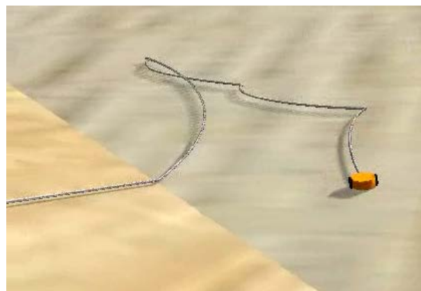
Figure 3: The simulated two-neuron two-wheel robot crosses from one inclined plane to another, with the silver line representing the past track. The observed motion is fully self-organized.

Fierro, R. and Lewis, F. L. (1998). Control of a nonholonomic mobile robot using neural networks. IEEE Transactions on neural networks , 9(4):589–600.