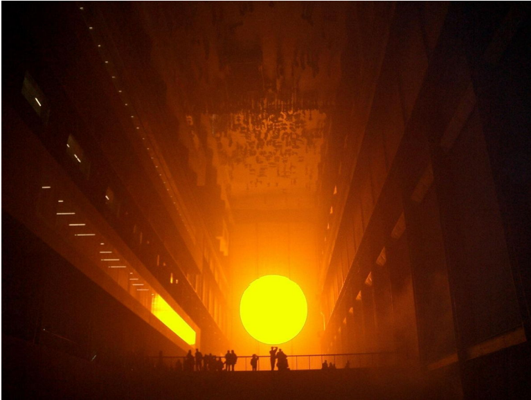
Figure 8. '[S]o much of the sky seemed set on fire | by the flaming sun' ( Paradiso I, 79–80). Olafur Eliasson, The Weather Project , 16 October 2003 – 21 March 2004, Turbine Hall, Tate Modern, London.