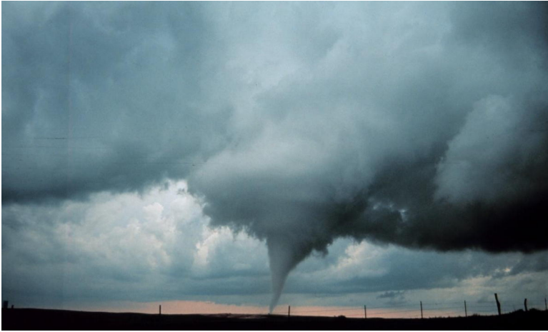
Figure 1. ‘The hellish storm, which never rests...’ ( Inferno v, 31). Project VORTEX-99, Occluded Mesocyclone Tornado , 3 May 1999, Anadarko, Oklahoma.

Their punishment is an early example of an important structuring principle of Dante’s afterlife — called contrapasso in Inferno xxviii, 142 — whereby the form of the punishments in Hell and Purgatory fits, by analogy or contrast, the sin that has been committed on Earth. Thus, as the lustful were buffeted by the passions in life, in Hell a real wind now ‘sweeps [the] spirits in its headlong rush, | tormenting, whirls and strikes them’ ( Inferno v, 32–33); ‘propel[s] the wicked spirits. | Here and there, down and up, it drives them’ (42–43). The storm carries them away in a manner that matches the lack of control over their desire on Earth. Among the yells, cries, and laments, the lustful are also heard swearing against the action of the elements and the divine power that regulates them (35–36), manifesting that hatred is the only form of protest available to them against the punishment that afflicts them. 12