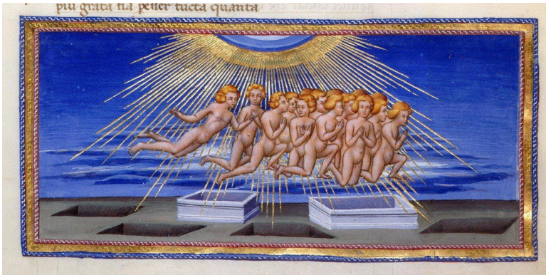
Figure 7. 'Nor will such shining have the power to harm us' ( Paradiso xiv, 58). Detail of a miniature by Giovanni di Paolo, Paradiso xiv, 1440s, MS Yates Thompson 36, f. 154, The British Library, London.

with exploration and wandering a while longer, before their leap to Heaven. Given this portrayal of Eden, one might expect the garden to be an anticipation of what Heaven might look like — a place of imperturbable bliss and enjoyment, free from the distraction and pain of the elements' most adverse effects. However, Dante's representation of Heaven overturns this comforting expectation. In Paradiso the weather is not controlled or sublimated but, on the contrary, its intensity is dialled up. The weather of the canticle does not feature precipitations, supernatural phenomena, freezing temperatures, or earthquakes but is dominated instead by a relentless atmospheric condition of extreme light and heat — we call this the heavenly ' canicule ' after the heatwave that hit the planet in the Summer of 2019, as we were beginning to write this paper in France.