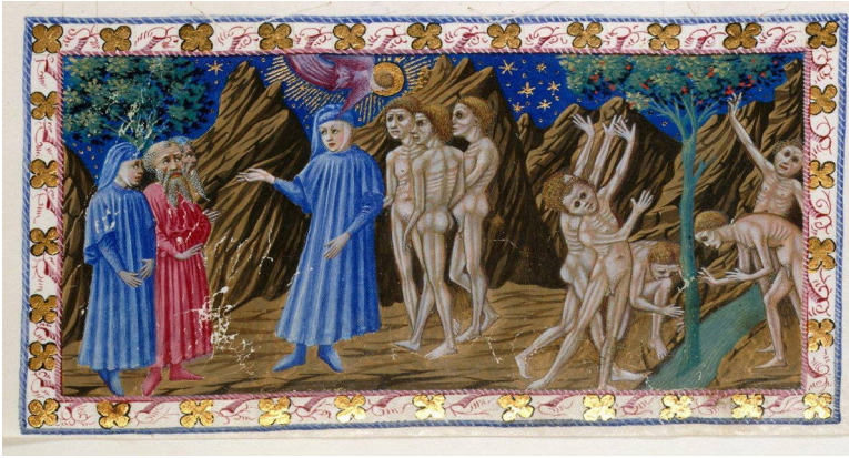
Figure 6. ‘The sockets of their eyes resembled rings | without their gems’: the emaciated gluttons ( Purgatorio xxiii, 31–32). Detail of a miniature by Priamo della Quercia, Purgatorio xxiii, 1440s, MS Yates Thompson 36, f. 107, The British Library, London.

environment is idyllic in all other respects. Yet, in their purgation, these souls are worn to their bare bones: emaciated, their eyes hollow, their face pale, their skinned stretch out over their bones (Figure 6):