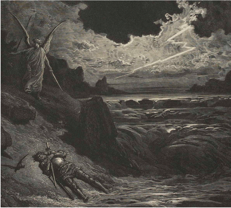
Figure 5. Buonconte's dispossessed body: 'the blood-red Archiano found | my frozen corpse and swept it down the Arno' ( Purgatorio v, 124–25).

Gustave Doré, Purgatorio v, 1868, wood engraving.