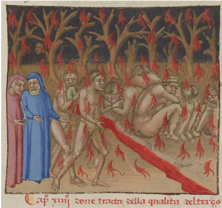
Figure 3. '[I]n slow descent, | broad flakes of fire showered down' tormenting the violent ( Inferno xiv, 28–29). Detail of a miniature by Bartolomeo di Fruosino, Inferno xiv, 14th century, MS It. 74, f. 42, Bibliothèque Nationale de France, Paris.

fire showered down | as snow falls in the hills on windless days' ( Inferno xiv, 28–30) (Figure 3).