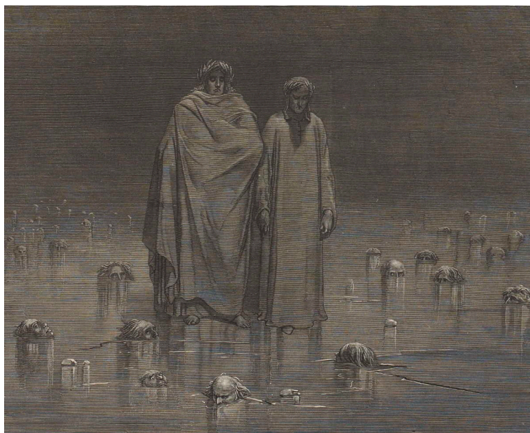
Figure 4. 'I saw a thousand faces purple | with the cold': the traitors frozen in Lake Cocytus ( Inferno xxxii, 70–71). Gustave Doré, Inferno xxxii, 1861, wood engraving.

expressly consists, not in gradually wearing down or consuming, but in congealing into a fixed state. The Commedia takes ice as the ultimate symbol of infernal subjectivity: 20 exposed to the punishment tormenting their body without spiritually softening their soul, the damned are petrified, trapped in their sin, and unable to change or improve. 21