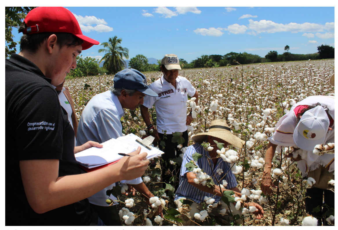
PICTURE 4: Project – Strengthening the cotton sector, alliance with FAO in Aipe, Huila