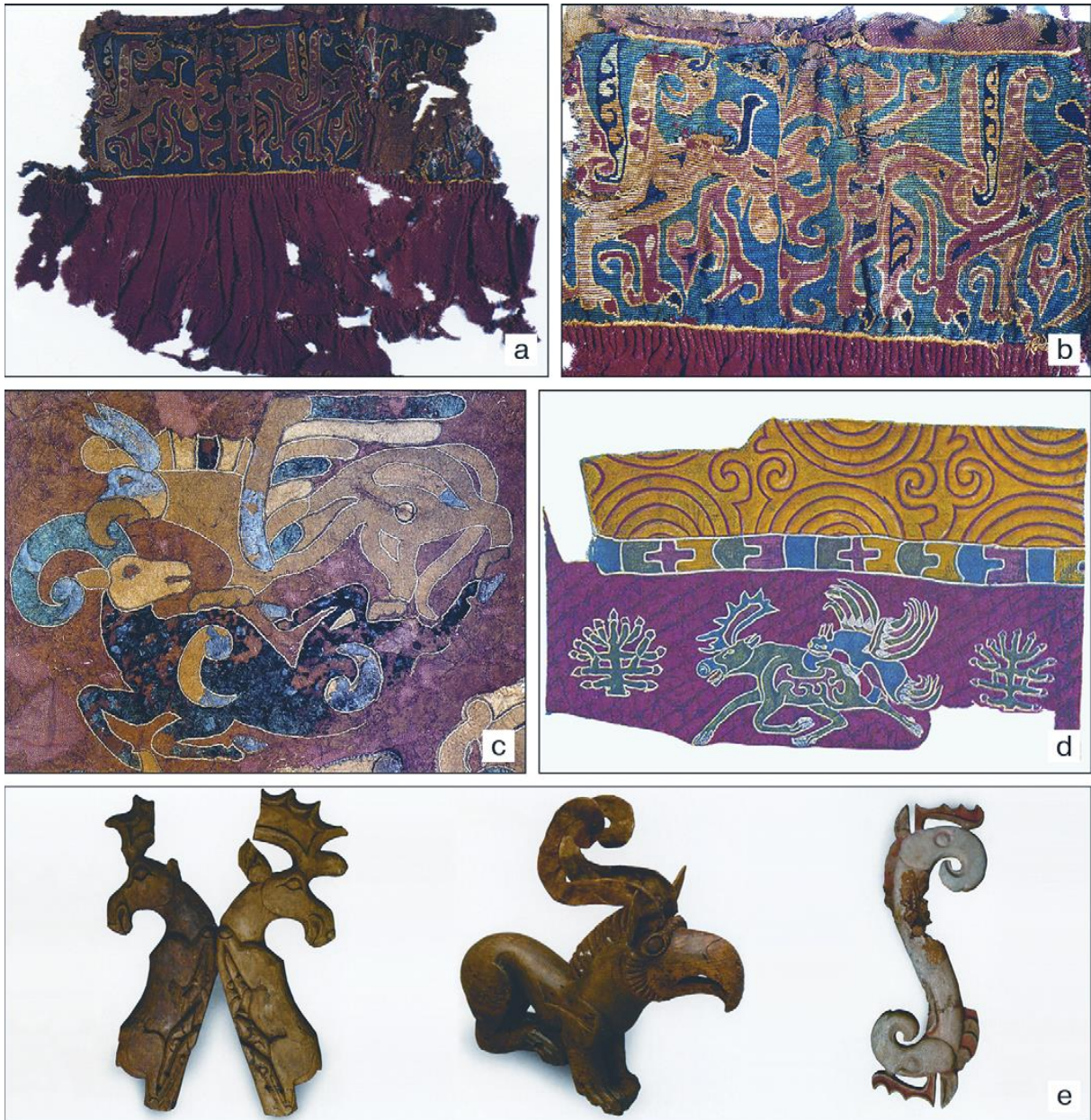
(1072) Figure 3. a) Sampula tomb 84LS I M01:326, skirt; b) detail of tapestry band with animal combat (Sampula 2001: 214, Figures 409, 409-11); c) Pazyryk kurgan 1, felt saddlecloth with appliques (Schiltz 1994: 358, Figure 259); d) Noin-Ula kurgan 6, detail of embroidery on felt carpet, colour reconstruction (Académie des Science de L'URSS et Musée de L'Ermitage 1937); e) Berel' kurgan 11, horse harness in the shape of two elks, griffin, cheekpiece with griffin heads (Samašev 2007a: 135, Figure 5; 137, Figure 9; 139, Figure 13).