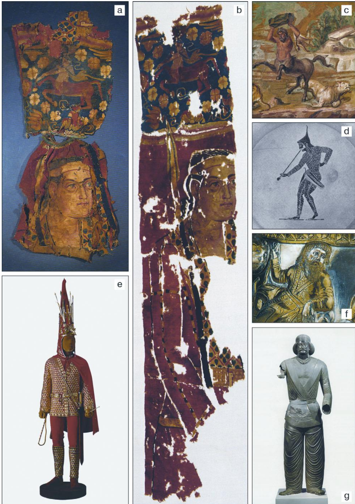
(1067) Figure 2. a) Sampula tomb 84LS I M01:c162, lower legs of a pair of trousers; b) condition of the trousers after all the pleated parts were dismantled and the different textile patches were re-adjusted (a & b courtesy of the Museum Xinjiang); c) Villa Hadriana, Tivoli, centaurs fighting with predatory cats (Staatliche Museen zu Berlin