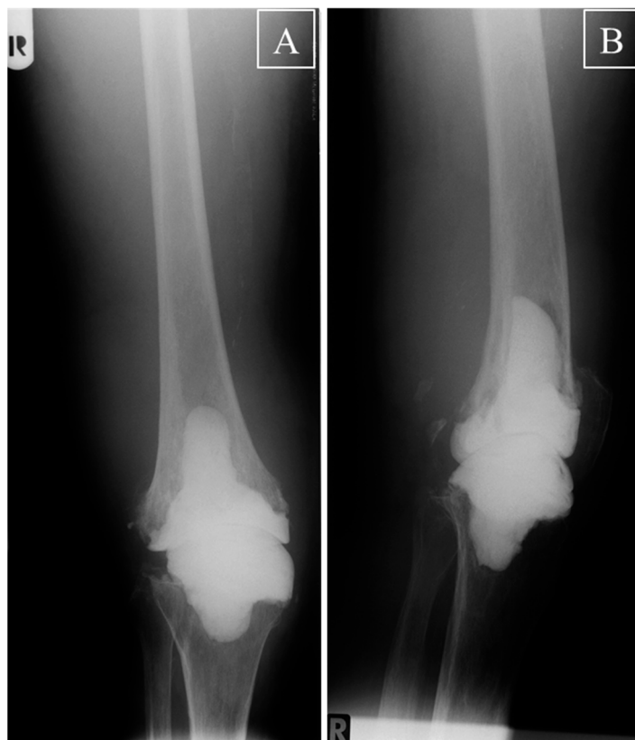
Figure 2. Knee X-ray before re-implantation. (A) Anterior to posterior and (B) lateral X-ray of a right knee with the inverse spacer of one representative patient before re-implantation TKA. A perfect fit of the two different spacer components into the tibial and femoral medulla was observed, without any signs of dislocation, subluxation, fractures of spacer or bone, or increased gross abrasion of bone in the joint area; R = right.

re-implantation also did not show any indications for dislocation, subluxation, fractures of spacer or bone, or increased gross abrasion of bone in the joint area in any patient (Figure 2A,B), resulting in a calculated Kaplan–Maier failure rate of zero for the spacers.