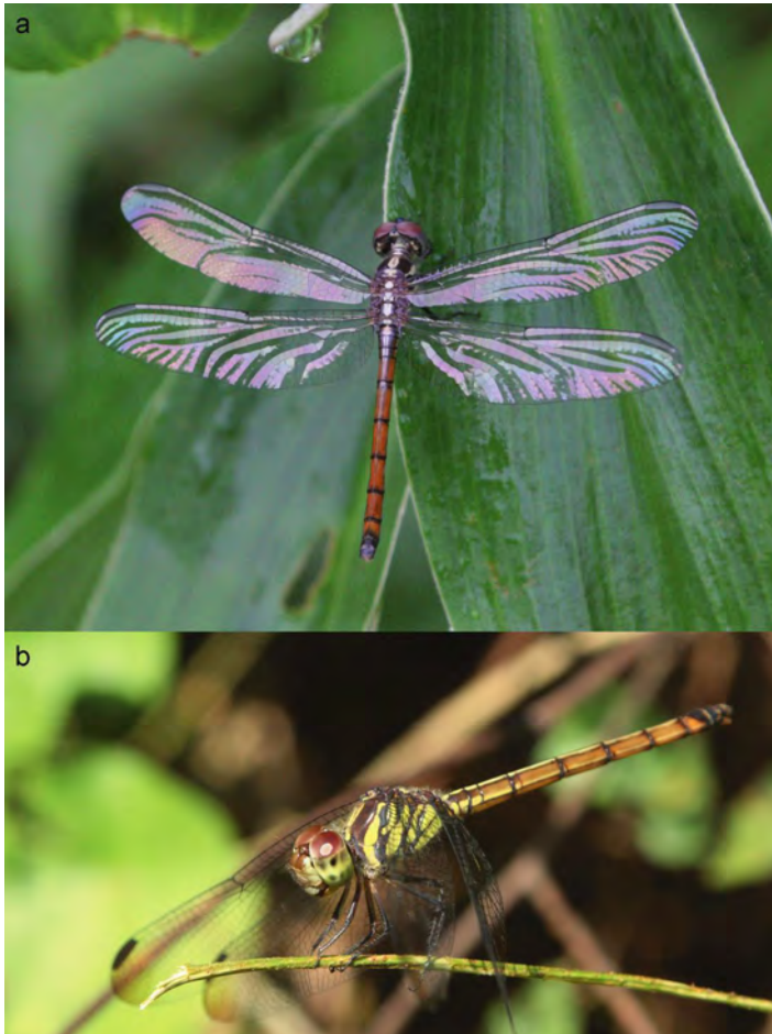
Figure 8. Females of Lathrecista asiatica : a – a general one at a long pool at S margin of Phneak Roleuk village, 21.06.2018 (Loc. 4); b – at the Spong River in Spong village (Loc. 8), 8.12.-2019.

also some abundant hydrophyte with whorls of filiform pinnate leaves. Only at the bank with the road there were small areas of open water ( from knee to chest deep). The water was full of small fish. The banks were margined with walls of lush vegetation with participation of Ligodium winding fern. There were small bays, most probably with small brooks entering.