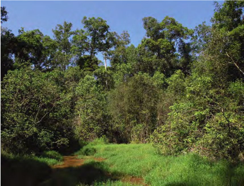
Figure 19. A narrow open grassy swamp at Cheum Takong swamped forest (Loc. 9), 5-6.12.2019.

open area (at which we camped), crossed by an old road, occupied by a swamp with stagnant, turbid water filled with inundated fine grass (Fig. 19), 13.324-325 N, 105.605-606 E, 132 m a.s.l. It was similar to Cheum Thom (Loc. 6) but manifold smaller. Expectedly there were more Odonata there. Damselflies were represented by a male of Ceragrion indochinense (collected), a male of A. pallidum (collected), while net sweeping in grass provided three specimens (collected) of Agriocnemis , all of different species: males of A. pygmaea and A. minima and a female of A. nana . Dragonflies were represented by several N. fluctuans (immature with pale wings and mature with saturated wings), 2 males of B. farinosa , an immature male of N. intermedia atalanta , a male of Nannophya pygmaea (both collected) and a soaring male of P. flavescens . Also the guide captured a male of Nesoxenia lineata at its maiden flight.