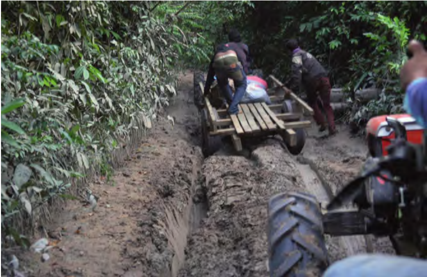
Figure 2. On the way to Spong village through Prey Long Forest on Chinese tractors, 4.12.2019.

result, on 21.06.2018 I had to examine the recently logged area around Phneak Roleuk and at some sites to the west along Road 215 to Chey Saen village. We were advised to get to Spong in a dry season, not so suitable for an Odonata faunal study. We nevertheless followed this advice and in December 2019 managed to get (Fig. 2) to Spong, from where local guides brought me by a motorbike to Cheum Takong ever-green forest swamp, which was my main target and where I spent two days.