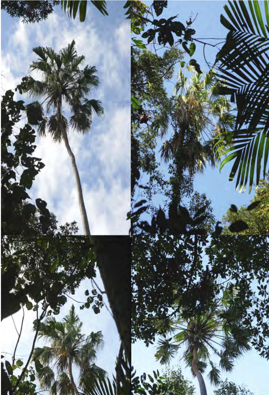
Figure 15. Livistona sp., a conspicuous flagship tree of Cheum Takong forest swamp., 5.12.2019.