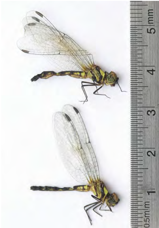
Figure 20. Teneral female specimens of Tetrathemis ?flavescens from Cheum Takong swamped forest (Loc. 9), 5.12.2019.