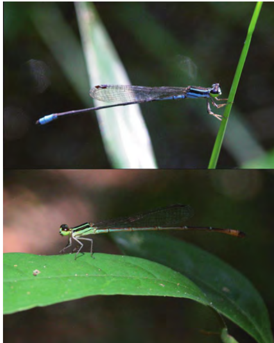
Figure 18. A male (above) and female (below) of Argio-cnemis rubescens rubeola at a larger pool (Fig. 17) in Cheum Takong forest swamp (Loc. 9), 5.12.2019.