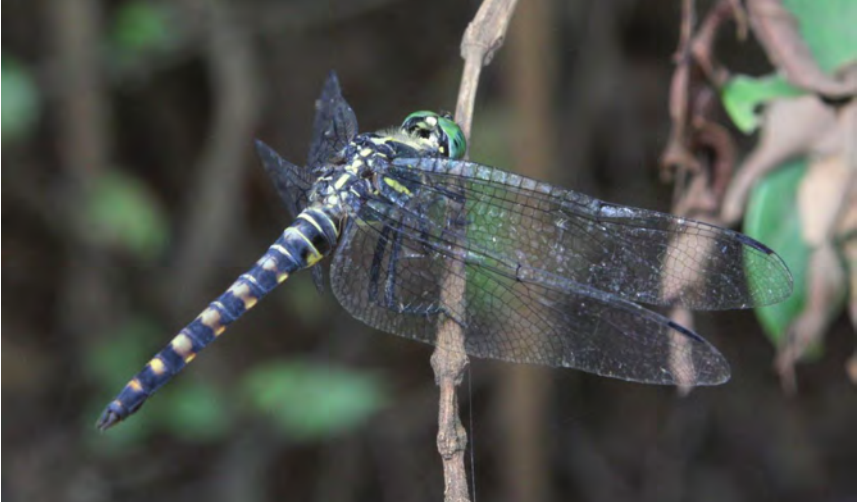
Figure 9. A male of Onychothemis testacea at the river 3 km SE of Phneak Roleuk village, 21.06.2018 (Loc. 5; Fig. 2).