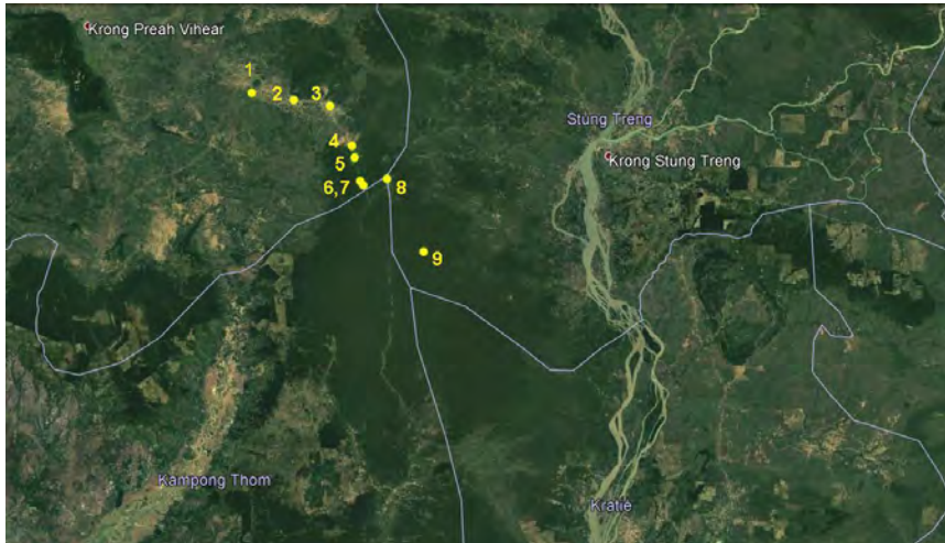
Figure 1. A Google Earth view on Prey Long Forest, with localities studied (Loc.1 – 9; see the text) indicated.

that as soon as a road appears the forest is gone. Before the absence of roads, Prey Long remained totally unexplored scientifically until very recently. Actually it was discovered for science by J. Andrew McDonald (2004) who issued a report 'Ecological Survey of Prey Long, Kampong Thom; a Proposal for the Conservation of Indochina's Last Undisturbed Lowland Rainforests' based on the results of his expedition to Prey Long in 2004. In particular, he discovered and for the first time described the previously unknown peculiar evergreen swamp forest type of the Cambodian Lowland, examined by him at the Cheum Takong forest swamp.