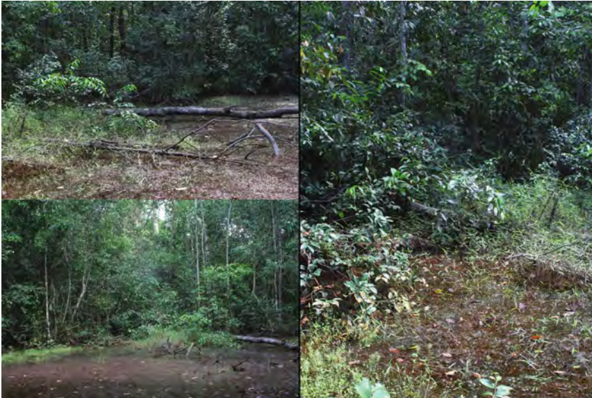
Figure 17. A larger pool in Cheum Takong forest swamp (Loc. 9), 5-6.12.2019.