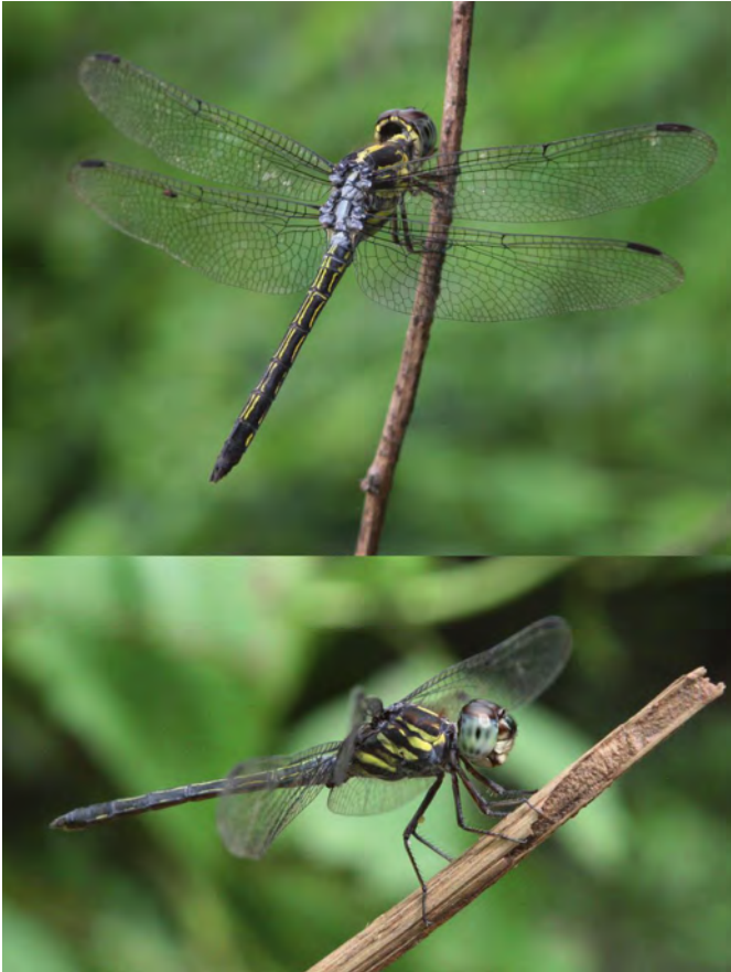
Figure 7. A male of Cratilla lineata calverti at forest remnants at S margin of Phneak Roleuk village, 21.06.2018 (Loc. 4).

through a series of pools. Here four males of each Archibasis viola and Pseudocoptera ciliata were found (1 of P. ciliata collected). At several shallow pools with surprisingly firm bottom Agriocnemis was at last found, 2 males and 2 females of A. minima (collected) and 1 male of A. nana . A small rivulet flows from the bog, crosses the road and proceeds in a shady valley. At its temporarily dried out arm, with wet bottom, I encountered the only individual of Vestalis gracilis (although expected more) and a female of Heliocypha biforata (collected).