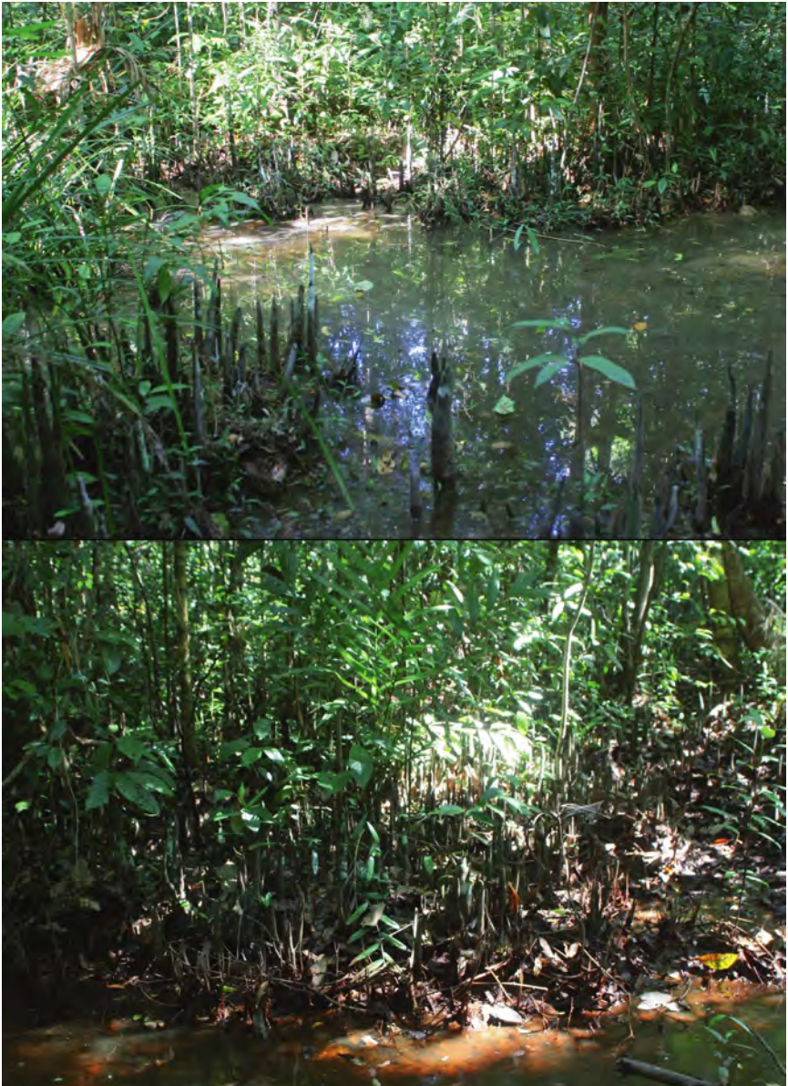
Figure 14. Pneumatophores at pools in Cheum Takong forest swamp (Loc. 9), 5.12.2019.

The studied area of the swamped forest can be labelled as follows: Stung Treng Province, 15-16 km SE of Spong village, Cheum Takong swamped forest, 13.324-