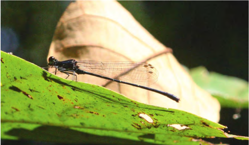
Figure 16. A male of Onychargia atrocyana in Cheum Takong forest swamp (Loc. 9), 5.12.2019.

The Cheum Takong interior was poor in Odonata, in spite of the abundance of water even in the dry season (the locals say there is a similar amount of water in the rainy season as well), most probably because of too scarce sunlight. The place looked as if specially created for Copera vittata and I did find them, but only 3 males (1 collected) and 1 immature (ghost stage) female (collected) during two days. The most frequent, although still scarce, damselfly was Onychargia atrocyana (Fig. 16), of which I found 8 males (3 collected) and 1 female (collected). Curiously, five of those males were found in one place, at adjacent branches and fronds in a considerable spot of sunshine. I also found a male and a female of Archibasis viola . Only three dragonfly species were found inside Choum Takong, all being libellulids preferring shady forest pools: a male of O. chrysis , a male of Brachygonia oculata and, between 2 and 3 p.m. on 5.12.2019, two teneral (on maiden flight)