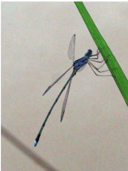
Figure 4. A male of Lestes elatus at a long roadside pool at S margin of Phneak Roleuk village, 21.06.2018 (Loc. 4).