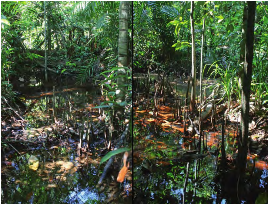
Figure 13. Pneumatophores at pools in Cheum Takong forest swamp (Loc. 9), 5.12.2019.