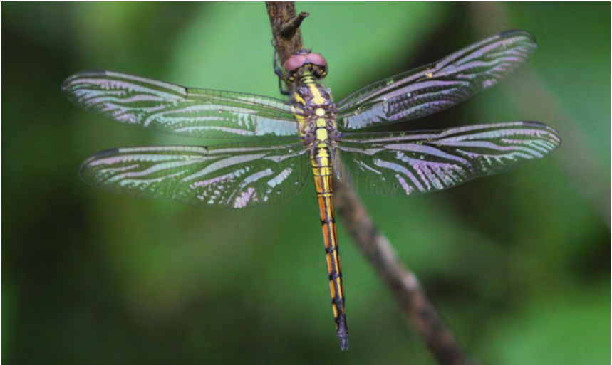
Figure 10. A feneral male of Potamarcha congener at a long pool at S margin of Phneak Roleuk village, 21.06.2018 (Loc. 4).

and ecosystem, the interface of which sequesters a number of highly specialized aquatic trees and shrubs. Upper-story trees of Boeng Pes include stieng ( Archyteaea sp.; a rare species with close relatives in New Caledonia), pa-ong ( Calophyllum saigonense Pierre), pdieck ( Anisoptera costata Korth.), smach ( Melaleuca