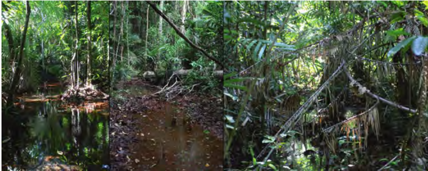
Figure 12. Interior of Cheum Takong forest swamp (Loc. 9), 5.12.2019.