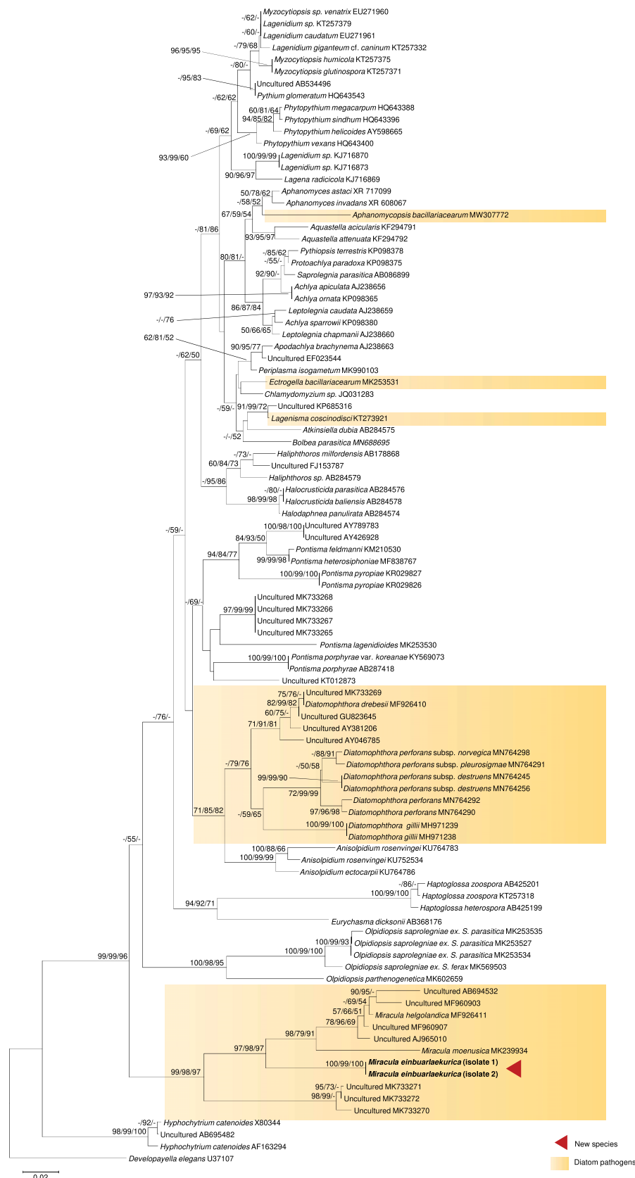
Figure 2. Molecular phylogeny based on minimum evolution analysis inferred of partial nrSSU (18S) sequences. Numbers on branches denote bootstrap values from maximum likelihood, minimum evolution, and Bayesian analyses, in the respective order. A dash “-” indicates less than 50% bootstrap support for the presented topology in ML and MN, and less than 0.9 posterior probability in BA, for the present or a conflicting topology.

same server was also used for Maximum Likelihood inference using standard settings with 1000 bootstrap replicates. Bayesian inference was done there