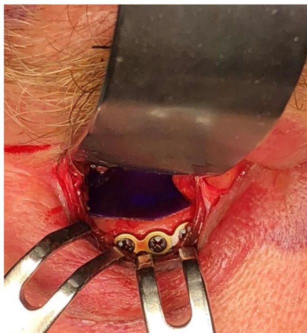
Fig. 2 0.15 mm Poly-p-dioxanon (PDS ® ) in situ

There is a still a controversy about which material is suited best for orbital floor reconstruction regarding the post-operative outcome. In 2003, Ellis and Tan were the first to show that titanium meshes are more accurate in orbital reconstruction compared to bone grafts [24]. Other retrospective studies supported their results [25, 26]. Later Ellis and Messo estimated that titanium meshes are better suited to reconstruct the orbit compared to alloplastic materials, such as Teflon ® or PDS ® membranes, due to their incomplete degradation process which can result in sterile inflammation and development of granulomas [27]. On the other hand, it has been reported that titanium meshes cause inflammatory reactions [28] as well and are associated with significantly more post-operative complications, such as infections, extrusion and residual diplopia [29]. In 2002, Baumann et al. concluded that