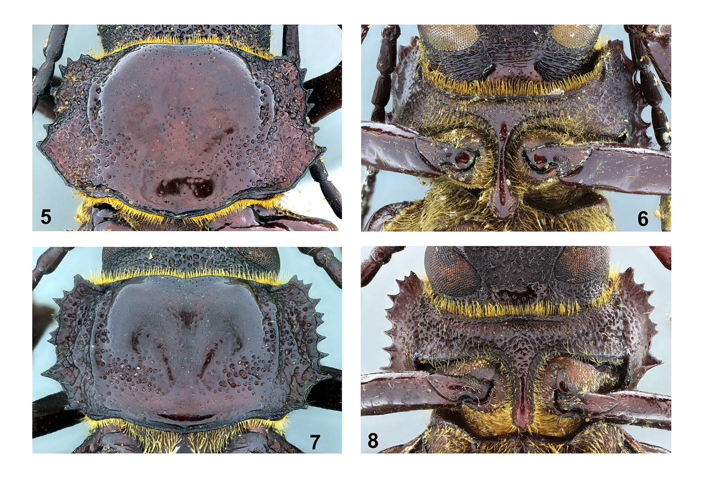
Figures 5–8. Allomallodon spp. 5–6) Allomallodon hermaphroditus, female. 5) Pronotum. 6) Prothorax, ventral view. 7–8) Allomallodon popelairei, female. 7) Pronotum. 8) Prothorax, ventral view.