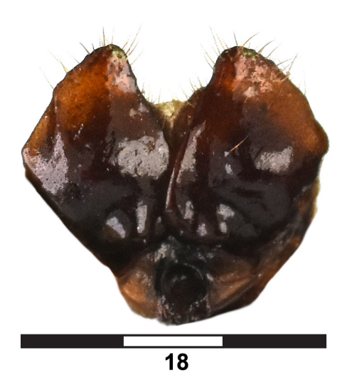
Figure 18. Chrysina porioni female inferior genital plates, scale in mm.

metallic golden color morph (Fig. 3–4). One of the fifteen golden males has a very bright red venter and anterior half of the clypeus, and the legs have a paler reddish tint.