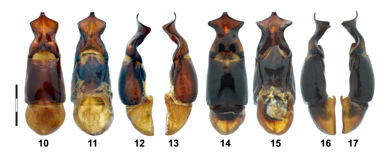
Figures 10–17. Chrysina porioni and C. ericsmithi male genital capsules, scale in mm. 10) C. porioni dorsal view. 11) C. porioni ventral view. 12) C. porioni right lateral view. 13) C. porioni left lateral view. 14) C. ericsmithi dorsal view. 15) C. ericsmithi ventral view. 16) C. ericsmithi right lateral view. 17) C. ericsmithi left lateral view.