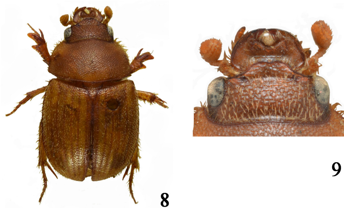
Figures 8–9. Ochodaeus cychramoides Reitter, 1892, syntype. 8) Habitus. 9) Head.

Italian distribution. Piedmont (Reitter 1892, as Ochodaeus cychramoides ); Trentino (Halbherr 1892); Lombardy, Veneto, Abruzzo, Lazio, Campania, Sardinia, Emilia (as O. cychramoides ), Calabria (as O. cychramoides ) (Luigioni 1929); Romagna (Zangheri 1969, as O. cychramoides ; Melloni and Landi 1997); South Tyrol (Peez and Kahlen 1977); Basilicata (Angelini and Montemurro 1986); Apulia (Aliquò 1990, as O. cychramoides ); Umbria (Melloni and Landi 1997).