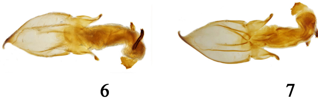
Figures 6–7. Ochodaeus chrysoloides (Schrank, 1781), aedeagus of the neotype. 6) Dorsal view. 7) Ventral view.