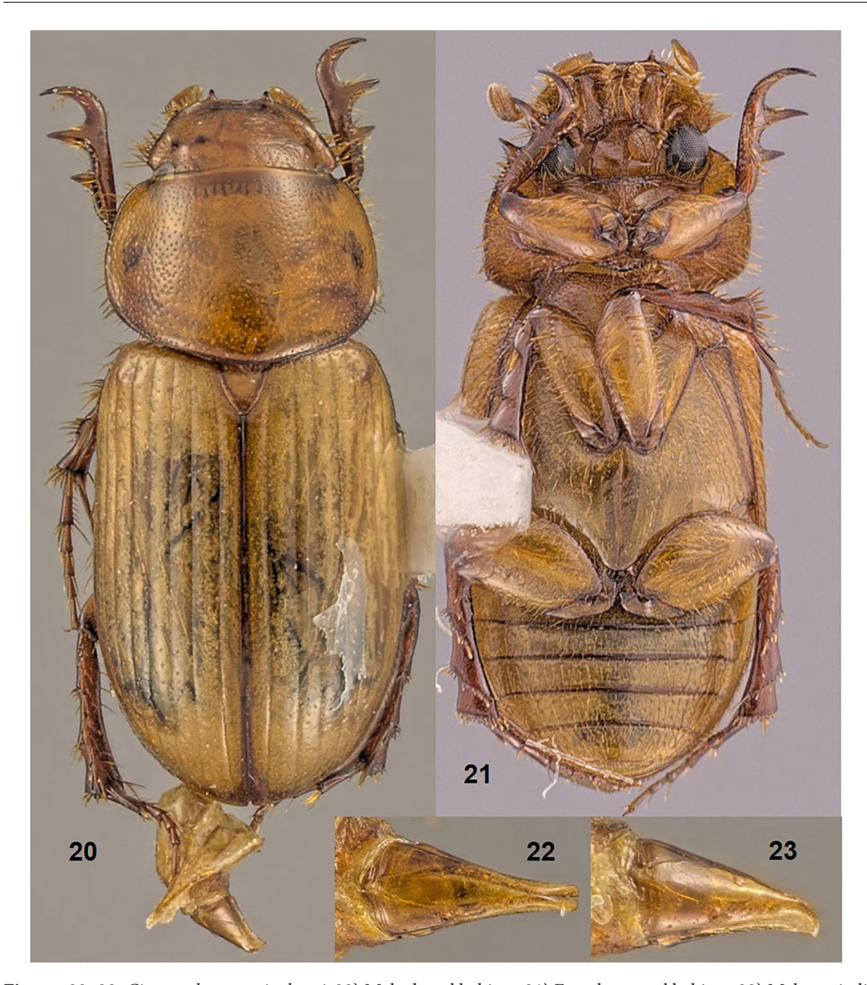
Figures 20–23. Cinacanthus cunninghami. 20 ) Male dorsal habitus. 21 ) Female ventral habitus. 22 ) Male genitalia, dorsal view of parameres. 23 ) Lateral view of parameres.

margin, tooth reflexed and extending anterodorsally; clypeofrontal suture bisinuate, front and upper clypeus finely, sparsely punctured similar to anteromedial area of pronotum, medially mostly impunctate, apical half of clypeus obscurely tuberculate-punctate, epistome between clypeal teeth with weak semicircular depression covering nearly half clypeal length; in dorsal view, eye small, about ½ of dorsal interocular width. Pronotum broad (length about ½ width), laterally explanate with fimbriate margin, widest slightly anterior to middle, posterior margin vaguely obtusely angulate, but very broadly rounded, marginal bead fine but distinct on lateral margins, obsolescent between humeri and obsolete on anterior margin, posterior angles nearly obsolete, anterior angles