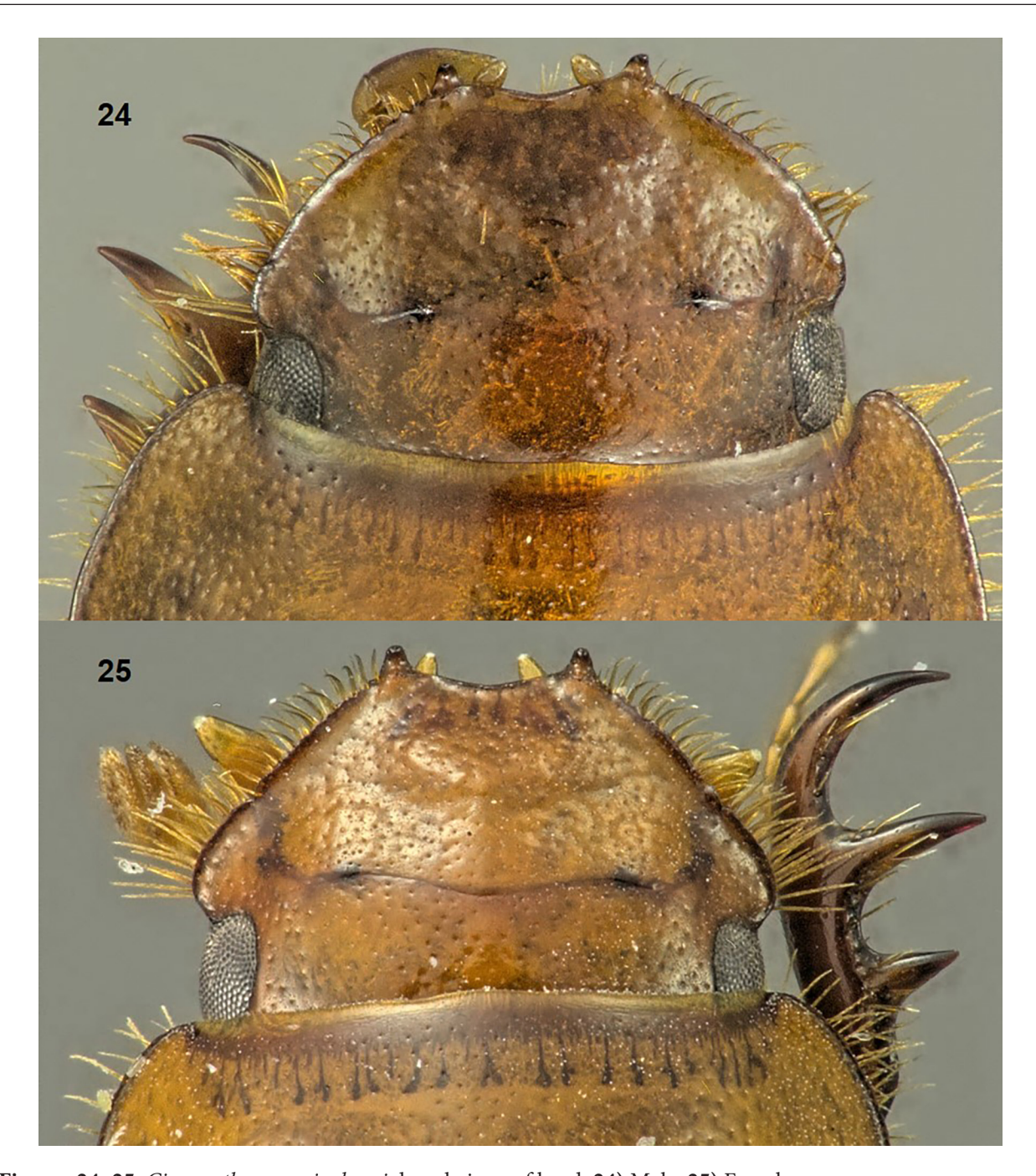
Figures 24–25. Cinacanthus cunninghami dorsal views of head. 24) Male. 25) Female.

rounded, disc in middle third moderately punctate, punctures round, mostly separated by about 1–3 times their own diameters, punctures increasing in size and density laterally, posterolaterally pronotum slightly depressed and punctures becoming even larger, elongate-subocellate and often subconfluent in longitudinal series (Fig. 26). Scutellum narrower than elytral sutural and second intervals taken together at elytral midpoint, slightly longer than wide, lateral margins convex to acutely angulate apex, disc very sparsely minutely punctate. Elytron about 2.3 times as long as pronotum, with 6 distinct, subequidistant striae between humerus and suture, striae finely punctate, punctures mostly separated by about 2–4 times their own diameters; intervals weakly convex, sparsely vaguely punctate, punctures irregular in size and placement, but mostly smaller than pronotal