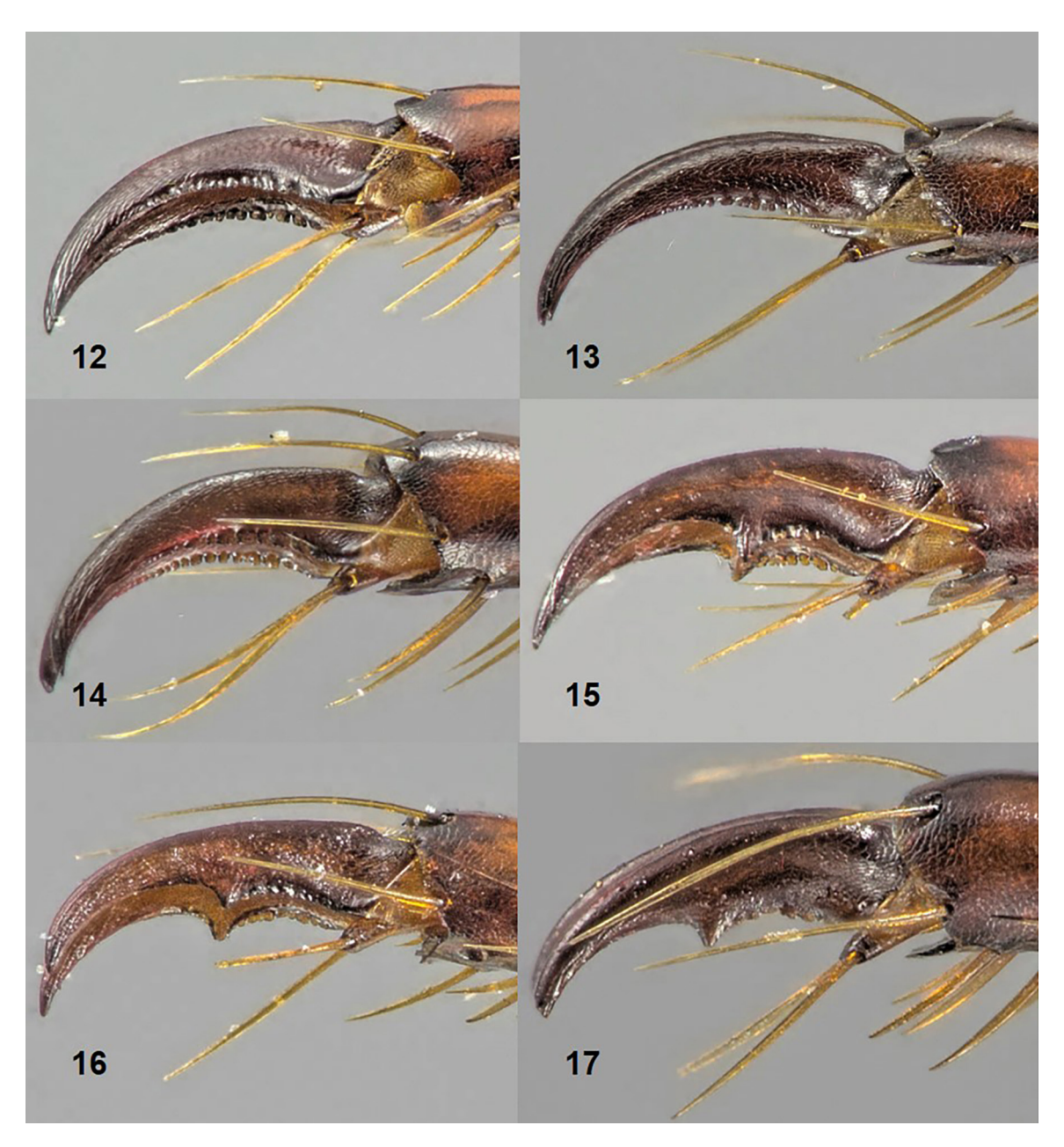
Figures 12–17. Phyllophaga benwarneri tarsal claws, lateral view. 12, 13, 14) Male pro-, meso- and metatarsi, respectively. 15, 16, 17) Female pro-, meso- and metatarsi, respectively.

113°56′02″W, 1-April-2012, at night, R.A.Cunninghham + W.B.Warner" (42m, 29f), same except: "36°53′41″N, 113°55′55″W, 1-4/April/2012, black cup pitfall traps" (1m, 1f); same except: "Beaver Dam nr jct Hwy 15 & Hwy 91, Elev. 2000′ 36 53.703N, 113 56.002W, on Oenothera , 4/5/2013 to 4/7/2013; R.H.McPeak" (38m, 28f); "USA: AZ; Mohave Co., 1880 ft., Littlefield Sand Dunes, I-15, 0.2 mi. S. of County Rd. 3454, 36°53′32″N, 113°55′55″W, 26-IV-2003, R.A.Cunningham" (14m, 4f); "USA: NV: Clark Co., 0.4 mi. W. jct. of I-15 & Hwy. 169; 3640′16″N, 114°31′49″W; May 31, 2012; dune, night; R.A.Cunningham" (1f); same except: "April 12, 2015, K.E.Schnepp" (1m); "USA: NV: Clark Co., St. Thomas Gap dunes, 36.4100°, -114.0904°; 30-IV-2018; M.A.Johnston" (1m, 1f) "USA: NV: Clark Co., Hwy. 167, nr. Echo Wash bridge, 450m, pitf. in open, DP5; 36°18′35″N, 114°29′21″W; 21.iv.2008; Suazo & Ibarra" (1f); USA: NV: Clark Co., Hwy. 167, NE jct. Valley of Fire Hwy., 465m, pitf. under shrub, GYP1; 36°26′24″N, 114°25′36″W; 21.iv.2008; Suazo & Ibarra" (1m, 1f); same except: "GYP2; 36°26′26″N,