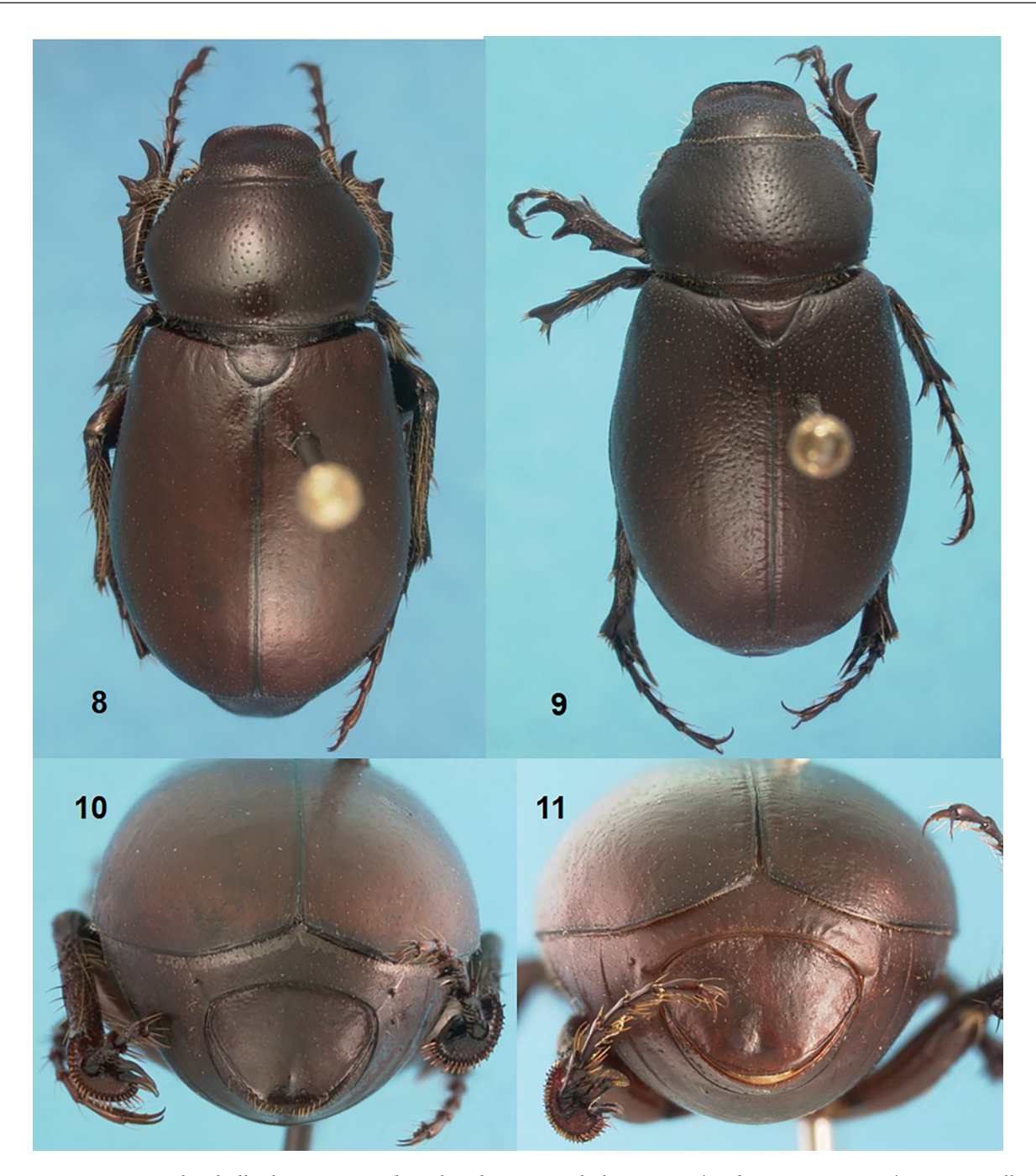
Figures 8–11. Female Phyllophaga species dorsal and posterior habitus. 8, 10 ) P. benwarneri. 9, 11 ) P. senex , Albuquerque, New Mexico.

Paratypes. 419 males, 286 females with data: Same as holotype (8m, 1f); "Beaver Dam, Mohave Co., AZ, iv-23-1984, J.P.Davidson, J.M.Davidson" (2m, 2f); same except: "I-15 W side of exit at Beaverdam, iii.21.2003, W.B. & B.C. Warner" (7f); same as holotype except: "Beaverdam; N36°53′40", W113°56′02"; iv.1.2012, night feeding & mate on Oenothera flowers; W.B.Warner" (47m, 66f); same except: iv.14.2015 (77m, 50f); same except: "G.S.Powell" (17m, 7f); same except: "K.E.Schnepp" (25m, 15f); same except: "iv-20-2014, feeding on Oenothera deltoides at night; W.B.Warner" (64m, 36f); same except: "iv.2-v.18.2012; barrier pitfall/ "fake burrow" blk. cups" (20m, 5f); same except: "1,916 ft., Beaverdam, feeding / mating on flowers + leaves of Oenothera , 36°53′40″N,