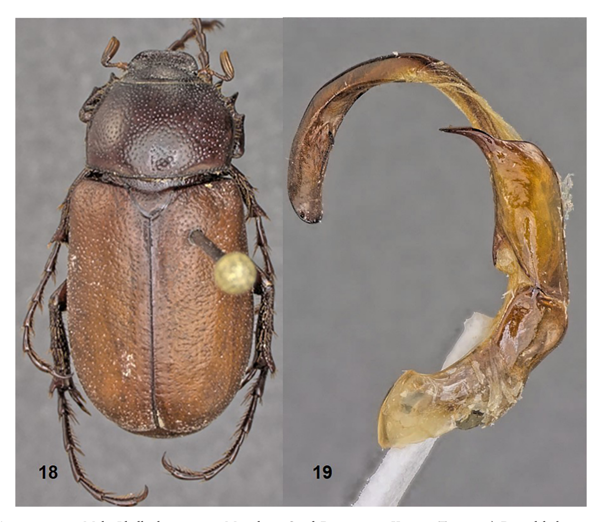
Figures 18–19. Male Phyllophaga senex , Monahans Sand Dunes near Kermit, Texas. 18) Dorsal habitus. 19) genitalia, lateral view.

114^{\circ}25'31''W'' (5m); same except: "pitf. in open" (1m, 2f); same except: "GYP3; 36^{\circ}26'24''N , 114^{\circ}25'31''W'' (1m, 5f); same except: "pitf. under shrub" (19m, 13f); "USA: NV: Clark Co., Hwy. 167, W jct. Rt. 12; 430m; pitfall in open GYP4; 36^{\circ}26'17''N , 114^{\circ}24'46''W ; 21.iv.2008; Suazo & Ibarra" (2m, 5f); same except: "pitfall under shrub" (8m, 1f); same except: "GYP5; 36^{\circ}26'17''N , 114^{\circ}24'43''W'' (19m, 2f); same except: "pitfall in open" (6m, 3f).