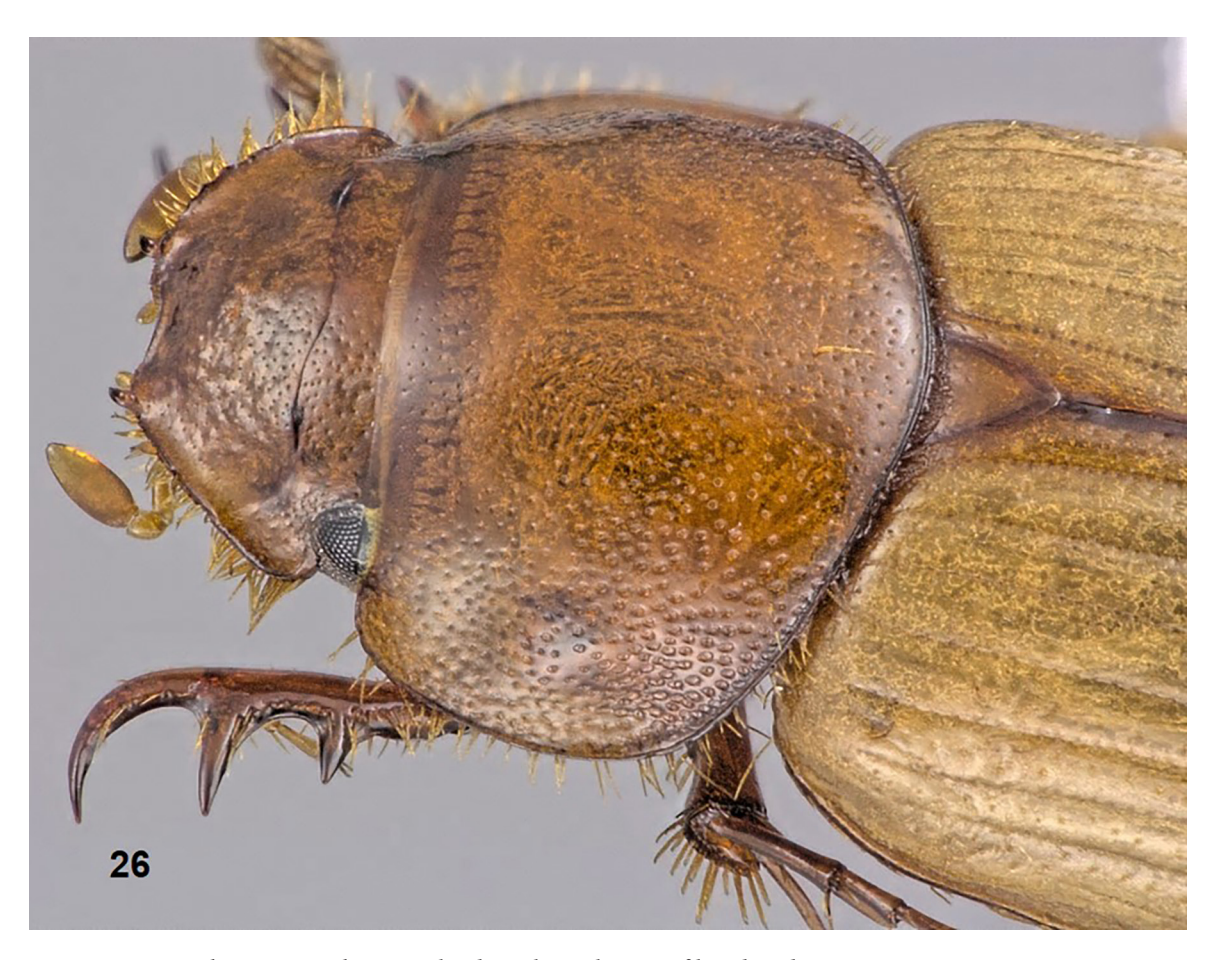
Figure 26. Cinacanthus cunninghami male, dorsolateral view of head and pronotum.

punctures; posterolaterally punctures setigerous, setae short, erect. Venter (Fig. 21) with metasternite in middle third somewhat coarsely, sparsely punctate, setigerously punctate in lateral thirds, with broad shiny impunctate subtriangular area along posterior margin at each side, metasternal midline impressed; abdominal ventrites sparsely setigerously punctate. Legs delicate and narrow, protibia tridentate, teeth unusually long and narrow, basal tooth at about basal third of tibia, apical tooth evenly curving outward from middle tooth; spur obsolescent, minute and appressed to tibia, extending to about basal third of first protarsomere; meso- and metafemur with anteroventral sixth or so (i.e. area along posterior margin of normally "ventral" face in repose) in basal two thirds with setigerously and subcontiguously punctulate patch, this area declivous and flattened, setae in patch subdecumbent, golden (Fig. 27); anterior femoral face at about ventral third with single line of darkened coarse setae in about distal ½; metatibia subequal in length to metatarsus. Genitalia (Fig. 22–23) with parameres unadorned and subtriangular in lateral view, similar to those of other Cinacanthus species.