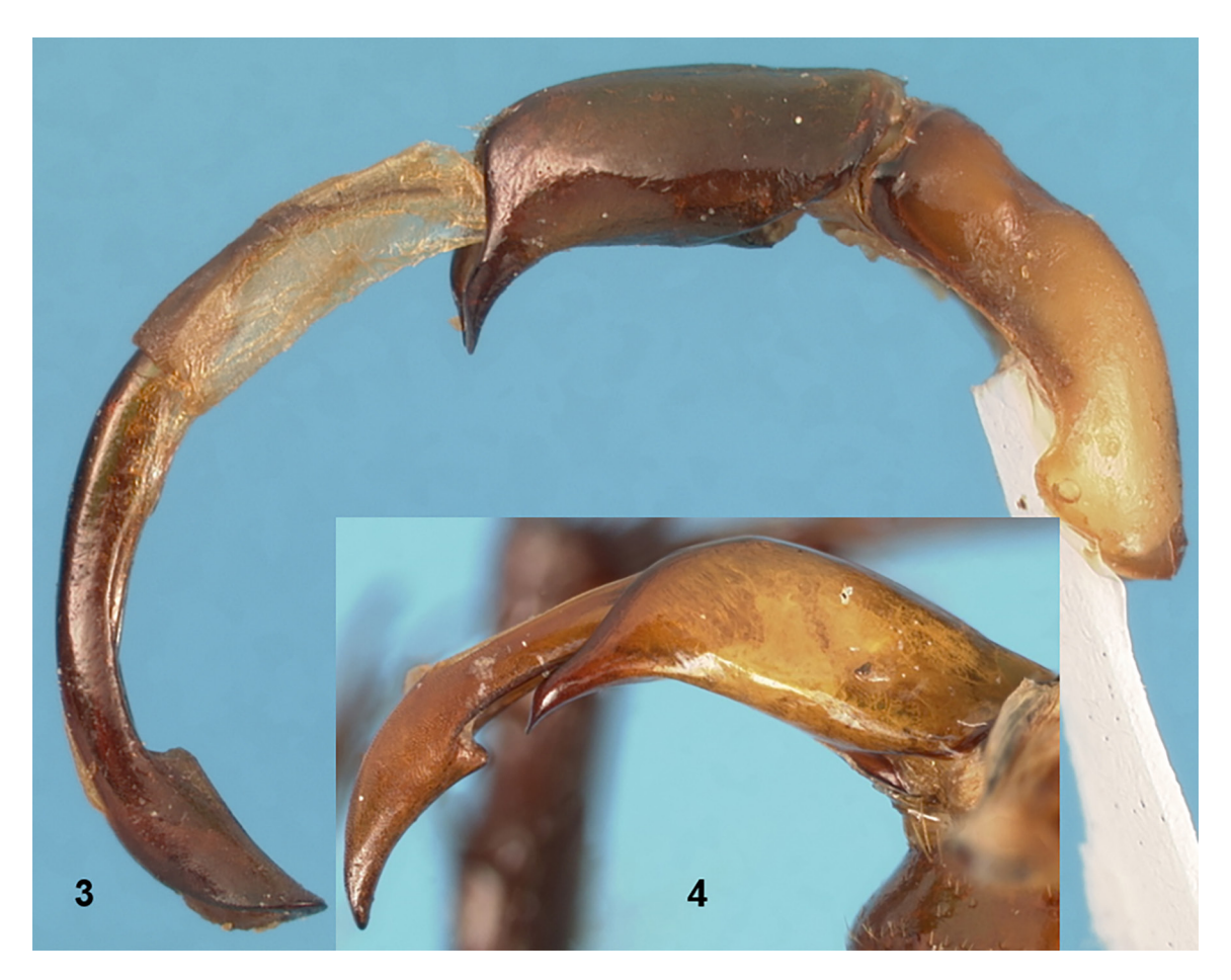
Figures 3–4. Male genitalia of Phyllophaga species, lateral view. 3) P. senex , Albuquerque, New Mexico. 4) P. benwarneri.