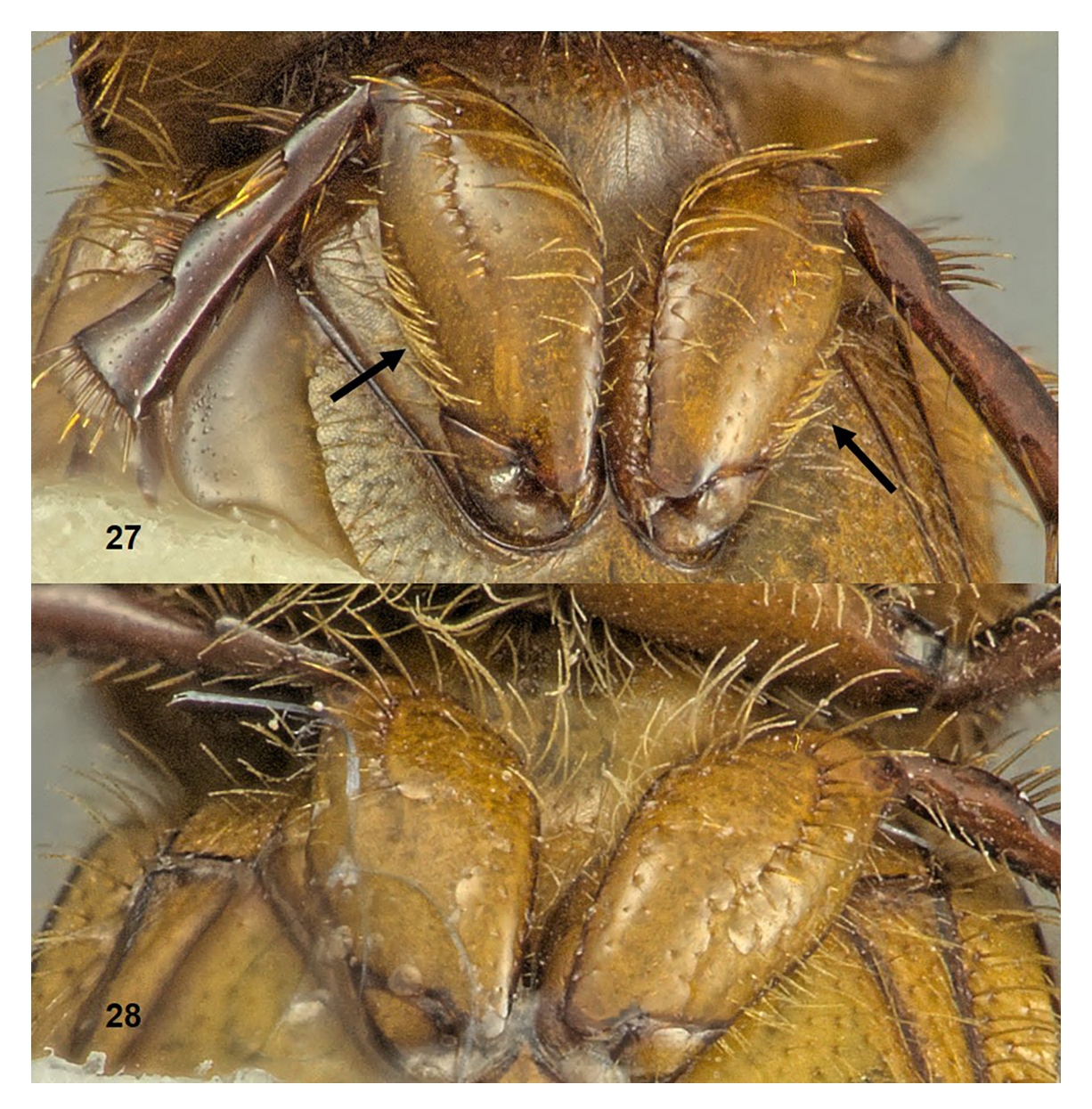
Figures 27–28. Cinacanthus cunninghami ventral views of mesofemora. 27 ) Male (arrows indicating setal tufts). 28 ) Female, setal tufts lacking.

Variation. Males: Length 5.2–6.3 mm, widest width 2.4–2.9 mm. Females: Length 5.8–6.7 mm, widest width 2.6–2.9 mm. Other than variation in size, muting of setal length through wear, and vague color differences, the paratypes are remarkably uniform. Some females have one or both protibial spurs missing (lost; socket present); some males have a tiny, almost setiform protibial spur on one or both sides, spur being less than half size of female spur.